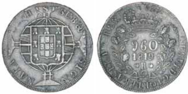
2901* Brazil , John VI, 960 reis, 1819R (Rio) struck over a Ferdinand VII eight reales (KM.326.1). Uneven strike, good very fine.