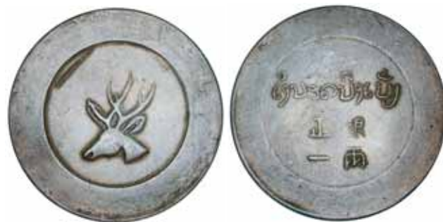
3010* Indo China or Burma , silver tael, c.1943, possibly made in Hanoi, obv. in Burmese and Chinese, 'genuine silver one tael', rev. stag head in linear circle, (36.98 g) (KM.A3 [French Indo China, p.748], Kann 939). Extremely fine.