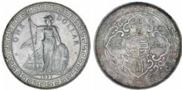
2907 British Trade Dollars , 1900B, 1925, 1930 (KM.T5). Very fine - good very fine. (3)