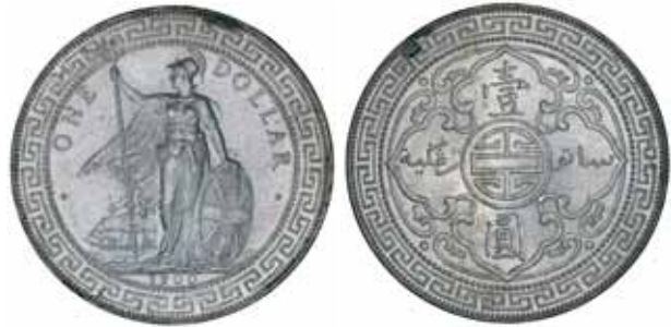
2906* British Trade Dollar , 1900B (KM.T5). Uncirculated.