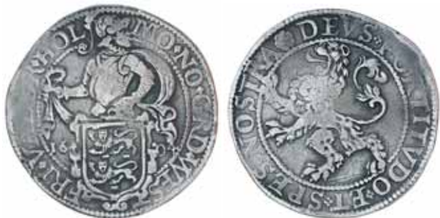
3086* Netherlands Low Countries , West Friesland Province, leeuwendaalder (lion daalder), 1604, rosette mintmark, (KM.12, D.4868, Del.835). Weak in places, otherwise nearly very fine and a rare variety with date between arms, rare. $150