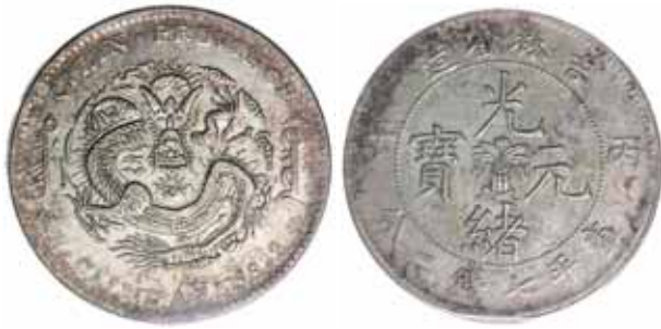
2949* China , Kirin Province, under Empire, silver dollar, dated 1899, (KM.Y.183). Toned, good very fine.