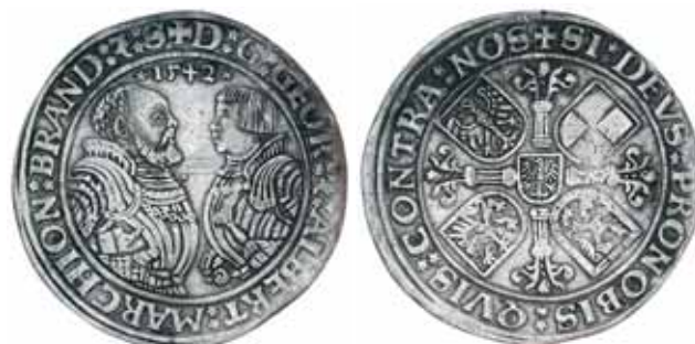
3013* Germany , Brandenburg-Franconia, Georg of Ansbach and Albrecht the Younger of Bayreuth, (1538-1545), silver taler; dated 1542, obv. +D G GEORG & ALBERT MARCHION BRAND & S, bust of Georg and Albert facing each other 1542 above, rev. SI DES PRONOBIS QVIS CONTRA NOS, floriated cross and four arms in angles and one at juncture, (D.8967). Very fine or better and rare.