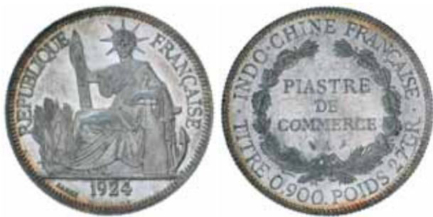
3007* French Indo China , one piastre, 1924A (KM.5a.1). Considerable mint bloom, uncirculated.