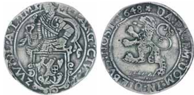
3089* Netherlands Low Countries , Zwolle city, leeuwendaalder (lion daalder), 1648, fleur mintmark, (KM.14.2, D.4885, Del.866b). Lightly toned, nearly very fine and rare. $150