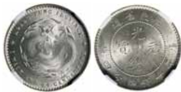
2951* China , Kwangtung Province, under Empire, silver twenty cents, undated (1890-1908) (KM.Y.201). With full mint bloom brilliant uncirculated.