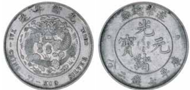
2954* China , under Empire, general issue, central mint at at Tientsin, silver dollar, 'Tai Ching Ti Kuo', undated (c.1907), (26.84 g), (KM.Y.14). Bright, good very fine.