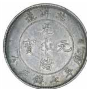
2937* China , Chihli Province, under Empire, silver dollar; Pei Yang Arsenal type, year 25 (1899) (26.71 g), (KM.Y.73). Bright, very fine.