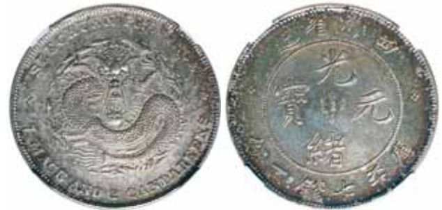
2953* China , Szechuan Province, under Empire, silver dollar, undated (1901-8) (KM.Y.238). Toned, nearly uncirculated, rare.