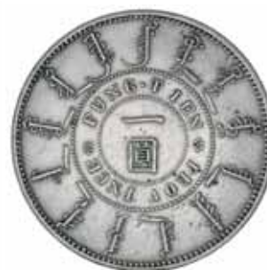
2939* China , Fengtien Province, under Empire, silver dollar, Yr 24 (1898), (26.80 g), (KM.Y.87). Lightly toned, extremely fine, rare.