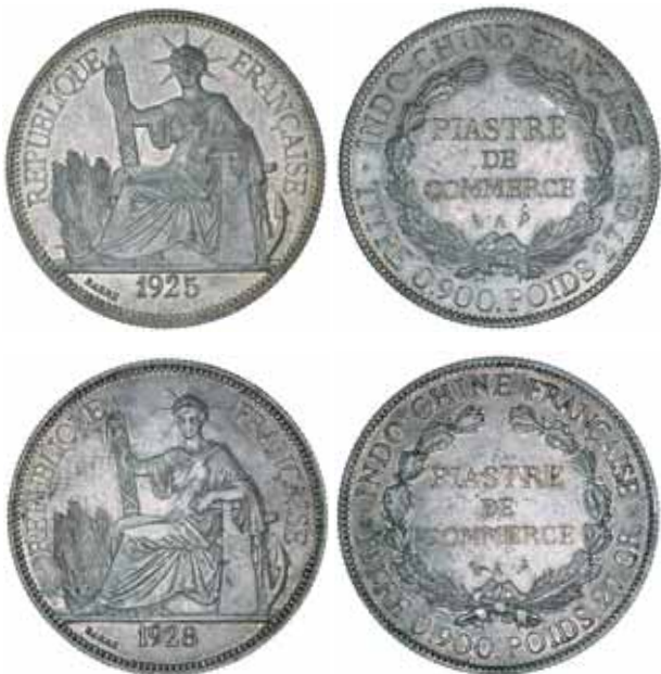
3009* French Indo China , one piastre, 1925A-1928A (KM.5a.1). Some mint bloom, nearly extremely fine - good extremely fine. (4)