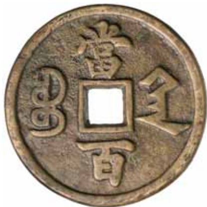
2934* China , Qing (Ch'ing) Dynasty (1644-1911), Emperor Wen Zong (1851-1861), 65mm, one hundred cash coin, Xi'an, Shaanxi mint, (58.16 g), (Hartill 22.959 [R11], Sch. -, TFP 2500). Very fine, very scarce.