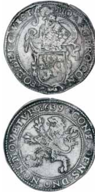
3088* Netherlands Low Countries , West Friesland Province, leeuwendaalder (lion daalder), 1639, Fleur de lis mintmark, (KM.14.2, D.4870, Del.836). Very fine and scarce. $200