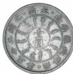
2936* China , Chihli Province, under Empire, silver dollar, Pei Yang Arsenal type, year 23 (1897), (26.93 g), (KM.Y.65.1). Very fine and rare.