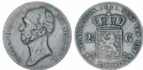
3090* Netherlands , William II, two and a half gulden, 1841 (KM.69.1). Good fine and rare. $400