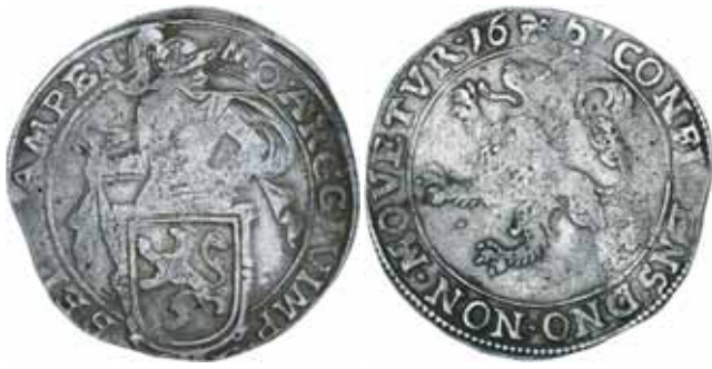
3084* Netherlands Low Countries , Kampen city, leeuwendaalder (lion daalder), 1667, Moors head mintmark, (KM.35.3, D.4879, Del.862). Lightly toned, nearly very fine and rare. $150