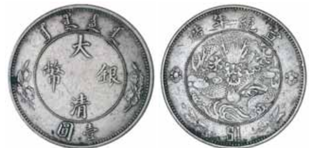
2955* China , under Empire, general issues, central mint at Tientsin, under Hsuan Tung, silver 'Pattern' Dollar, ND (1910), obv. Chinese and Manchu legend, rev. dragon within circle, "$1" below (KM.Y.219, Kann 219). Minor surface marks, very fine or better and very rare.