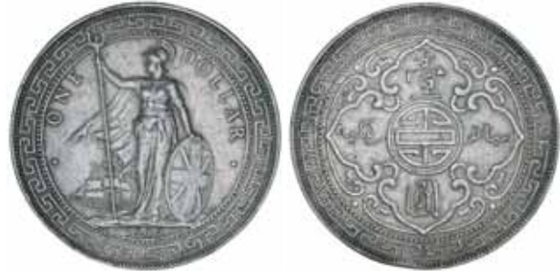
2905* British Trade Dollars , 1898(B) (2), 1899B (KM.T5). Very fine - extremely fine. (3)