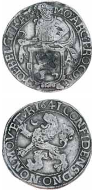
3085* Netherlands Low Countries , Utrecht Province, leeuwendaalder (lion daalder), 1641, no mintmark, (KM.32.2, D.4863, Del.856). Dark spots, very fine and scarce. $150