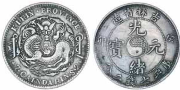
2950* China , Kirin Province, under Empire, silver dollar, obv. beady eyed dragon symbol in centre, cd 1903, (KM.Y.183a.2). Lightly toned, very fine and very scarce.