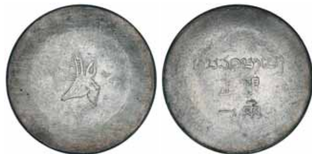
3011* Indo China or Burma , silver tael, c.1943, possibly made in Hanoi, obv. in Burmese and Chinese, 'genuine silver one tael', rev. stag head in linear circle, (37.21 g) (KM.A3 [French Indo China, p.748], Kann 939). Worn, good fine.