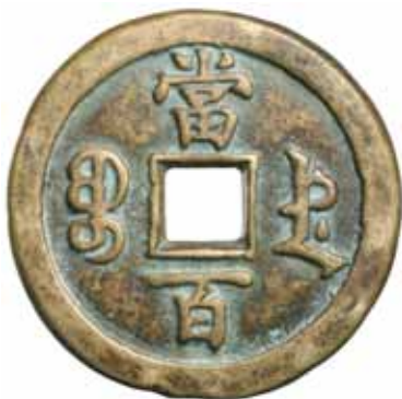
2935* China , Qing (Ch'ing) Dynasty (1644-1911), Emperor Wen Zong (1851-1861), 48 mm., AE one hundred cash coin, Zhili Mint, (45.87 g), issued 1854-1855, (Hartill 22.1063, Sch. -, TFP 2534). Very fine and rare.