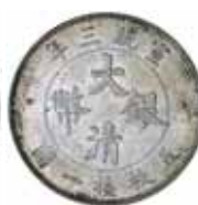
2938* China , Chingkiang, under Empire, Hsuan tung, year 3, silver twenty cents, rev. dragon, (KM.Y.29). Brilliant, extremely fine or better.