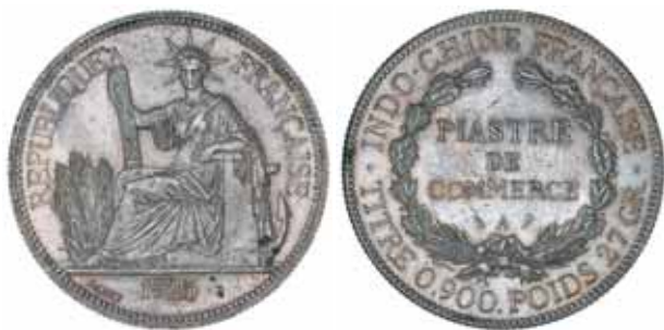
3008* French Indo China , one piastre 1925A (KM.5a.1). Underlying mint bloom, nearly uncirculated.