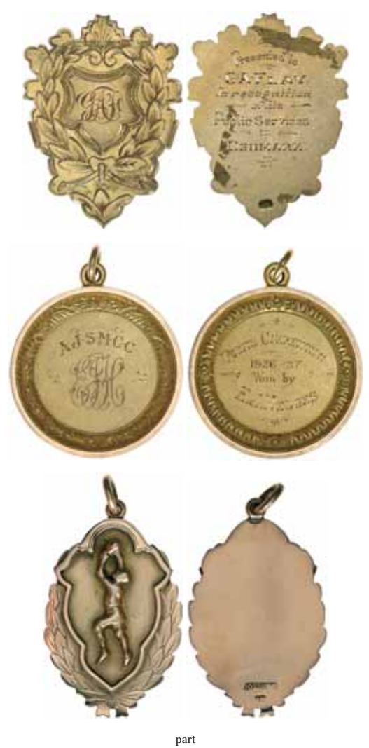
720* Gold fob award medals, 15 carat 'C.A.Flay ... for Public Services .. in Denmark' (West Australia) (40x30mm, 7.25g); Points Competition, 1926-27, won by E.J.Hodges A.J.S.M.C.C in 15 carat gold (33mm; 14.57g); 9 carat by Goldings for AFL (uninscribed)(38x25mm; 3.92g); plus silver by WJD, hallmarked Birmingham. Fine - very fine. (4)