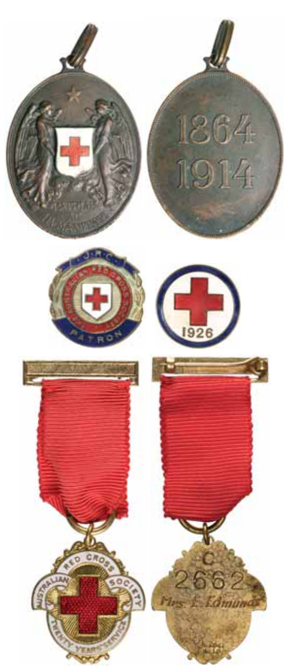
lot 776 part