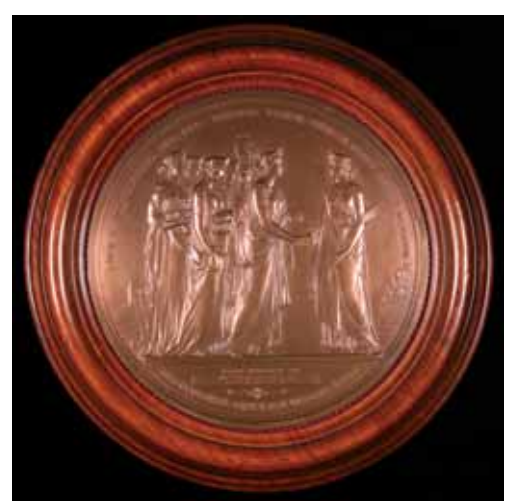
660* Intercolonial Exhibition , Victoria, 1866-67, in bronze (220mm) uniface electrotype by C.Summers, awarded to 'J.Politz & Co', impressd in relief. Mounted in a wooden frame (glazed), good extremely fine.