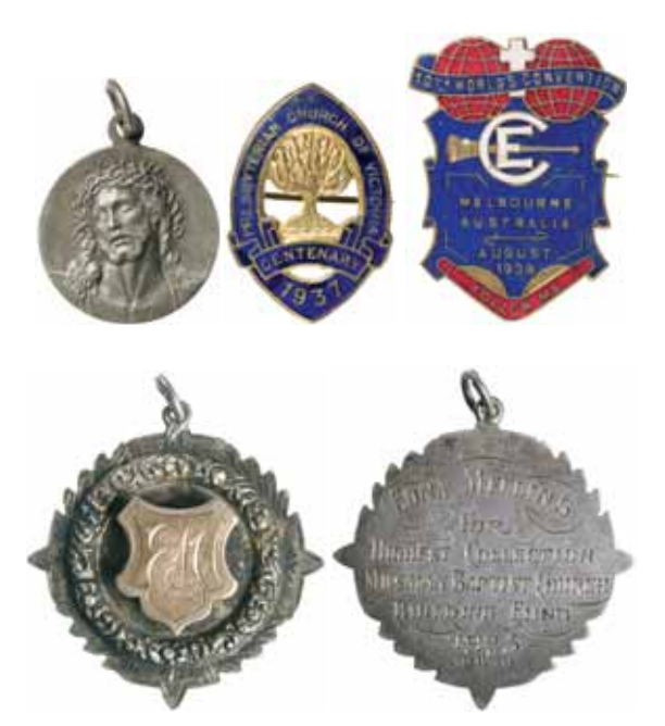
lot 718 part