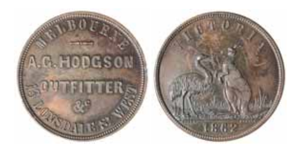
Hodgson, A.G., Melbourne penny, 1862 (A.257). Dark grey brown tone, lacquered, otherwise nearly uncirculated. $300

Ex Spink Australia Sale 38 (lot 603) and Noble Numismatics Sale 79 (lot 869)