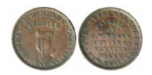
Mears, J.W., Wellington halfpenny, undated (A.362). Edge bruises and surface marks, some carbon patches within the devices, otherwise very fine and rare.