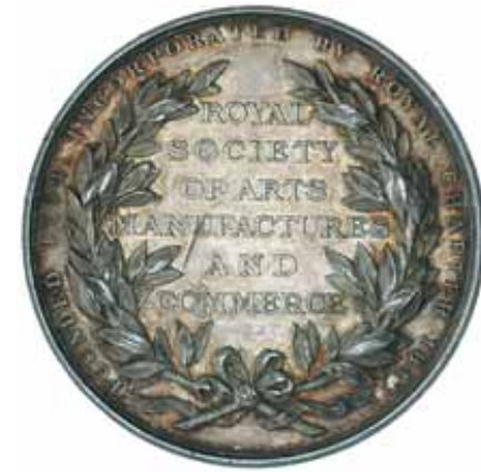
lot 662 part