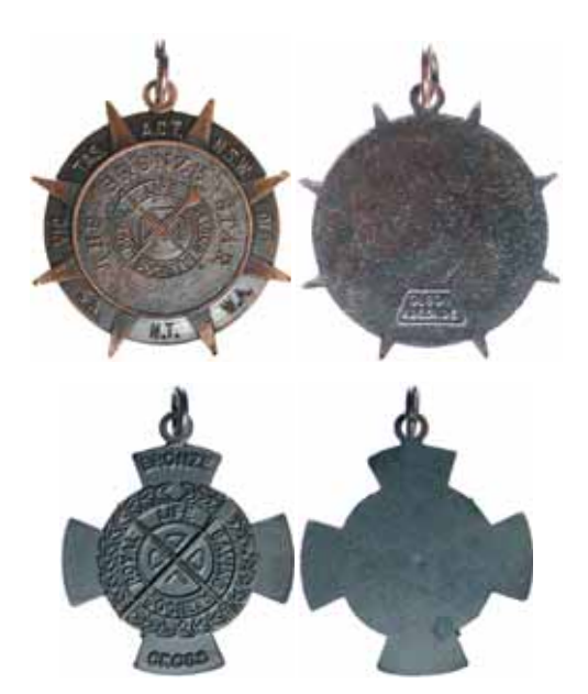
lot 699 part