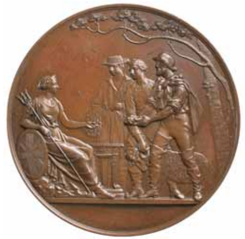
659* Melbourne Exhibition, Victoria, 1854, in bronze (64mm) by J.S.Wyon, edge impressed 'Prize Medal 101 W.Gripe Specimens of Moulding' (C.1854/2). In fitted case (faded), some spotting on obverse, edge bruise, otherwise good extremely fine.