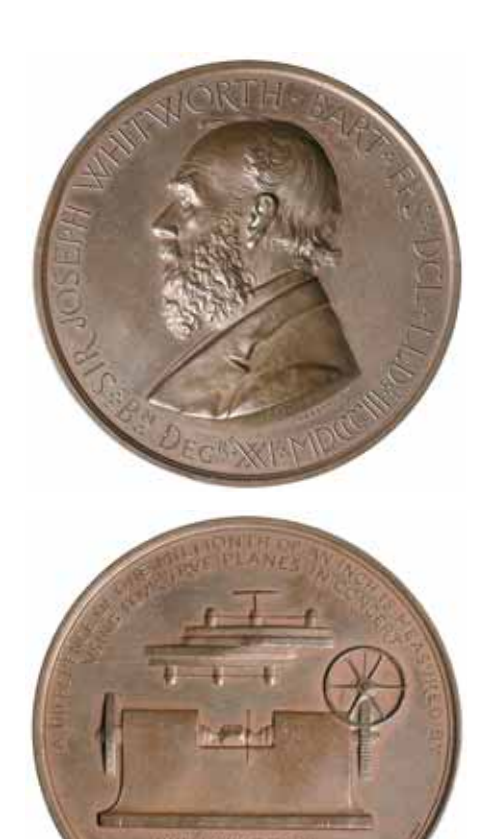
lot 662 part