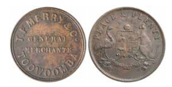
Merry, T.F. & Co., Toowoomba penny, undated (A.367). Extremely fine.