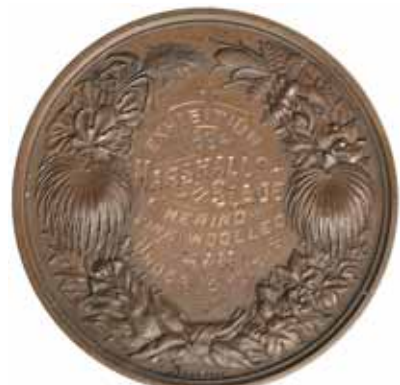
lot 693 part