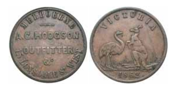
557* Hodgson, A.G., Melbourne penny, 1862 (A.257). Very fine.

Ex Spink Australia Sale 38 (lot 603) and Noble Numismatics Sale 79 (lot 869)