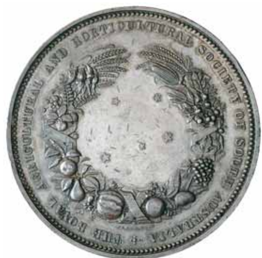
711* Royal Agricultural and Horticultural Society of South Australia, (undated), in silver (69mm) by J.S.& A.B.Wyon, edge inscribed 'Awarded to Castle Salt Co-op Co Ltd For Collection of Salt - Sept 1917'. Edge nicks, very fine.