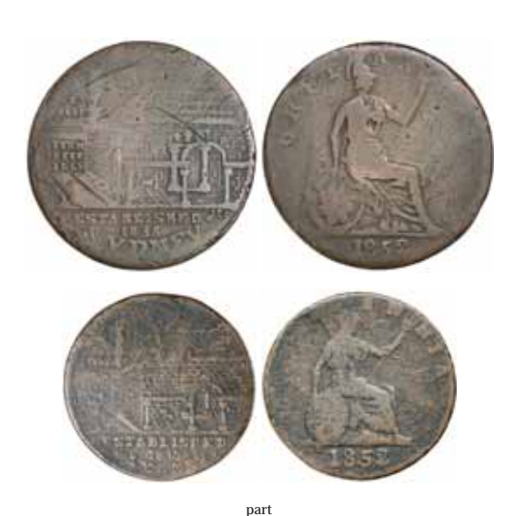
571* Peek & Campbell - Sydney Tea Stores, Sydney pennies and halfpennies, 1852 (A.426 [illustrated], 428 [upset 90 degrees to the left], 430 [illustrated]) and 1853 (A.431) by J.C.Thornthwaite. Good - very good. (4)