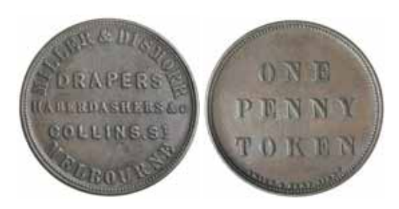
Miller & Dismorr, Melbourne penny, undated (A.375). Dark brown patina, very fine.