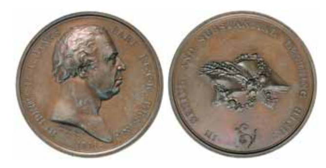
652* Sir Joseph Banks, memorial medal, 1816 in bronze (40mm) by W.Wyon and T.Wyon, June (Eimer 1088, BHM 911). Good extremely fine.