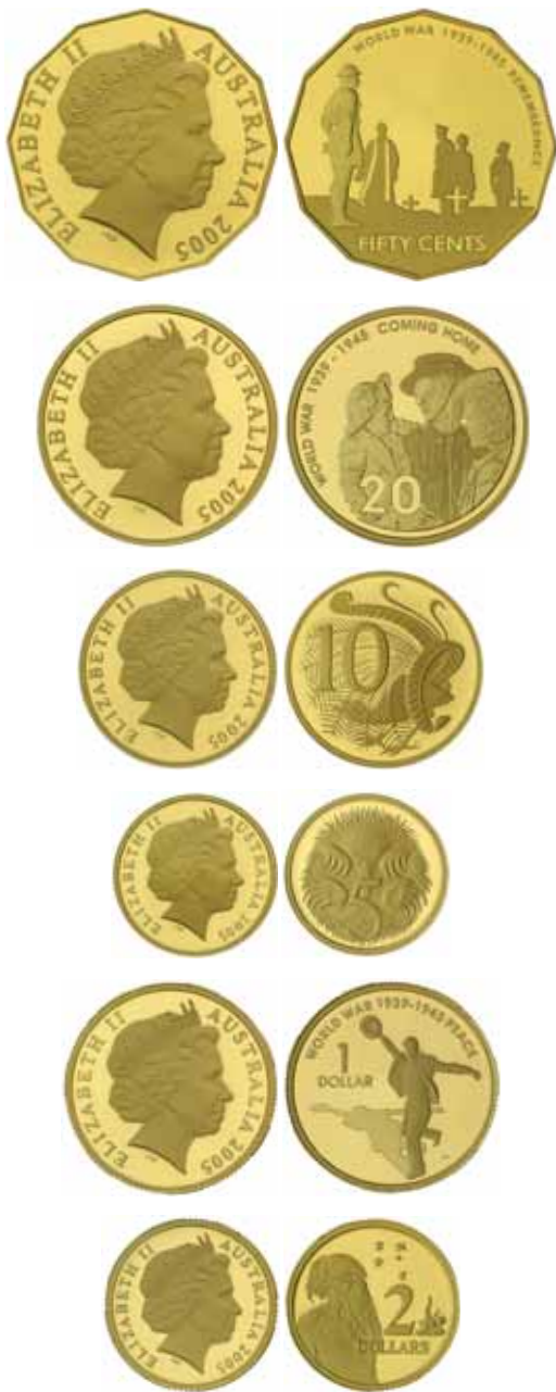
757* Elizabeth II , proof gold six coin set, 2005. In case of issue with certificate 096, FDC.