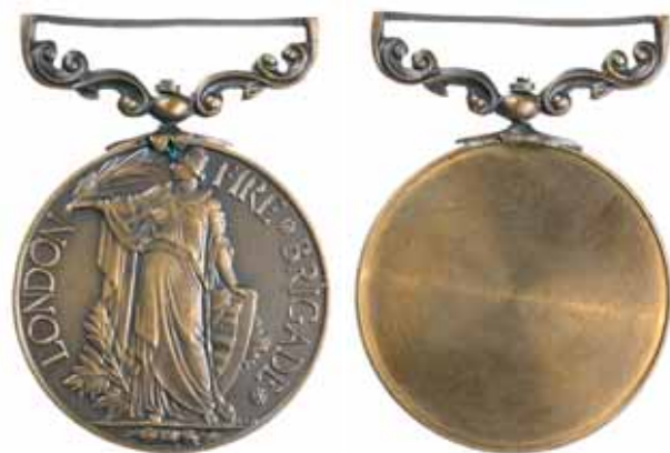
987* London Fire Brigade Medal , long service, in bronze, ornately designed suspension bar, unmarked. Extremely fine. $240 Very rare, specimen.