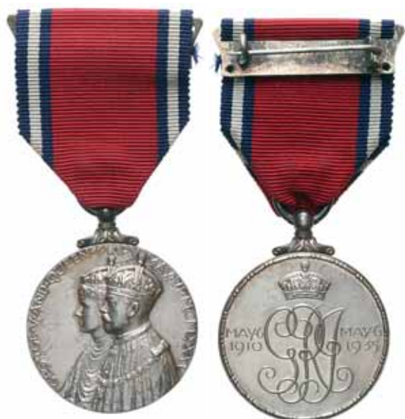
998* Jubilee medal, 1935 , King George and Queen Mary jubilee medal, in silver, on obverse, George and Queen Mary May VI MCMXXXV, on reverse, 1910-1935 and GRI. Very fine. $50