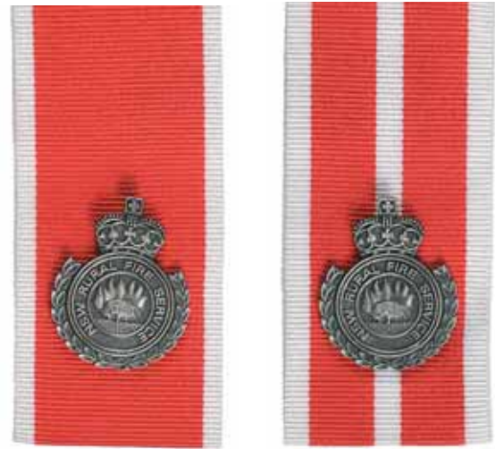
1021* Australia, NSW, Rural Fire service, commissioners commendation , w/m screw back on ribbon; Australia, NSW, Rural Fire service, commissioners commendation for bravery , w/m screw back on ribbon. Uncirculated. (2) $320