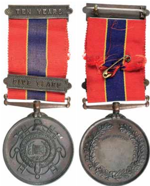
1002* National Fire Brigades Union, long service, ten years , five years clasp, in bronze. Extremely fine. $150