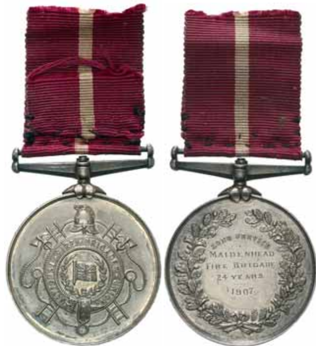
986* National Fire Brigades Association , 1907, long service, in silver, named to, Maidenhead Fire Brigade, twenty four years. Extremely fine. $180