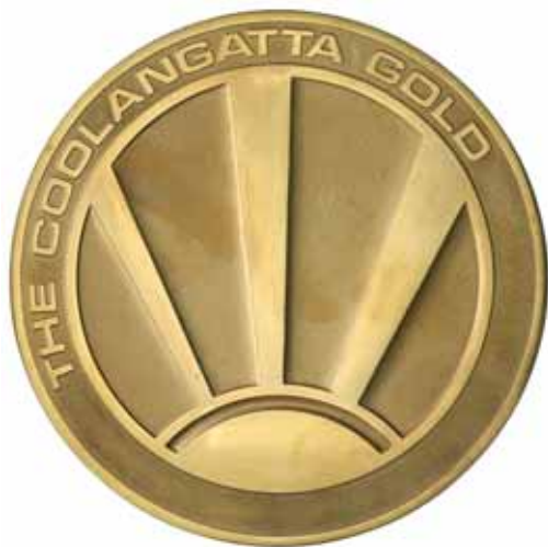
lot 941 part