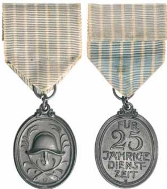
lot 1040 part