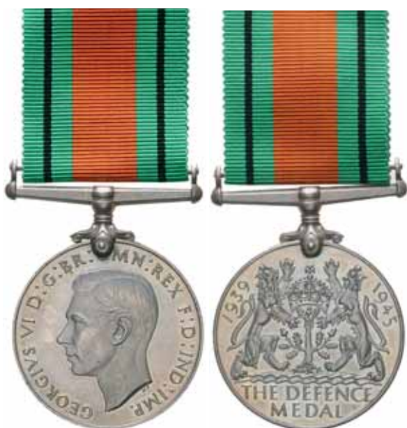
1001* Defence Medal, 1939-1945 , original mailing box, ribbon and medal separate within box, unnamed. Uncirculated. $50