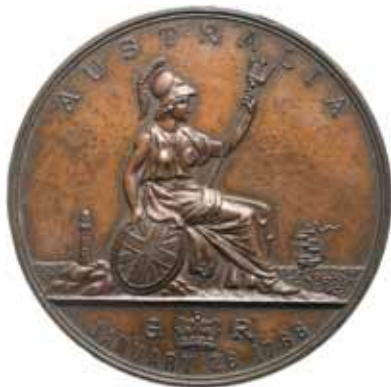
lot 913 obverse