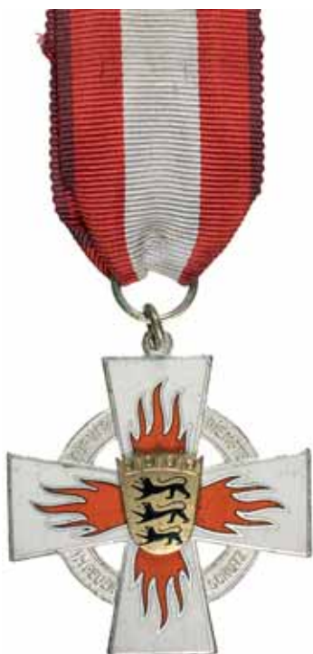
lot 1050 part

Fur Verdienste im feuerschutz (For Merits in Fire Protection).