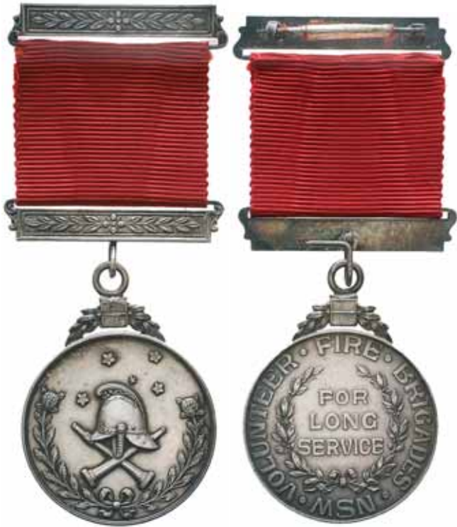
1019* New South Wales volunteer service medal, Long Service Medal , in silver with ribbon and buckle bar. Very fine. $200