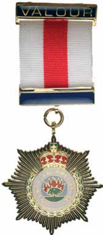
1020* Australia, NSW, Rural Fire Service, commissioner's medal for valour , gold gilt and enamelled obverse, buckle bar and suspension bar enamelled. Uncirculated. $300