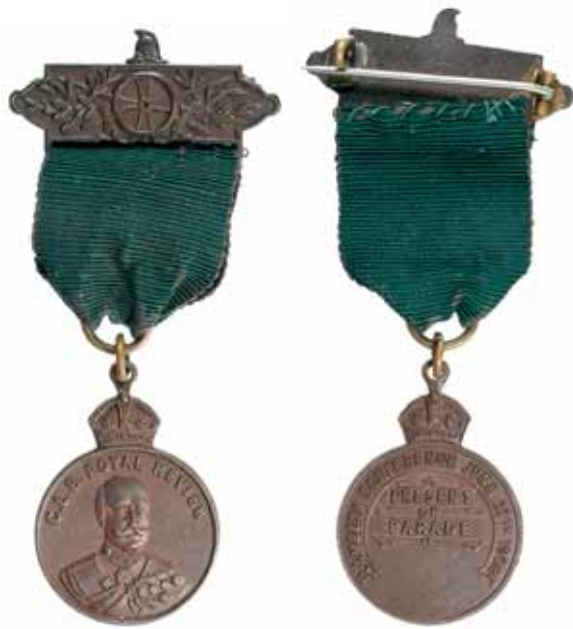
988* Fire Brigade Parade Medal , London, 1908, on obverse, G.L.B Royal Review, on reverse, Lambeth Conference June 27th 1908. Very fine.