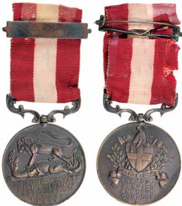
989* London Private Fire Brigades Association , long service and good conduct medal with ribbon and buckle bar, in bronze. Very fine.