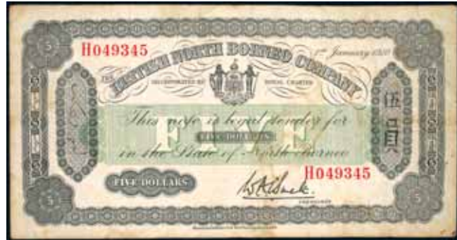
3839* British North Borneo , The British North Borneo Company, five dollars, 1st January 1940, H 049345 (P.30). Good body, centre fold line on back, otherwise very fine and scarce thus.