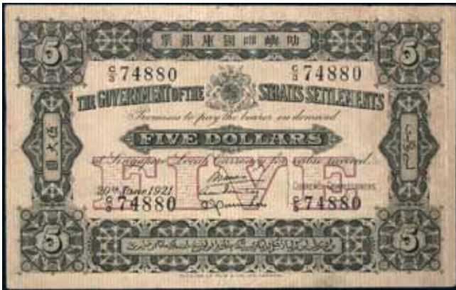
4035* Straits Settlements , The Government of the Straits Settlements, five dollars, 20th June 1921, C/3 74880 (P.3). Very fine and rare.