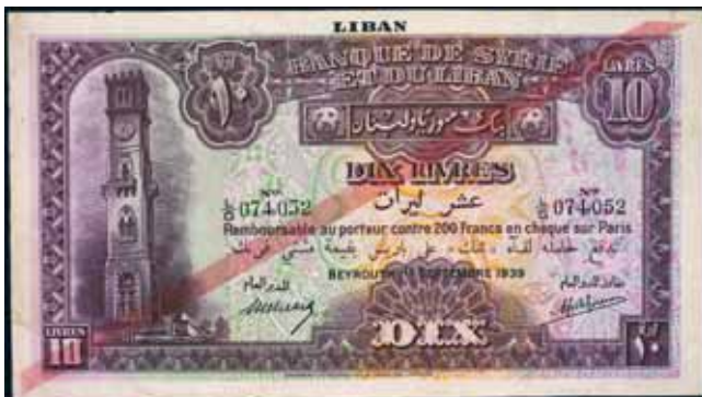
3974* Lebanon , Banque de Syrie et du Liban, provisional issue, ten livres, 1st September 1939, No. L/G 074, 052 (P.28a). Nearly very fine.