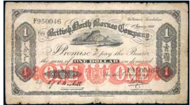
3833* British North Borneo , The British North Borneo Company, one dollar, 1st January 1930, F 950046 (P.20). Centre fold perforation hole in centre, very good and scarce.