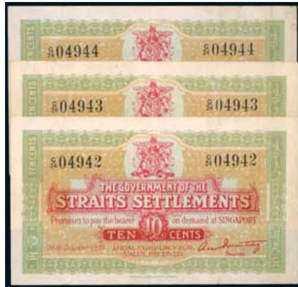
4036* Straits Settlements , The Government of the Straits Settlements, ten cents, 14th October 1919, G/24 04942/4 consecutive trio (P.8b); Malaya, Board of Commissioners of Currency, ten cents, 1st July, 1941 (P.8). The last uncirculated, others extremely fine or better, and rare thus. (4)