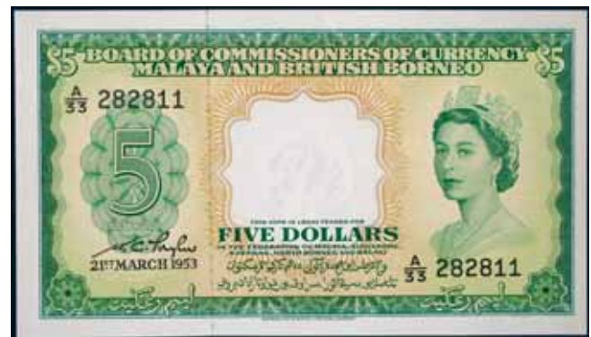
3997* Malaya and British Borneo , Board of Commissioners of Currency, Elizabeth II, five dollars, 21st March 1953, A/33 282811 (P.2a). Uncirculated .