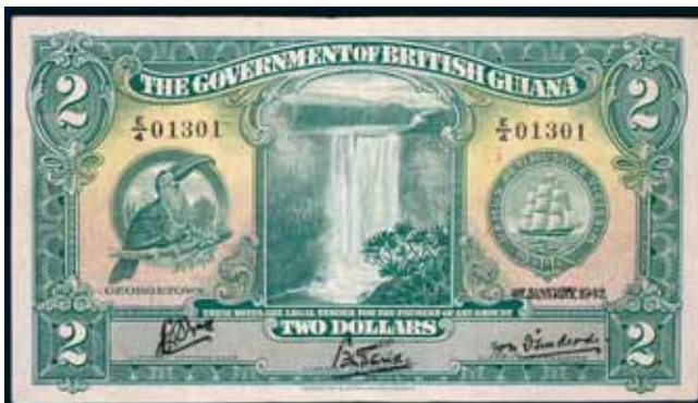
3831* British Guiana , The Government of British Guiana, two dollars, 1st January 1942, E/4 01301 (P.13c). Good fine and rare.