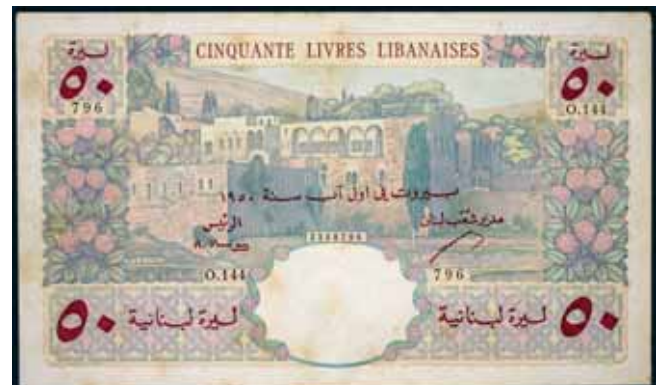
3977* Lebanon , Banque de Syrie et du Liban, fifty livres, 1.8.1950, O.144 796 (P.52a). Slight staining, otherwise good very fine.