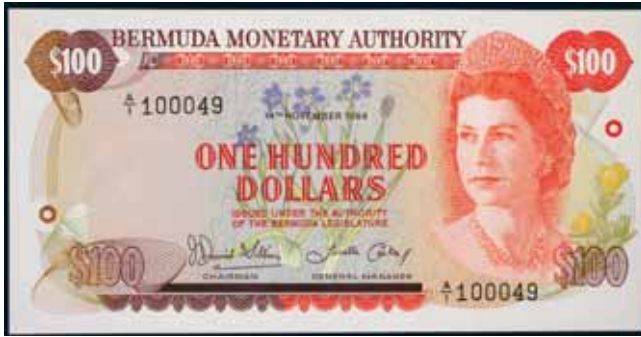
3830* Bermuda , Bermuda Monetary Authority, Elizabeth II, one hundred dollars, 14th November 1984, A/1 100049 (P.33b). Uncirculated and rare.