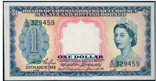
3996* Malaya and British Borneo , Board of Commissioners of Currency, Elizabeth II, one dollar, 21st March 1953, A/35 329459 (P.1a). Uncirculated .