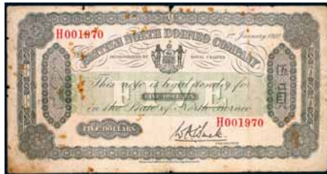
3840* British North Borneo , The British North Borneo Company, five dollars, 1st January 1940, H 001970 (P.30). Rust spots and perforations, otherwise good colour, very good.