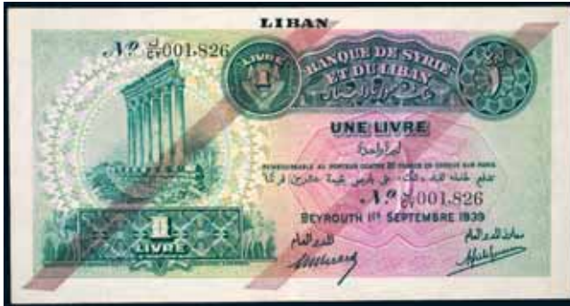
3972* Lebanon , Banque de Syrie et du Liban, provisional issue, one livre, 1st September 1939, No. J/CY 001, 826 (P.26b). Extremely fine.