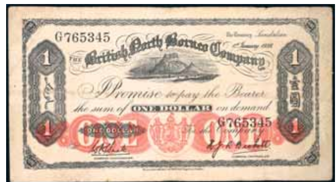
3835* British North Borneo , The British North Borneo Company, one dollar, 1st January 1938, G 765345 (P.28). Very fine.