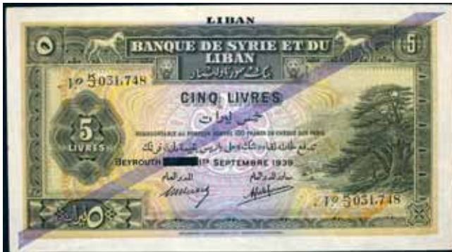
3973* Lebanon , Banque de Syrie et du Liban, provisional issue, five livres, 1st September 1939, No K/J 031, 748 (R.27a). Good very fine.