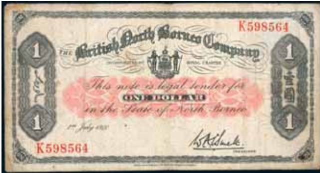
3836* British North Borneo , The British North Borneo Company, one dollar, 1st July 1940, K 598564 (P.29). Three vertical folds, otherwise very fine.