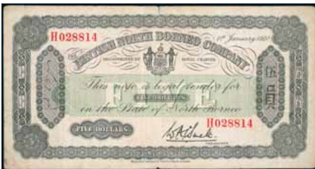
3838* British North Borneo , The British North Borneo Company, five dollars, 1st January 1940, H 028814 (P.30). Slight splitting at ends of centre fold, one minute pin hole, otherwise very fine.