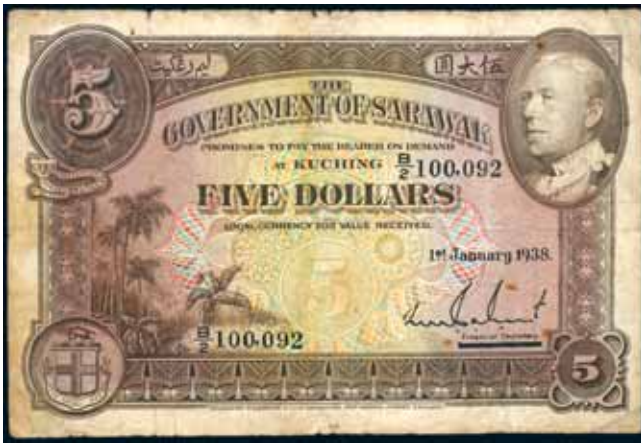
4024* Sarawak , The Government of Sarawak, five dollars, 1st January 1938, B/2 100,092 (P.21). Frayed edge at top, perforations on quarter folds, very good or better.