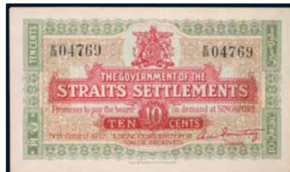
4038* Straits Settlements , The Government of the Straits Settlements, ten cents, 14th October 1919, E/58 04769 (P.8a). Crisp, good extremely fine.