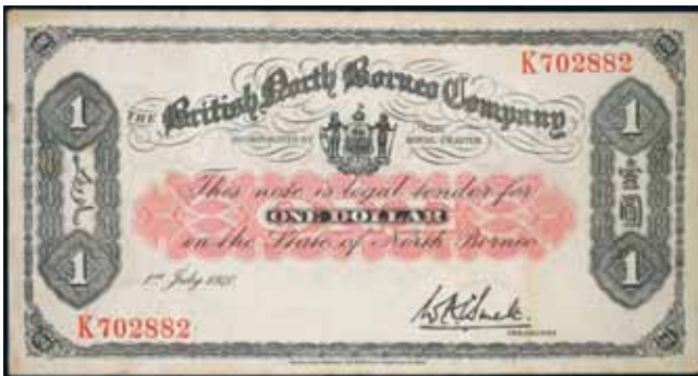
3837* British North Borneo , The British North Borneo Company, one dollar, 1st July 1940, K 702882 (P.29). 'Eddy' pencilled on back, tiny ink or other stains on back, otherwise good very fine.