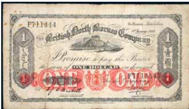
3832* British North Borneo , The British North Borneo Company, one dollar, 1st January 1930, F 711444 (P.20). Good fine and rare.