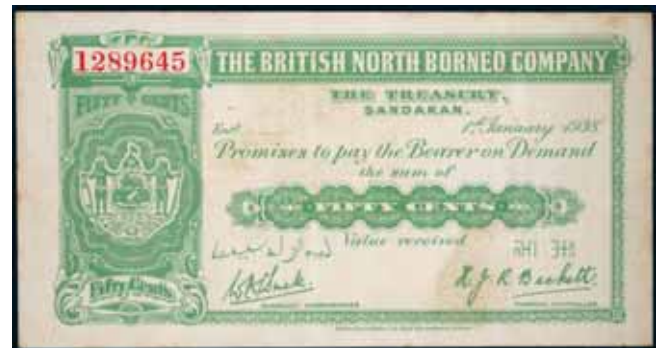
3834* British North Borneo , The British North Borneo Company, fifty cents, 1st January 1938, 1289645 (P.27). Very fine or better.