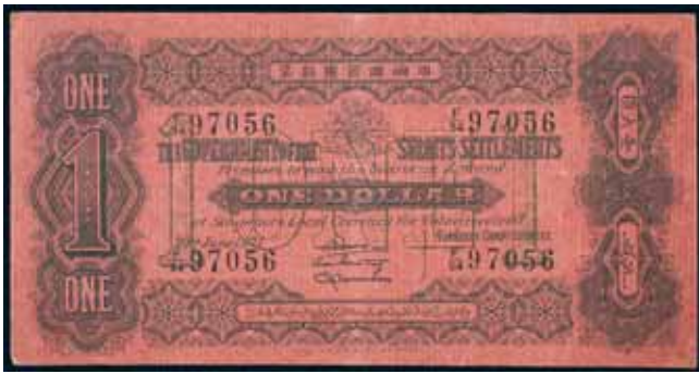
4034* Straits Settlements , The Government of the Straits Settlements, one dollar, 20th June 1921, F/94 97056 (P.1c). Folds and creases, a full intact note, very fine and scarce thus.