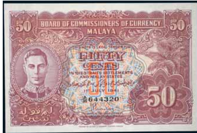
3994* Malaya , Board of Commissioners of Currency, George VI, fifty cents, 1st July 1941, A/20 283752 (P.10a); A/35 644320 (P.10b). Uncirculated . (2)