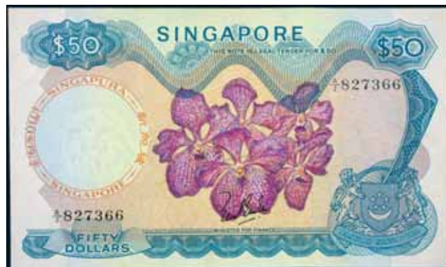
4027* Singapore , Board of Commissioners of Currency, fifty dollars, (1967) A/2 827366 (P.5a). Virtually uncirculated.