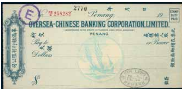
3995* Malaya , miscellaneous, Federated Malay States, rubber coupons, 31st December 1941; ten katis consecutive pair; Johor, ten katis; one picul, one coagulant unit and two coagulant units (3), strip of three, October, November, December, 1941, Government Loan coupons, 1.50, 1948, 1949; 1952, 2.25 1947; $15, 1944; $75, 1957; Singapore, one dollar lottery ticket (AH 2602); Penang, unissued cheque forms (2); Taiping, 19 - (1940's); cable and wireless forms, 1946, 1947, 1953, 1956, 1957. Extremely fine - uncirculated . (23)