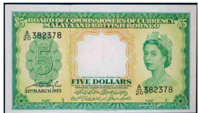
3998* Malaya and British Borneo , Board of Commissioners of Currency, Elizabeth II, five dollars, 21st March 1953, A/20 382378 (P.2a). Light centre fold, nearly uncirculated .