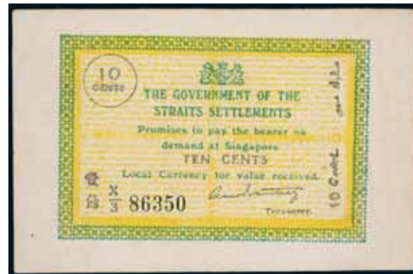
4037* Straits Settlements , The Government of the Straits Settlements, ten cents, X/3 86350, A.M.Courtney (1919-20) (P.6c). Nearly extremely fine and scarce in this condition.