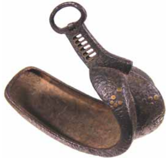
3946* Japan , Edo period (17th century), Samurai battle horse stirrups (Abumi), a matched pair of forged iron horse stirrups in swan-like shape with a hand chiselled and bronze inlaid design of leaves approx (28cm longx25cm high; 4.3kg), maker's name on the back edge of the buckle uprights (the characters worn). Good. (2 pieces)