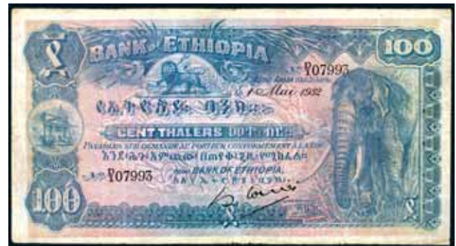
4044* Ethiopia , Bank of Ethiopia, one hundred thalers, Addis Ababa, 1st May 1932, No D/1 07993 (P.10). Very fine. $1,200