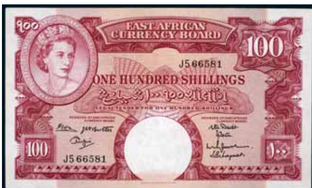
4042* East Africa , East African Currency Board, Elizabeth II, one hundred shillings (1961-3) J5 66581 (P.44b). Extremely fine or slightly better. $400