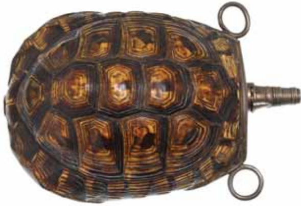
3944* Tortoise shell powder flask , probably early 19th century, a whole tortoise shell with silver protectors at front and back ends, the front end with engraved decoration, two suspension rings at sides of front silver protector cover and with lever opening charger. Very fine and rare.