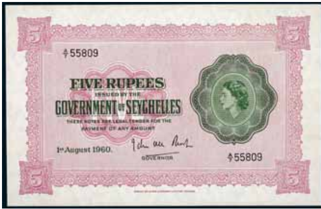
4109* Seychelles , Government of Seychelles, Elizabeth II, five rupees, 1st August 1960 A/7 55809 (P.11b). Extremely fine.