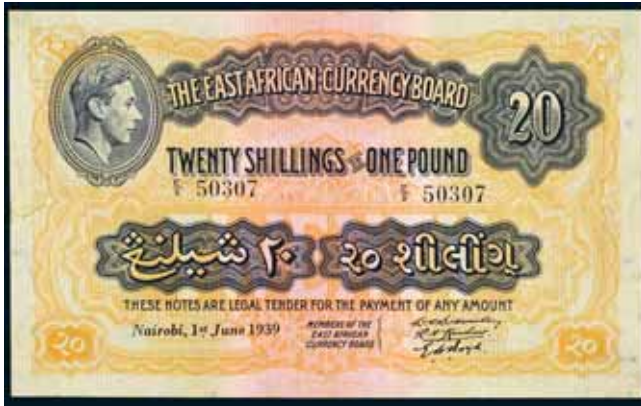
4040* East Africa , The East African Currency Board, George VI, twenty shillings or one pound, Nairobi, 1st June 1939, E/5 50307 (P.30a). Crisp, good very fine. $200