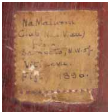
3945* Fiji , Bowai timber club (approx 104cm long), very heavy hardwood club with inlaid pattern at one end, used for battle but also ceremonial, small, old tag affixed with difficult to read script, appears to be, 'Na Malanell/Club (Nai Woiu)/ from/Sanbeto, N.W. of/Viti Levu, Fiji/1896'. Very fine.