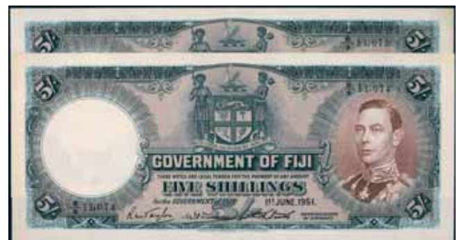
4045* Fiji , Government of Fiji, George VI, five shillings, 1st June 1951 B/9 11,074/5 (P.29c), consecutive pair. Slight centre bend, nearly uncirculated. (2) $400