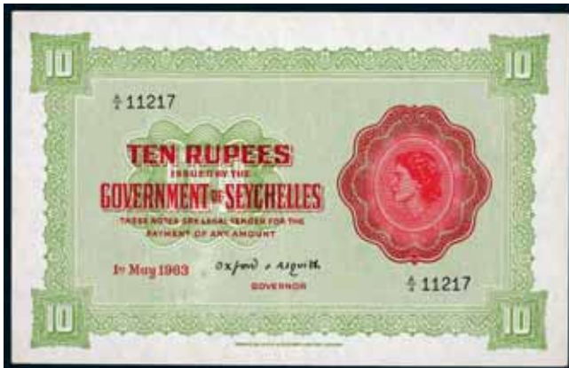
4110* Seychelles , Government of Seychelles, Elizabeth II, ten rupees, 1st May 1963; another 1st January 1967 (P.12c, d). Very fine; good very fine. (2)