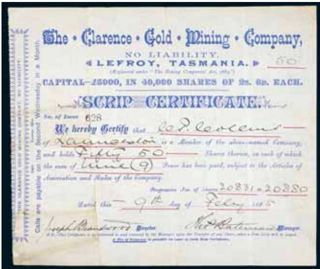
3970* Tasmania mining , Clarence Gold, Lefroy, 189[5], for fifty 2s 6d shares, blue print and scrollwork left side. With folds and creases, pin holes, area of light staining front left, otherwise very fine.