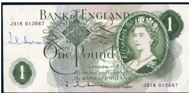
4070* Great Britain , Bank of England, one pound notes, one signed in ink by L.K.O'Brien and another J.L.Hollom, together with a letter from O'Brien to Leo(pold) de Rothschild dated 16th December 1976. Fine. (2)