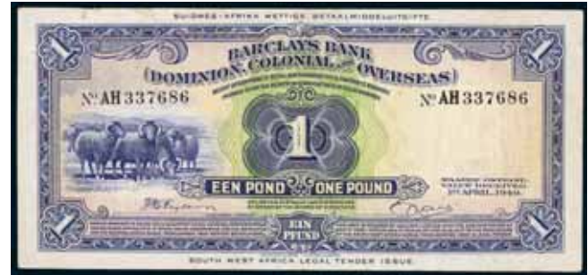
4112* Southwest Africa , Barclays Bank (Dominion, Colonial and Overseas), one pound, 1st April 1949 No AH 337686 (P.2c). Two tiny tears in top left margin, otherwise very fine.