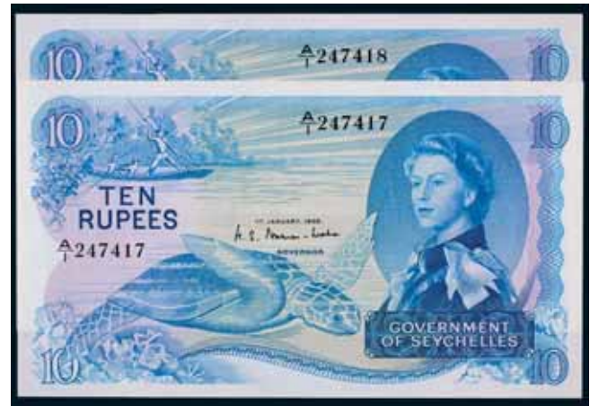
4111* Seychelles , Government of Seychelles, Elizabeth II, ten rupees, 1st January 1968 A/1 247417/8 (P.15a) consecutive pair. Light centre fold, otherwise virtually uncirculated. (2)