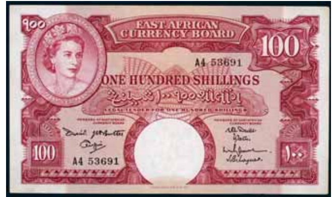
4043* East Africa , East African Currency Board, Elizabeth II, one hundred shillings A4 53691 (P.44a). Very fine or better. $300