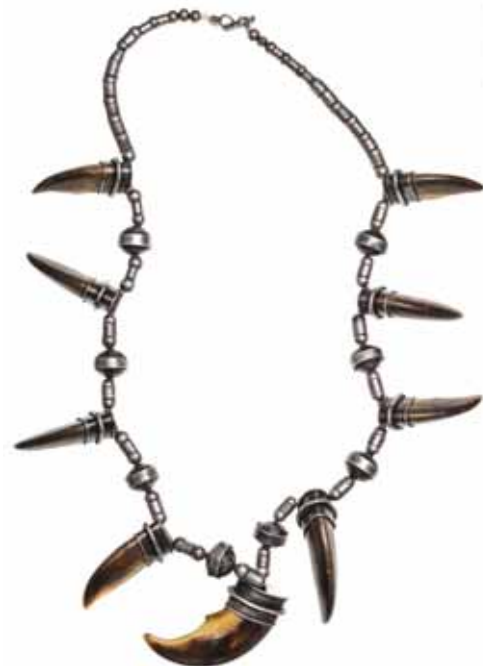
3947* Native American Indian Bear Claw Necklace , c1870, said to be Apache, silver fittings with nine genuine bear claws (approx 120mm). Good very fine.