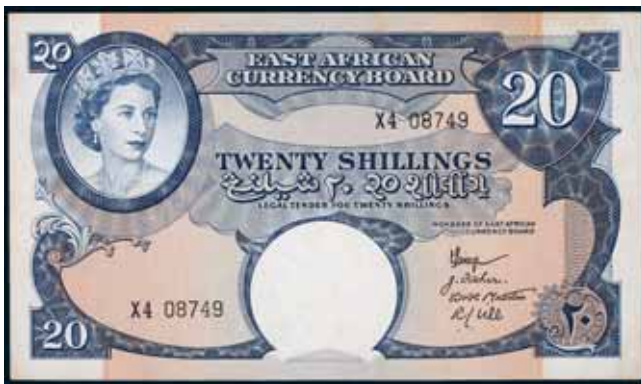
4041* East Africa , East African Currency Board, Elizabeth II, twenty shillings (1961-3) X4 08749 (P.43a). Nearly extremely fine. $150