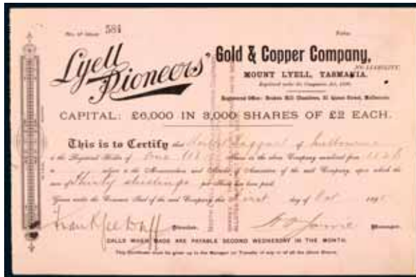
3971* Tasmania mining , Lyell Pioneers Gold & Copper, Mount Lyell, 189[5], one £2 share, black on pink, scrollwork left side. Light horizontal fold, pin holes, call stamp on back, good very fine.