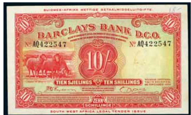
4113* Southwest Africa , Barclays Bank D.C.O., ten shillings, 30 November 1954, No AQ 422547 (P.4a). With 18 pencilled top right, good very fine.