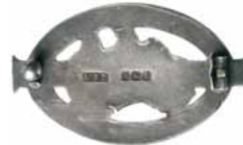
3760* Australia , WWI War Service badge (type 2, c1918), in voided silver and enamel (44x26mm), hallmarked for Birmingham 1917 by maker W.J.D (W.J.Davis), pin-back (pin missing). Good very fine and scarce. $300