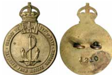
3761* Australia , WWI Returned from Active Service badge (RAN), by Stokes Sons Melbourne, reverse numbered 1210. Good very fine and scarce. $200