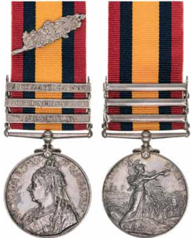
3615* Queen's South Africa Medal 1899 , (type 3 reverse), - three clasps - Transvaal, South Africa 1901, South Africa 1902, with unoffical MID emblem. 1288 Tpr: F.Hennessy. Steinaecker's Horse. Impressed. Toned, good very fine.