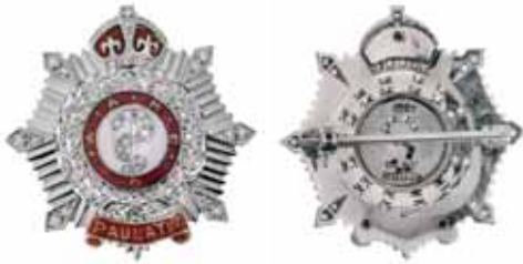
3775* Australia, A A M C , pin-backed sweetheart badge in white gold and enamel (18ct; 9g; 30mm) with small single cut and rose cut diamonds. Extremely fine and rare.