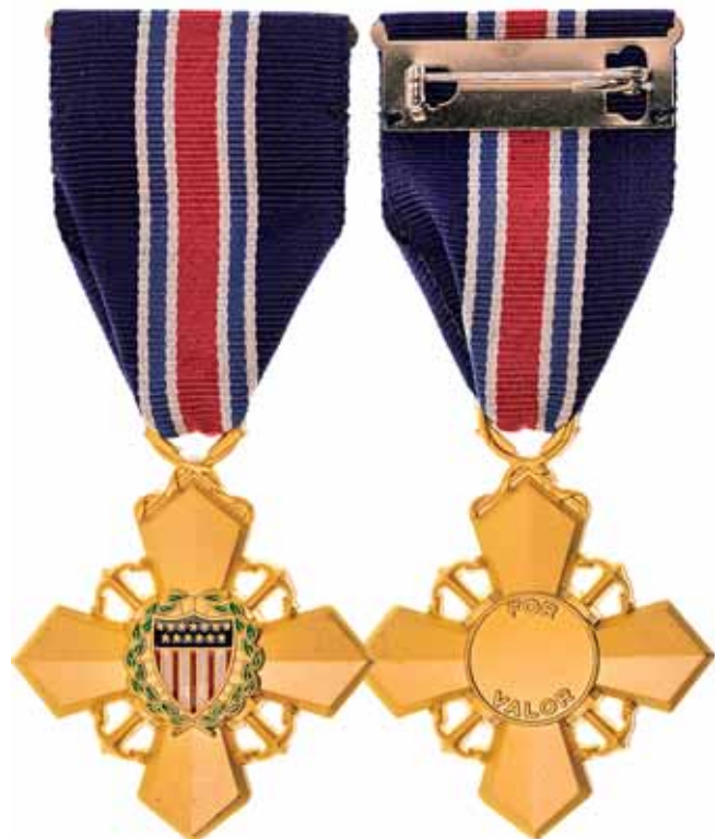
3743* USA, Coast Guard Cross, in case with enamelled lapel riband and riband bar. Uncirculated and unobtainable as an original unless awarded.