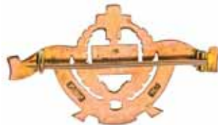
3776* Australia, Anzac Lone Pine, Field 3rd Ambulance , pin-backed sweetheart badge in gold and enamel (9ct; 2.7g; 40x23mm). Extremely fine.