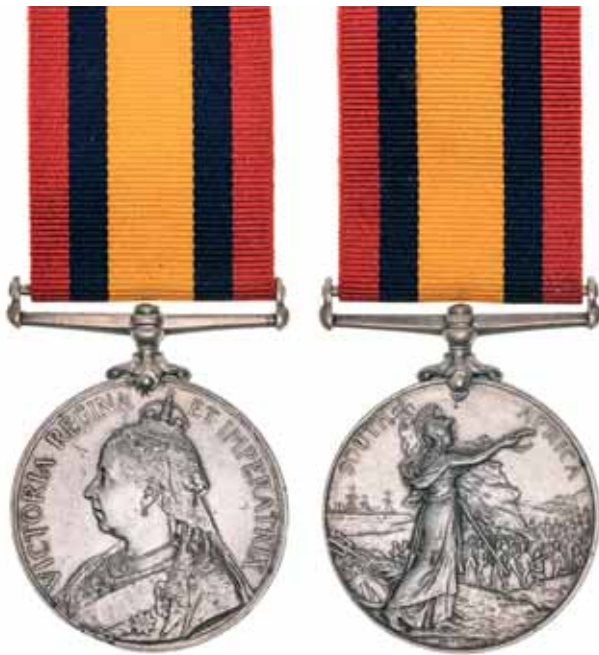
3597* Queen's South Africa Medal 1899 , (type 3 reverse). 771 Pte S.S.White. NamqInd: T.G. Impressed. Edge bump and a few light nicks in obverse field, otherwise toned very fine.