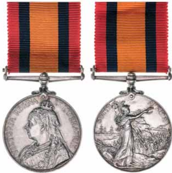
3575* Queen's South Africa Medal 1899 , (type 3 reverse). 14 Sjt: C.S.Andrews. Bechuanaland Rifles. Impressed. Nicely toned, extremely fine.