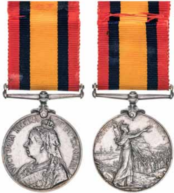
3635* Queen's South Africa Medal 1899 , (type 3 reverse). 29 Tpr: G.Ansell. E. London D.M.T. Impressed. Ribbon damaged and some hairline scratches in field, otherwise toned very fine.