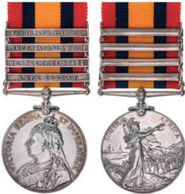
3618* Queen's South Africa Medal 1899 , (type 3 reverse), - four clasps - Cape Colony, Orange Free State, South Africa 1901, South Africa 1902. Civil Surgeon D.C.Henry. Impressed. Nicely toned, good very fine.