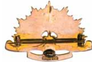
3778* Australian Commonwealth Military Forces, Rising Sun pin-backed sweetheart badge, in gold and enamel (9ct; 7.3g; 40x30mm). Extremely fine.