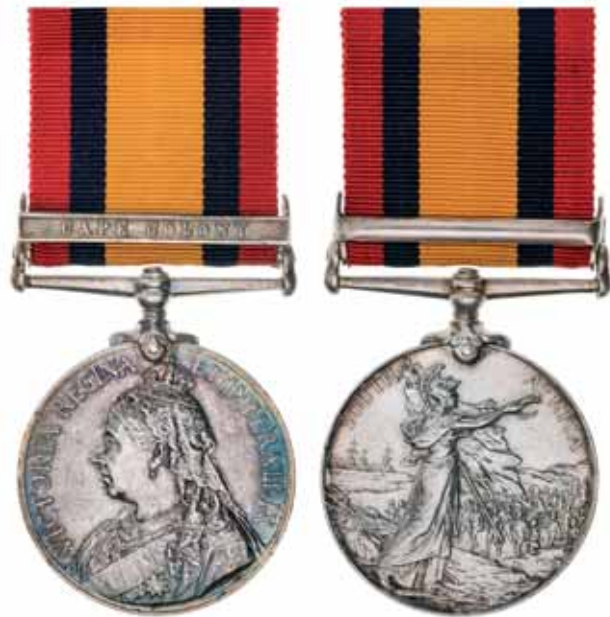
3583* Queen's South Africa Medal 1899 , (type 3 reverse), - clasp - Cape Colony. 696 Pte A. McKechnie. Cape Town Highrs: Impressed. A few small edge nicks and some light contact marks, otherwise nicely toned good very fine.

Confirmed on medal rolls for Cape Infantry.