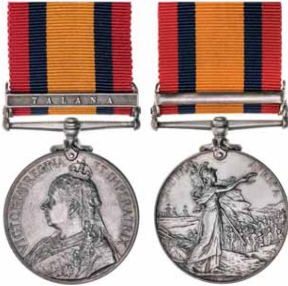
3585* Queen's South Africa Medal 1899 , (type 3 reverse), - clasp - Talana. W.A.Harvey. Dundee Tn: Gd: Impressed. Toned, good very fine.