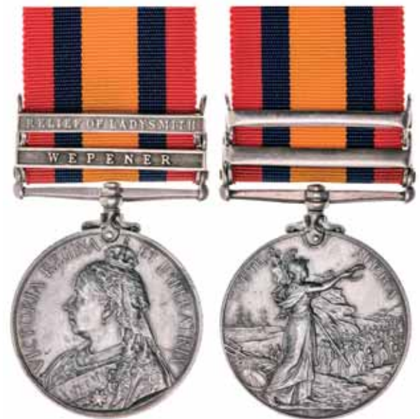
3584* Queen's South Africa Medal 1899 , (type 3 reverse), - two clasps - Wepener, Relief of Ladysmith. 26 Tpr: W.Way. Colonial Scouts. Impressed. Top bar loose, nicely toned, good very fine.

Private W.C.Rush confirmed on nominal roll of Cape Medical Staff Corps; Enl.06Feb1900; Disch.08Mar1901.