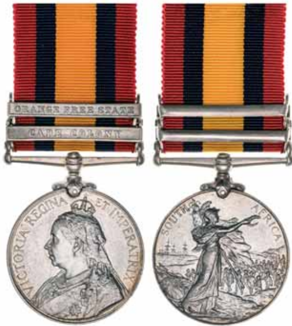
3601* Queen's South Africa Medal 1899 , (type 3 reverse), - two clasps - Cape Colony, Orange Free State. 214 Tpr: J.C.Meiklejohn (see below). Orpen's Horse. Impressed. Good very fine.