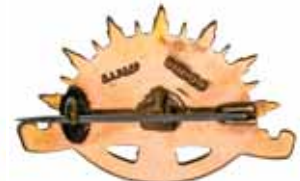
3779* Australian Commonwealth Military Forces, Rising Sun pin-backed sweetheart badge, in gold and enamel (9ct; 4.6g; 36x23mm). Extremely fine.