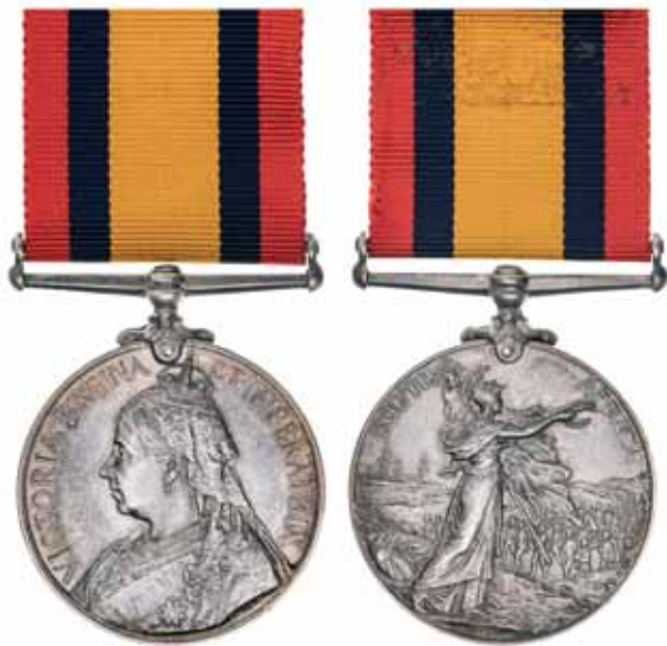
3581* Queen's South Africa Medal 1899 , (type 3 reverse). Cpl V.C.Van Blommestein. Cape Inftry: Impressed. Small hairline scratch in obverse field, otherwise nicely toned extremely fine.