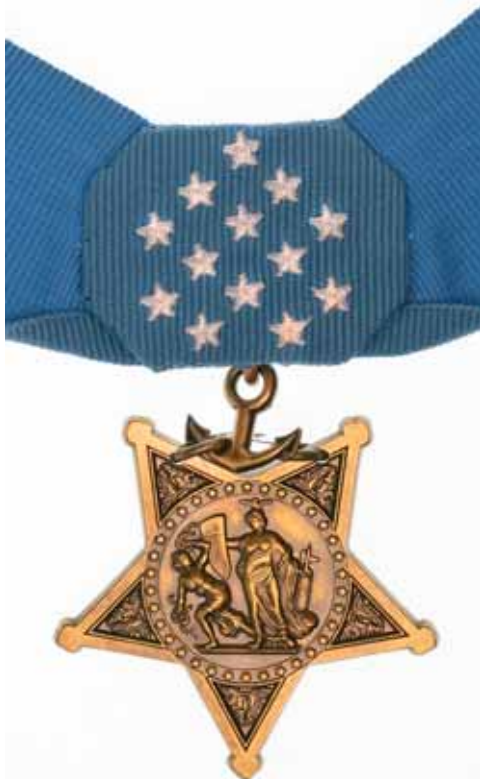
3741* USA, Medal of Honor - Navy, in case with neck ribbon, enamelled lapel riband and riband bar. Uncirculated and unobtainable as an original unless awarded.