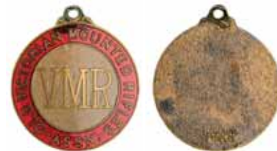
3780* Old Victorian Mounted Rifles Assn , fob in gilt and enamel (24mm) with scroll mount, by P.J.King, Melb. Enamel crazed near mount, otherwise good very fine.