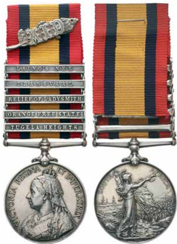
3616* Queen's South Africa Medal 1899 , (type 3 reverse), - five clasps - Tugela Heights, Orange Free State, Relief of Ladysmith, Transvaal, Liang's Nek, with unofficial MID emblem. 9564 Corpl: R.R.McGregor. Thorneycroft's M.I. Impressed. Hairlines, otherwise toned good very fine.