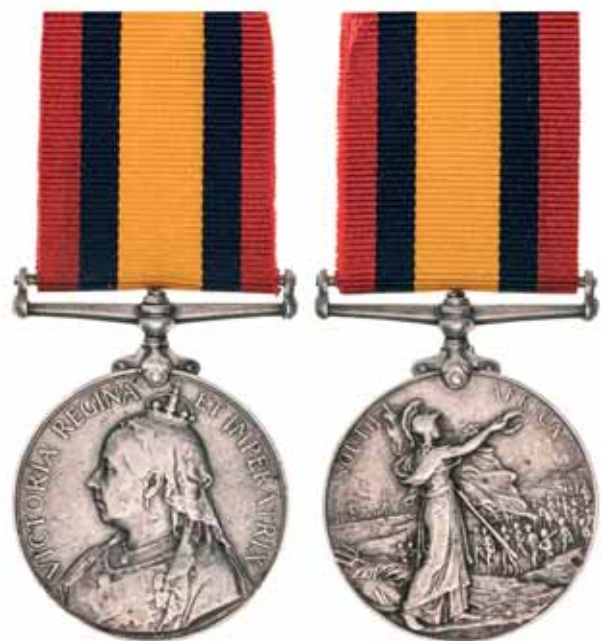
3611* Queen's South Africa Medal 1899 , (type 2 reverse with clear ghost dates). 59 (see below) Far: Sjt: R.H.Tellam, Scottish Horse. Impressed and possibly renamed. Very good.

With research and b&w photo of Trooper Grey.