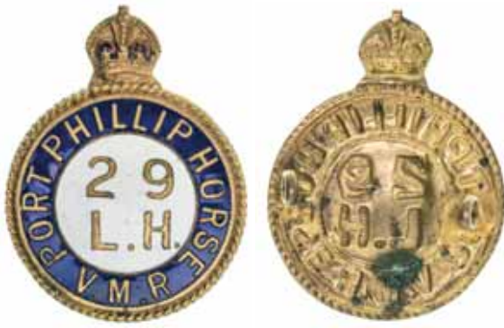
3755* 29th Light Horse , Port Phillip Horse VMR, hat badge, 1912-18, in gilt and enamel (35mm). Very fine and rare. $2,250