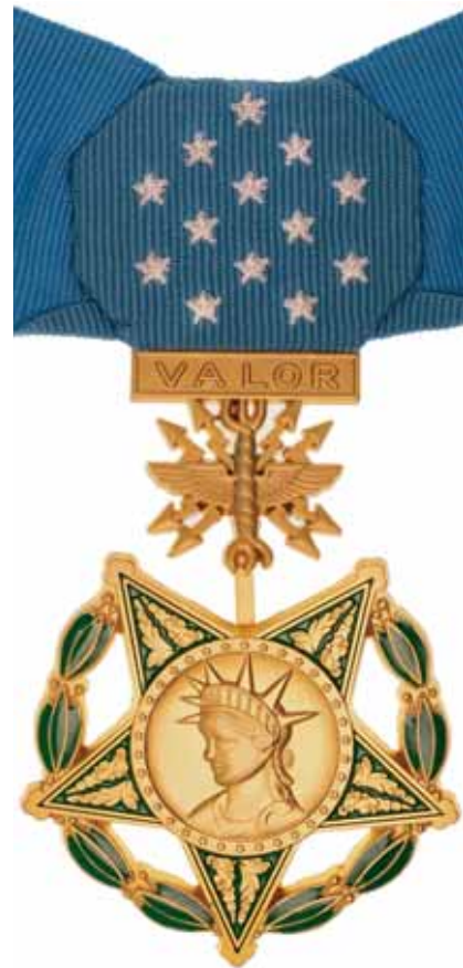
3742* USA, Medal of Honor - Air Force, in case with neck ribbon, enamelled lapel riband and riband bar. Uncirculated and unobtainable as an original unless awarded.