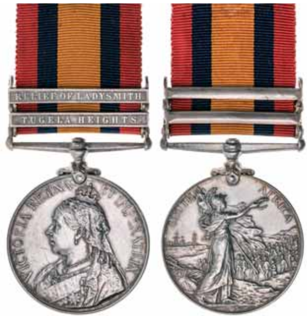
3599* Queen's South Africa Medal 1899 , (type 3 reverse), - two clasps - Tugela Heights, Relief of Ladysmith. Bearer W.H.McKeown. N.V.A.C. Impressed. A few thin scratches, otherwise toned very fine.

Pte S.S.White confirmed on medal roll of Namaqualand Town Guard.