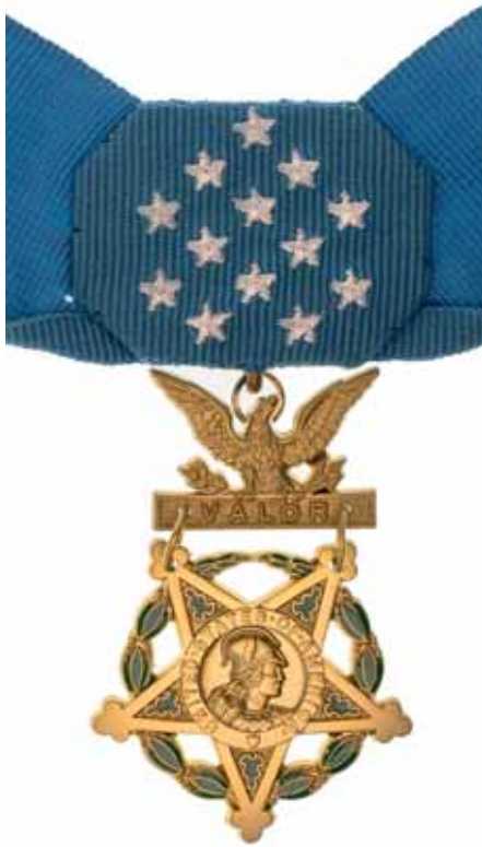
3740* USA, Medal of Honor - Army, in case with neck ribbon, enamelled lapel riband and riband bar. Uncirculated and unobtainable as an original unless awarded.