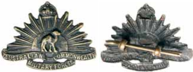
3756* Australia , WWI, Camel Corps sandcast brass collar badge. Very fine and rare. $350