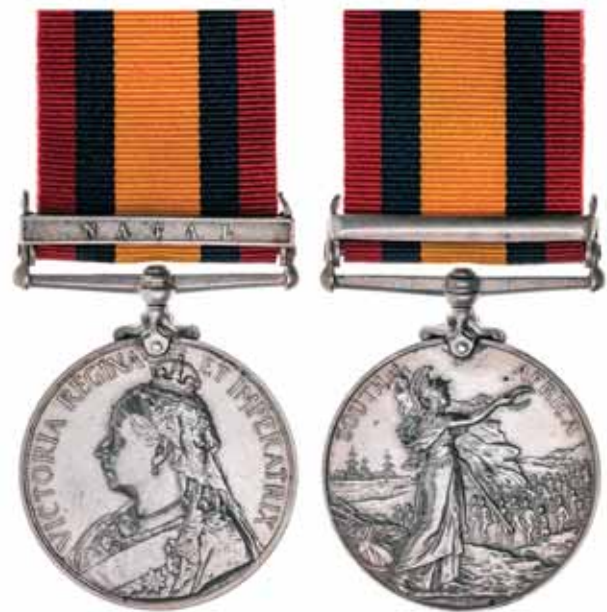
3587* Queen's South Africa Medal 1899 , (type 3 reverse), - clasp - Natal. Captain H.C.Simpson. F.I.D. Impressed. Hairline scratches in field, otherwise very fine.

W.A.Harvey, confirmed on the Dundee Town Guard medal roll, p17, as entitled to QSA with clasp Talana.