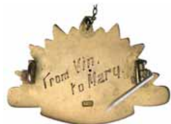
3777* Australia, Rising Sun badge (KC) sweetheart brooch, in gold (9ct; 9.91g; 42x29mm), pin-back, with safety chain, reverse inscribed, 'From Vin./to Mary.' Very fine.