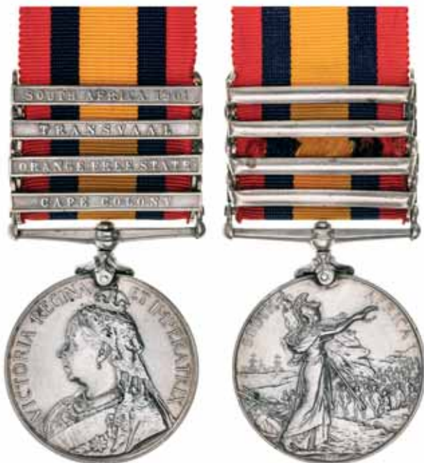
3582* Queen's South Africa Medal 1899 , (type 3 reverse), - four clasps - Cape Colony, Orange Free State, Transvaal, South Africa 1901. Pte W.C.Rush. C.M.S.C. Impressed. Good very fine.

Pte A.McKechnie confirmed on medal roll of Cape Town Highlanders.