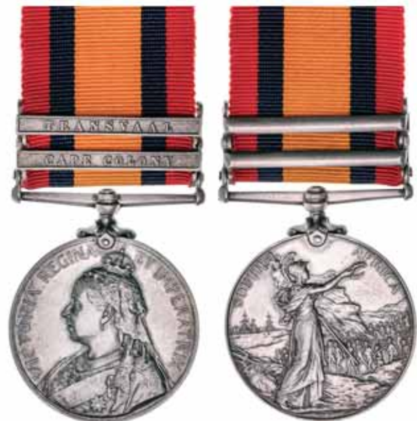
3588* Queen's South Africa Medal 1899 , (type 3 reverse), - two clasps - Cape Colony, Transvaal. Agent P.White. F.I.D. Impressed. Small edge bump, otherwise nicely toned good very fine.

Pte R.Tait, East Griqualand Mounted Volunteers, confirmed on medal rolls.