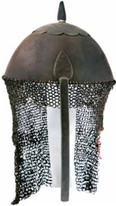
747* Sudanese helmet , 18th century, bowl-shaped construction in steel with a featured engraved brass top piece, with chain mail at the base, longer at the neck area, and with a very strong metal nose guard. Chain mail missing a few links and with oxidation due to age, otherwise good fine.