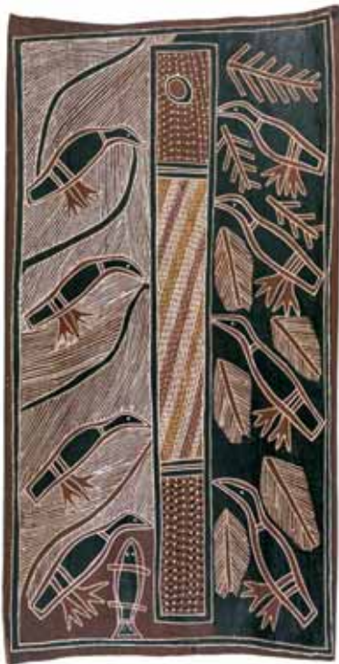
748* Aboriginal bark painting , by Burungur, Methodist Mission, Milingimbi, NT, signed on back, size 37x72cm, design depicts birds, leaves and fish, purchased about 1975, with Methodist Mission label. Fine.

Tag with helmet reads:- 'Sudanese iron helmet & camail (sic) from Kitcheners victory at Obdurman (sic should be Omdurman) with full length padded coats of chain mail circa 1850.'