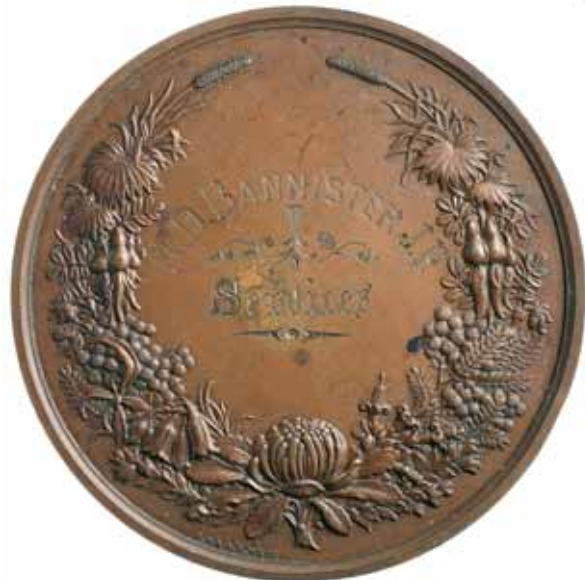
lot 564 reverse