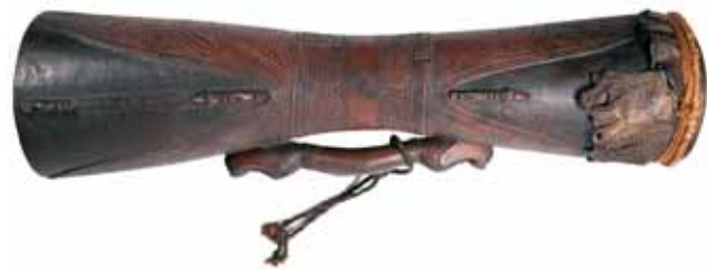
750* Papua New Guinea , Murik Lakes (lower and costal Sepik) kundu drum, wood 61x16cms, heavily decorated body with snake skin covering, purchased from Betty Thomas, Island Carvings, Lae in 1973. Fine.