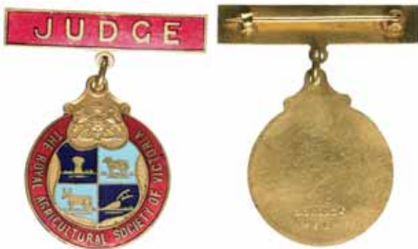
lot 657 part