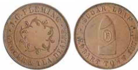
547* Fleming, J.G., Hobart Town penny, 1874 (A.128). Red and brown, good extremely fine and rare. $240