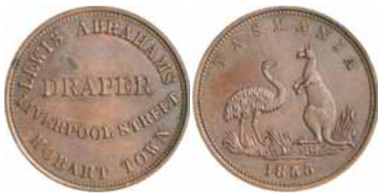
542* Abrahams, Lewis, Hobart Town penny and halfpenny, 1855 (A.1, 2). Extremely fine; good very fine. (2) $150