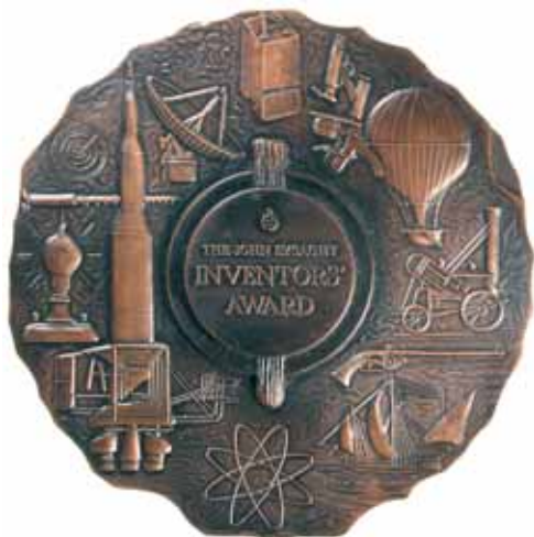
lot 629 reduced