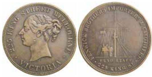
545* Fenwick Brothers, Melbourne penny, undated (A.121). Good very fine. $150