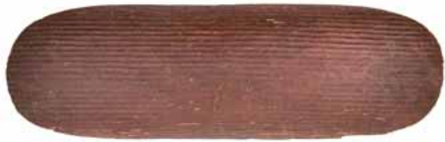
749* Aboriginal fighting shield , Central Australia, hand carved with vertical grooves on the front, back with recessed handle, brown stained wood, size 63x19cm with old insect damage in places, sticker on back of shield states purchased about 1970 from a private museum. Fine.