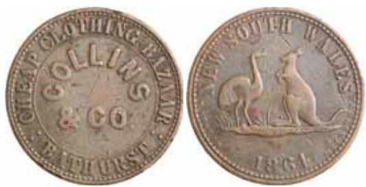
544* Collins & Co., Bathurst penny, 1864 (A.72). Scratched, otherwise nearly very fine. $120