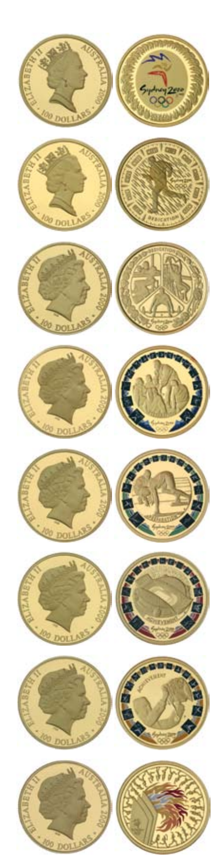
231* Elizabeth II, proof 999 fine gold one hundred dollars, Sydney 2000 Olympics eight coin set. In case of issue, with certificate, FDC. (8) $5,500