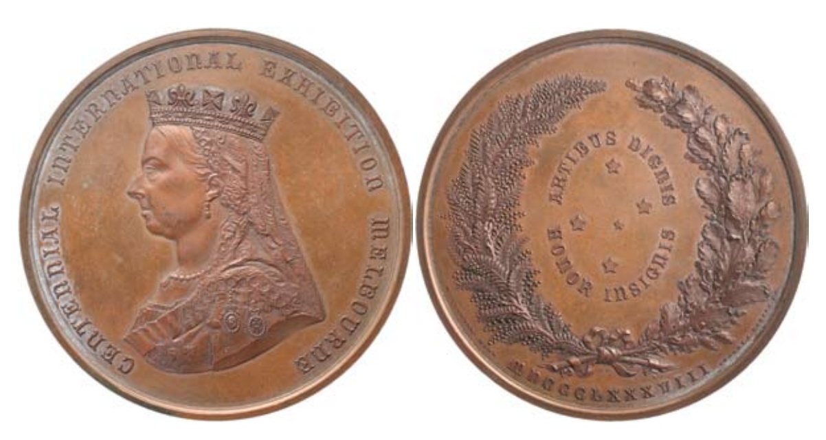
353* Centennial International Exhibition Melbourne, 1888, in bronze (76mm) (C.1888/8), by Stokes & Martin, edge impressed, 'J.F.Miller'. With small edge nick, otherwise nearly extremely fine.