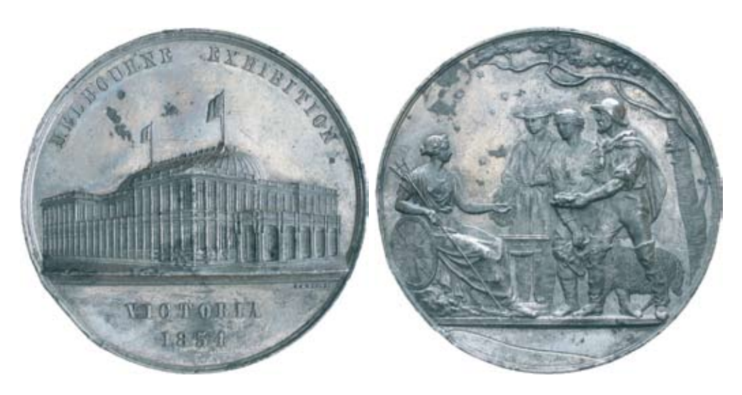
330* Melbourne Exhibition, Victoria, 1854, in white metal (64x8.5mm) (C.1854/2), by J.S.Wyon, unnamed, possibly a museum or VIP strike, 8.5mm thick instead of 5mm for normal striking. Some edge bumps and nicks, some tin pest spots, otherwise very fine and very rare.

Not recorded in white metal or with this thickness in Carlisle.