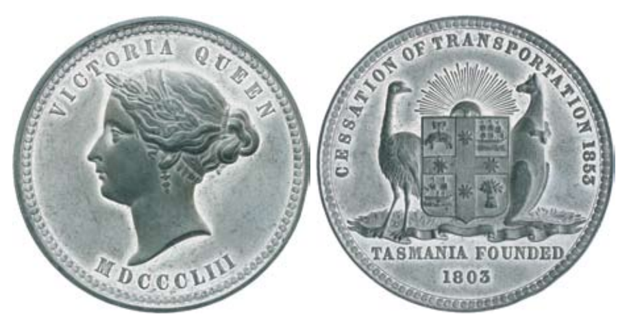
327* Cessation of Transportation, 1853, in white metal (58mm) (C.1853/2). Much mint bloom, good extremely fine and rare in this condition.

Carlisle values the bronze, corroded die struck issue at $1,500 in very fine to extremely fine condition.