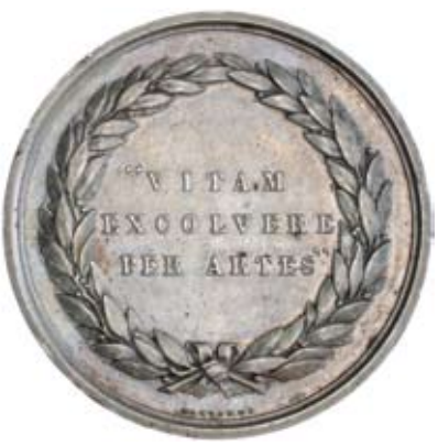
347* Melbourne International Exhibition, 1880, in silver (51mm) by H.Stokes, edge impressed 'J.Fergusson, Melbourne - Hops'. With rim nicks, two indentations on Queen's cheek, scratches and some spotting in fields, nearly very fine.