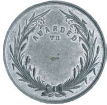
338* Commemorating the Opening of the Victorian Exhibition, 1872, prize medal in white medal (47.5mm) (see C.1872/3 reverse for this medal's obverse), by Stokes & Martin, unawarded. Toned, otherwise extremely fine and rare .