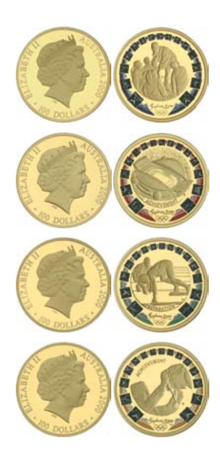
227* Elizabeth II, proof fine gold, one hundred dollars, four coin set, 2000 The Sydney 2000 Olympic Coin Collection Gold "Pictogram" set. In case of issue, missing certificate, FDC.