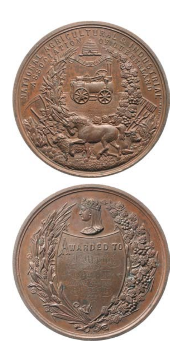
349* National Agricultural & Industrial Association of Queensland, 1883 in bronze (72mm) by R.Capner 'J Martin/1st Prize/ Plumber's Work/Juvenile Exhibition/Brisbane/1883'. Good extremely fine .