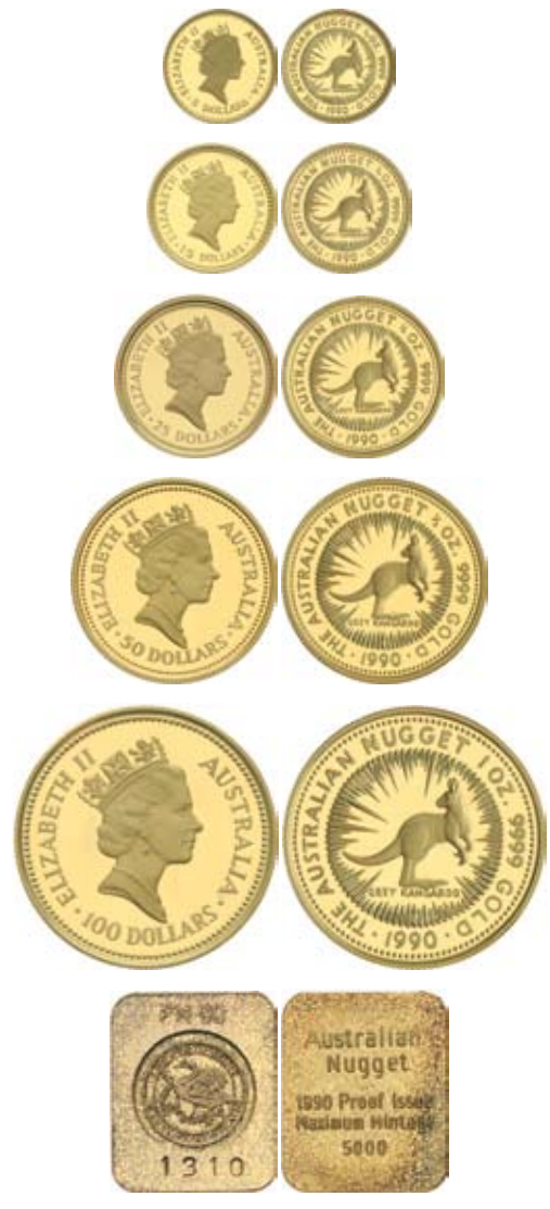
276* Elizabeth II, Perth Mint, proof gold five coin kangaroo nugget set, 1990. In case of issue, no 1310, FDC. (5) $4,000