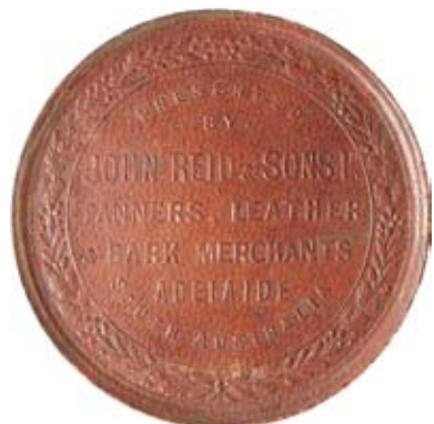
340* John Reid & Sons Ld, Tannery, Est. 1873, in leather (50mm) (C.1873/5). Slightly off centre on obverse, otherwise very fine and very scarce.