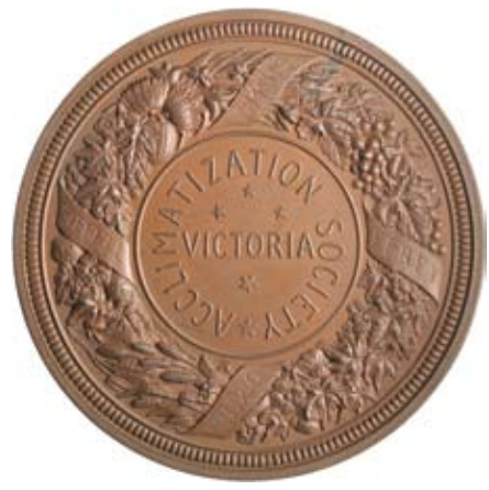
337* Acclimatization Society, Victoria, 1868, in bronze (57mm) (C.1868/3), by J.S. & A.B.Wyon. Toned uncirculated . $350