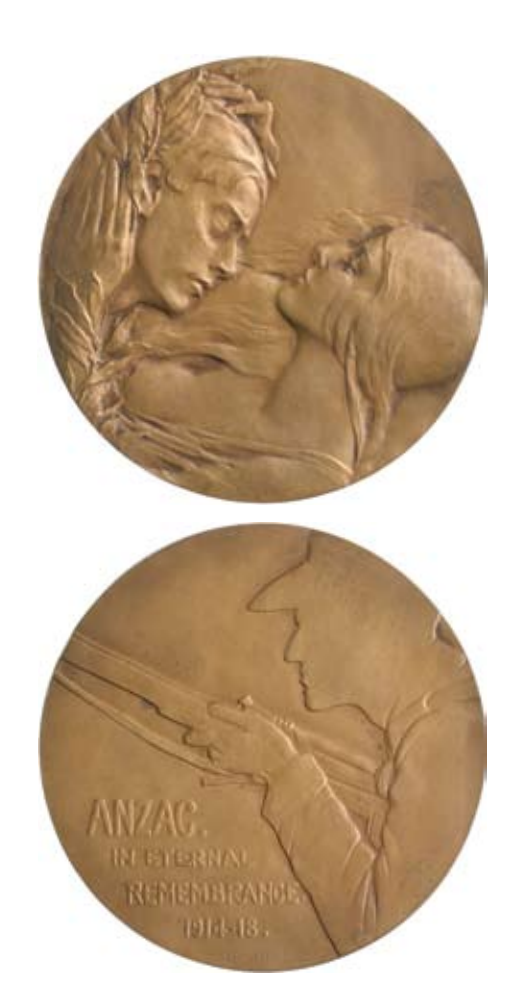
374* ANZAC In Eternal Remembrance, 1914-18, in bronze (60mm) (C.1914-18/1), by Dora Ohlfsen. Some light rubbing on a few high spots, otherwise uncirculated.