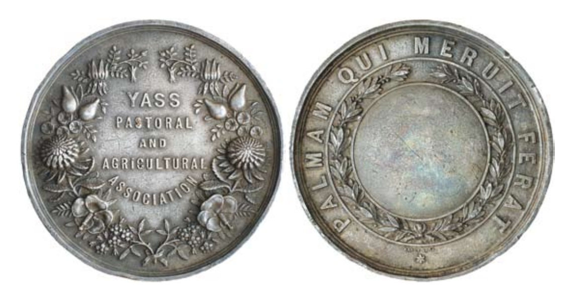
341* Yass Pastoral and Agricultural Association, in silver (70mm) for Hardy Bros., uninscribed. Surface marks from being mishandled, otherwise good fine.