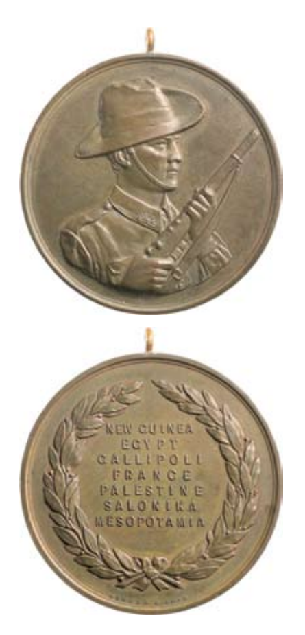
373* Australian Comforts Fund, c1915, in bronze (51mm) (C.ZN/1), by Stokes & Sons, with ring top suspension, edge impressed, 'Australian Comforts Fund S. A. Division'. Toned, otherwise nearly extremely fine.