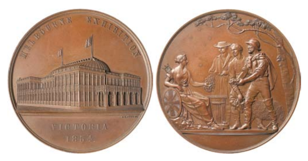
329* Melbourne Exhibition, Victoria, 1854, in bronze (64mm) (C.1854/2), by J.S.Wyon, unnamed. Toned, uncirculated and rare .