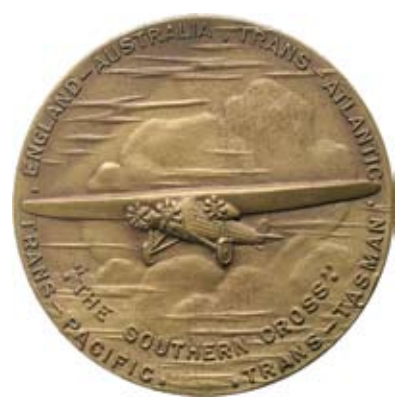
384* Sir Charles Kingsford Smith, 1935, in bronze (51mm) by Stokes, Melbourne, NAV (c.1935/6). Extremely fine. $200