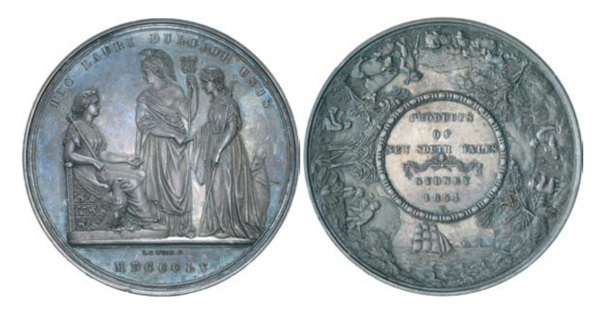
331* Products Of New South Wales, Sydney, 1854, in silver (73mm) (C.1854/5), by L.C.Wyon, plain edge as issued. Minor edge nick , otherwise beautifully toned, nearly uncirculated and rare.