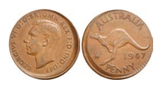
74* George VI, penny, 1947Y., struck fifteen percent off centre out of collar. Good very fine .