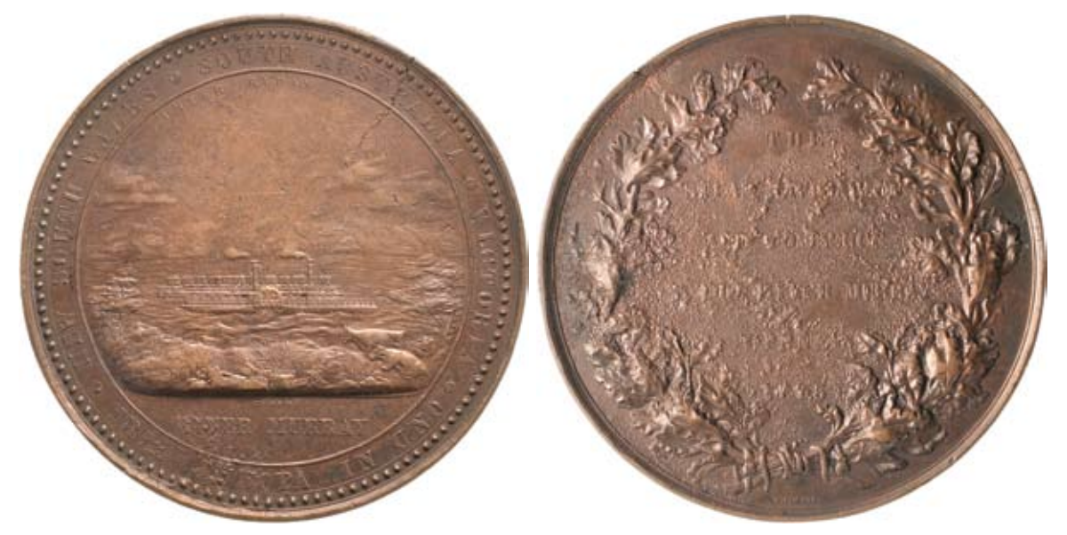
326* The Steam Navigation And Commerce Of The River Murray, 1853, in bronze (72mm) (C.1853/1), a restrike by Stokes of Melbourne using the original but very corroded dies (see Carlisle). The reverse with die struck corroded surface from the poor quality dies, otherwise nearly very fine and rare, even as a restrike.

Carlisle values the bronze, corroded die struck issue at $1,500 in very fine to extremely fine condition.