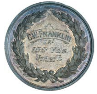
363* Church of England Grammar School, Melbourne, Jubilee Apl. 1908, prize medal in silver (53mm) (C.1908/2), by S.&S. (Stokes & Sons), reverse inscribed, 'C.W.Franklin/1st/100 Yds./Under 16'. Some hairlines, otherwise beautifully toned and nearly uncirculated.