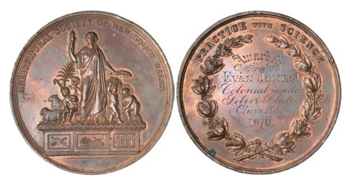
342* Agricultural Society Of New South Wales, 1876, prize medal in bronze (89mm), reverse inscribed, 'Awarded/To/Evan Jones./ Colonial made/Silver Plate/Class.582,/1876.'. Edge nicks, some oxidation spots, otherwise very fine.