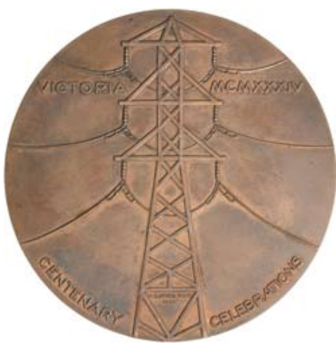
383* Victoria Centenary Celebrations, 1934, in bronze (63.5mm) (C.1934/9), by C.Rayner Hoff. Toned, a few minor spots, otherwise good extremely fine.