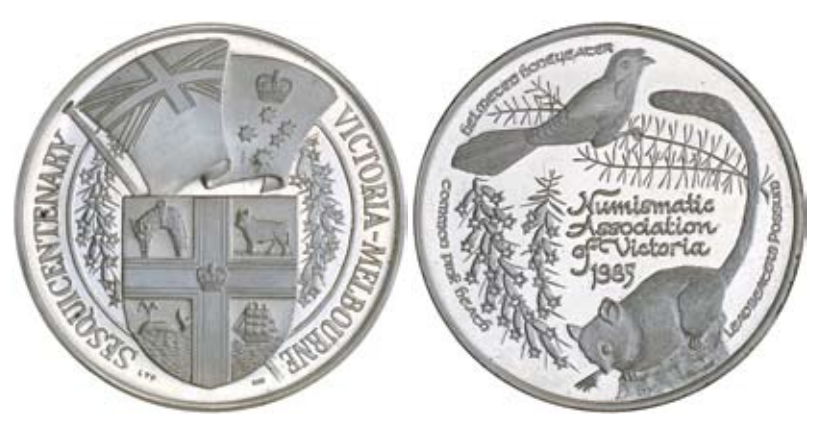
lot 397 part

A group of historic medals, including Royal Australian Mint, Canberra, c1966, decimal currency, in bronze (54mm) (C.R/7); State Visit to Australia of Israeli President Chaim Herzog, 1986, in silver (50mm, 75.6g) (2) by Michael Meszaros (C.1986/20), edge numbered 146 and 175; together with Israel, Israeli Air Force, Guardian of Zion, in silvered bronze (60mm). All medals cased, nearly uncirculated - uncirculated. (4)