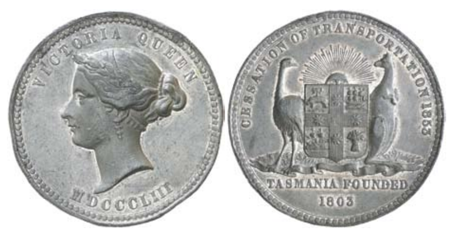
328* Cessation of Transportation, 1853, in white metal (58mm) by Royal Mint, London (C.1853/2). With edge bumps, good fine.