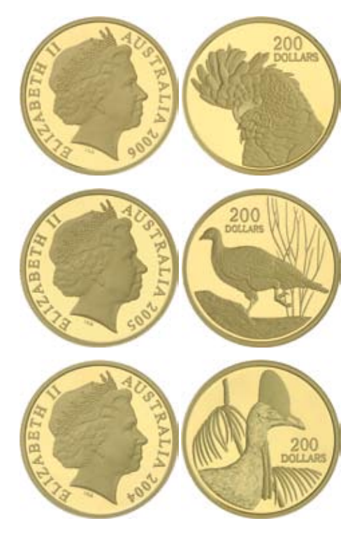
225* Elizabeth II, proof gold two hundred dollars, 2004, 2005, 2006, Rare Birds set of three. In case of issue, certificate with plaque 299, FDC. (3)