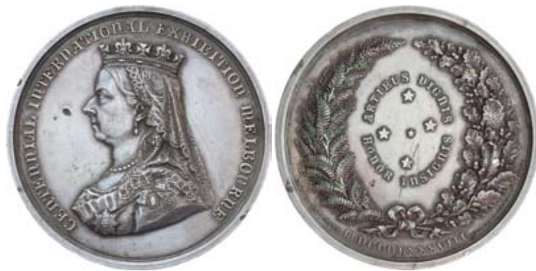
476* Centennial International Exhibition Melbourne, 1888 , in silver (51mm) (C.1888/8), dies by Stokes & Martin, Melbourne and struck by Royal Mint, Melbourne, edge impressed, 'D. Vince'. Edge bumps, hairlines, some light scratches and dig in obverse field, otherwise very fine.

Together with case gold blocked on the lid for the 1888 Exhibition.