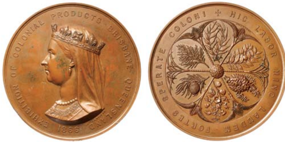
429* Exhibition Of Colonial Products, Brisbane, Queensland, 1866 , in bronze (64mm), obverse by J.S.Wyon, reverse by J.S.& A.B.Wyon, Pinches die numbers 195A and 196A, unnamed as issued. Some oxidation marks on obverse, otherwise nearly uncirculated.