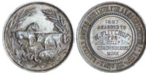
496* Eastern Downs Horticultural & Agricultural Assn, Warwick , in silver (31mm), no maker, reverse inscribed, '1897/(Awarded To)/W.Flitcroft/(For)/Colln/Coachbuilders/Work'. A few contact marks, otherwise good very fine.