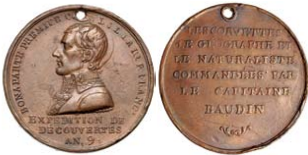
414* Baudin's Exploring Expedition , 1801, in copper (38mm), issued for the corvettes Geography and Naturalist voyage to New Holland (Australia) (MH 174), by Montagny, pierced hole at top for suspension, obverse, the Consul Bonaparte's bust left, reverse, 6-lines of French text, variety with low scroll. Weak strike on some letters on right side obverse legend and doubling of image behind Consul's head, some surface marks and also minor edge necks and bumps, otherwise very fine and very scarce.