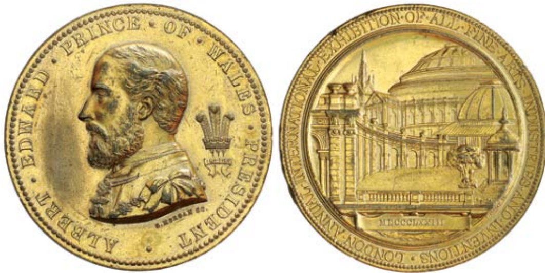
434* London Annual International Exhibition, of All Fine Arts, Industries and Inventions, 1873 , in gilt bronze (70mm) (Eimer 1622), obverse by G.Morgan and reverse by J.Gamble, obverse, bust of Prince of Wales left, reverse, facade of exhibition buildings including Albert Hall, edge impressed, 'Victorian Meat Preserving Company'. Some edge marks and loss of gilding, otherwise very fine and rare to Australian recipient.