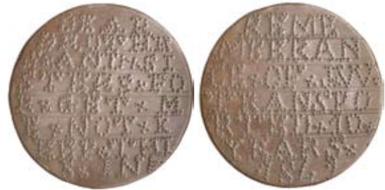
416* Convict token , on a British 1797 cartwheel penny completely shaved smooth on both sides, stipple engraved, "Dear Brother/s And Si/sTERS Fo/rget M/e Not K/keep Thi/s In", on the other side "Reme/mbran/ce Of JW/Transpo/rted 10 Years/1841". Good very fine.

Full details of this piece are on the Convict Records of Australia site.