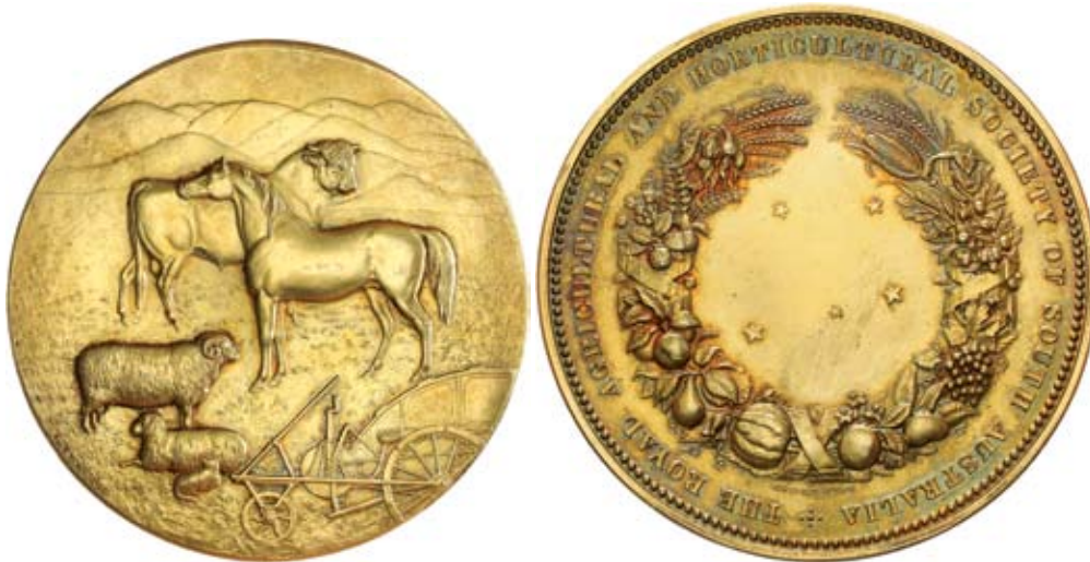
462* The Royal Agricultural And Horticultural Society Of South Australia, (1882) , in gilt, probably gilt silver (69mm) (2), by J.S.& A.B.Wyon, one features the obverse with edge removed and reverse smoothed so size reduced to 65mm, the other features the reverse with obverse smoothed and edge inscribed, 'Awarded . March. 1882. to Anderson, & Co. for Olive Oil.', presumably these two halves of the medal were attached to the winning exhibit display. Extremely fine. (2 pieces)