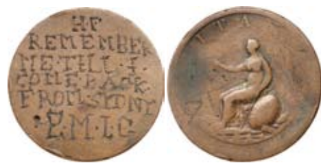
417* Convict token , on a George III halfpenny shaved smooth on one side and engraved, "H.F/Remember/Me Till I/Come Back/From Sydney/E.M.L.C". Fine.