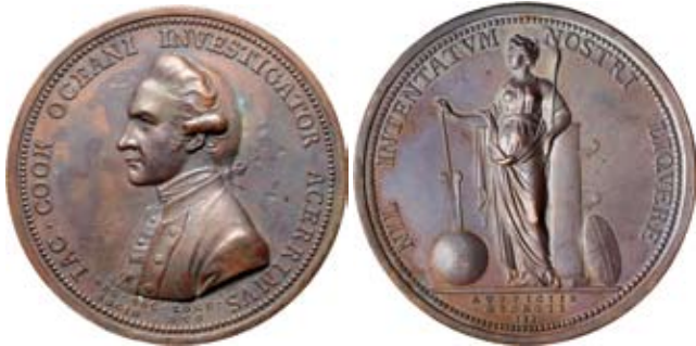
413* Captain James Cook , memorial medal (1784) in bronze (43mm) by L.Pingo for the Royal Society (MH 374; BHM 758). Some porosity pitting on obverse, otherwise nicely dark toned and good extremely fine.