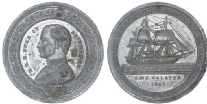
430* Visit of the Duke of Edinburgh, H.M.S. Galatea, 1867 , in white metal (47mm) (C.1867/2), by T.Stokes, Melbourne, holed for suspension and this plugged. Obverse with some dirt marks and a few small dark marks, a few small edge nicks, otherwise good very fine.

Ex Noble Numismatics Sale 113 (lot 3242).