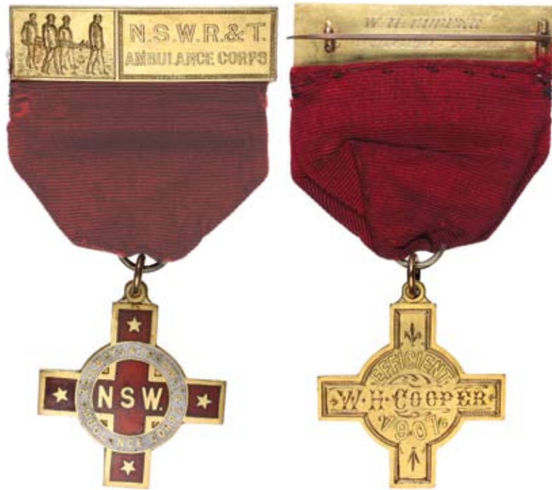
524* NSW Railways & Tramways Ambulance Corps , efficiency award, 1907, red and white enamel on gold cross (9ct; tot wt 24.28g; 35x35mm), with ring top suspension and ribbon with pin-back N.S.W.R.& T. Ambulance Corps suspender, reverse of cross inscribed to 'W.H.Cooper', and reverse of suspender inscribed to, 'W.H.Cooper/Efficient, 31.10.12.'. Good very fine - extremely fine.