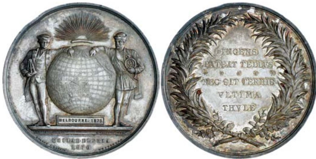
435* Intercolonial Exhibition Melbourne, 1875, Philadelphia, 1876 , in silver (69mm), (C.1876/6), obverse, O.R.Campbell. Des. - J.Hogarth. Fec. in line above exergue, below Stokes & Martin - Melbourne, impressed on obverse 'Melbourne. 1875' and impressed at top edge with recipient's name, 'Messrs J. Kitchen & Sons.'. Edge bumps, otherwise toned nearly extremely fine.

In the various categories the Australian Meat Preserving Company (Exhibitor 634) fared as follows:- Boiled Beef, equal first; Roast Beef, second; Roast Mutton, third; Boiled Mutton, first; Game and Fowl, first; overall First.