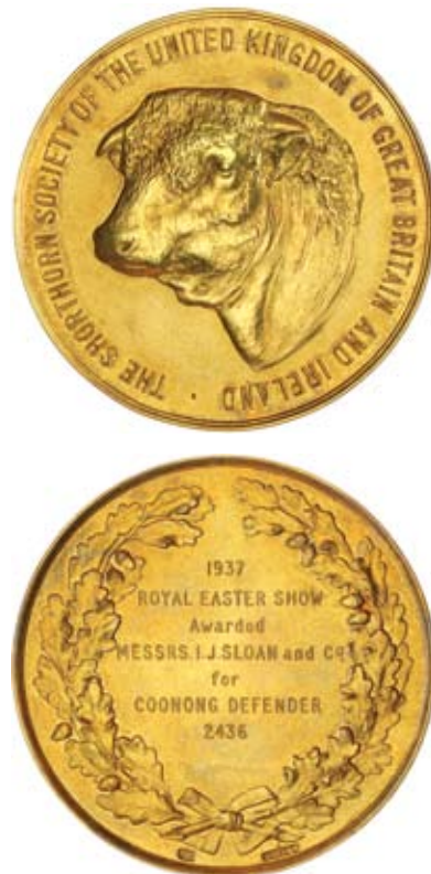
574* The Shorthorn Society Of The United Kingdom Of Great Britain And Ireland , prize medal in gold (9ct; 54.15g; 51mm), by HP (H.Phillips), reverse impressed, '1937/Royal Easter Show/Awarded/Messrs. I.J.Sloan and Co./for/Coonong Defender/2436'. Uncirculated.