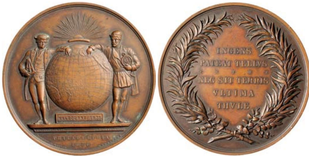
438* Intercolonial Exhibition Melbourne, 1875, Philadelphia, 1876, in bronze (69mm) (C.1876/6), obverse, O.R.Campbell. Des. - J.Hogarth. Fec. in line above exergue and below Stokes & Martin - Melbourne, impressed on obverse, 'Melbourne. 1875', impressed on edge, 'D.Davies.' Dark toned and some small oxidation spots, otherwise nearly extremely fine.