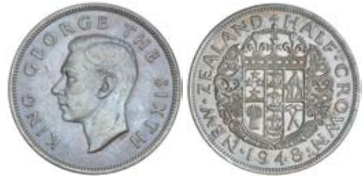
691* George VI, halfcrown, 1948. Subdued tone, underlying mint bloom, uncirculated and scarce thus.