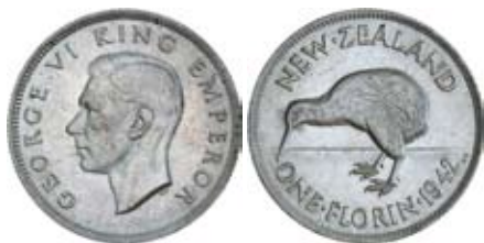
700* George VI, florin, 1942. Light tone, subdued mint bloom, nearly uncirculated.