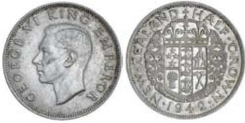
685* George VI, halfcrown, 1942. Lightly toned, nearly uncirculated.