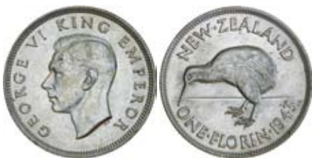
702* George VI, florin, 1943. Minor contact marks and rim nick, otherwise uncirculated.