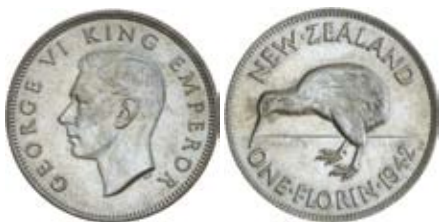
701* George VI, florin, 1942. Nearly uncirculated.