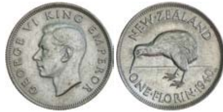
697* George VI, florin, 1940. Nearly uncirculated.