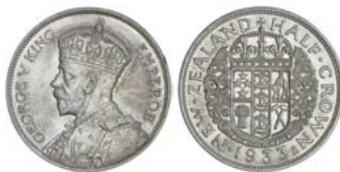
663* George V , halfcrown, 1933. Lightly toned subdued mint bloom, nearly uncirculated. $100