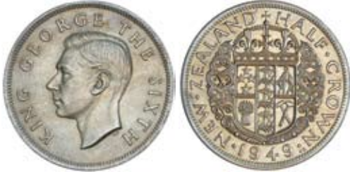
694* George VI, halfcrown, 1949. Has been rubbed, otherwise uncirculated and scarce thus.