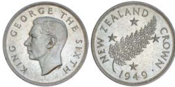
648* George VI, Royal Mint London, proof crown 1949. Semi frosted and brilliant FDC and extremely rare, only three or four in private hands.