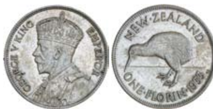
665* George V , florin, 1933. Nearly uncirculated/good extremely fine. $150 Ex I.S.Wright Sale 255 (lot 8041).

Private purchase from M.R.Roberts, with their ticket.