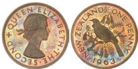
659* Elizabeth II , Royal Mint London, proof penny, 1963. Blue brown and red, FDC and extremely rare. $2,000