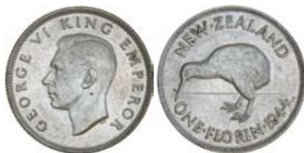
704* George VI, florin, 1944. Nick on neck, otherwise lightly toned extremely fine/good extremely fine.