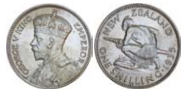
675* George V, shilling, 1935. Cleaned bright, otherwise nearly uncirculated.