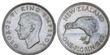
705* George VI, florin, 1946, flat back to kiwi. Extremely fine/good extremely fine and scarce thus.