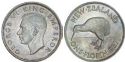
695* George VI, florin, 1937. Lightly toned, nearly uncirculated/uncirculated.