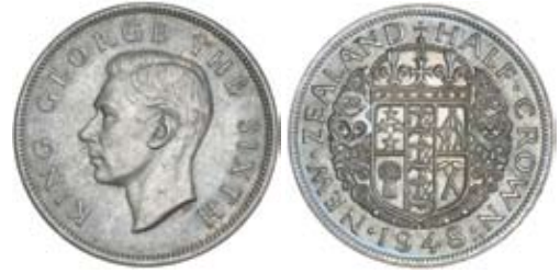
690* George VI, halfcrowns, 1947 and 1948. Lightly toned, scratched in king's face on the first, nearly uncirculated. (2)