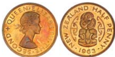
662* Elizabeth II , Royal Mint London, proof halfpenny, 1963. Brilliant mint red, FDC and very rare. $1,500

Private purchase from M.R.Roberts with their ticket.