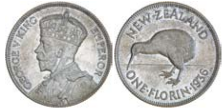
671* George V, florin, 1936. Lightly toned, considerable original mint bloom, nearly uncirculated and rare, especially in this condition, one of the finest known.