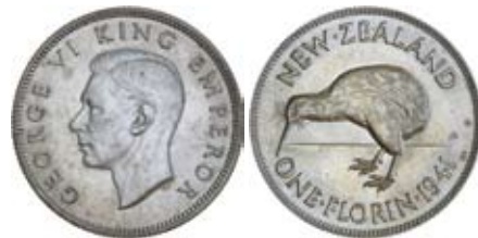
699* George VI, florin, 1941. Nearly uncirculated.