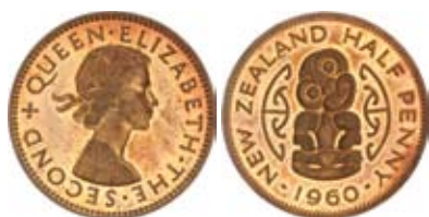
660* Elizabeth II , Royal Mint London, proof halfpenny, 1960. Mostly red, nearly FDC and extremely rare. $1,750

Private purchase from M.R.Roberts, with their ticket. Ex PCGS slab as PR63RB.