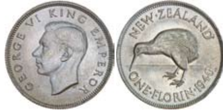
696* George VI, florin, 1940. Full original mint bloom, choice uncirculated and rare in this condition, one of the finest known.