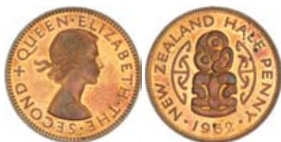
661* Elizabeth II , Royal Mint London, proof halfpenny, 1962. Mostly red, two small carbon spots on the reverse, otherwise FDC and extremely rare. $1,250