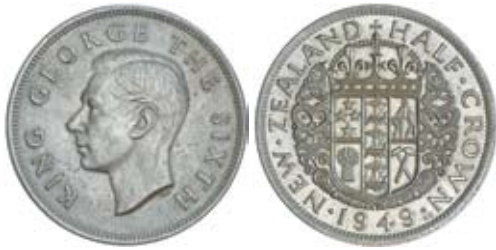
693* George VI, halfcrown, 1949. Toned, subdued original mint bloom, uncirculated and scarce thus.