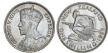
674* George V, shilling, 1935. Uncirculated.