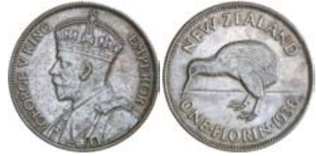
672* George V, florin, 1936. Toned extremely fine and rare in this condition.