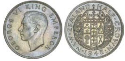
689* George VI, halfcrown, 1945. Lightly toned, nearly uncirculated.