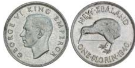
698* George VI, florin, 1940. Good extremely fine.