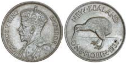
669* George V, florin, 1935. Lightly toned, good extremely fine.