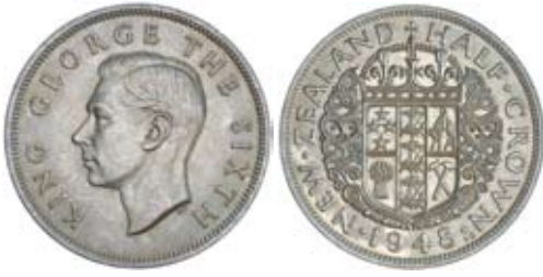
692* George VI, halfcrown, 1948. Underlying mint bloom, nearly uncirculated.