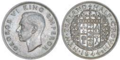
687* George VI, half crown, 1944. Toned good extremely fine and scarce thus.