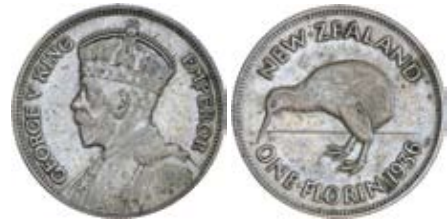
673* George V, florin, 1936. Toned very fine and scarce.