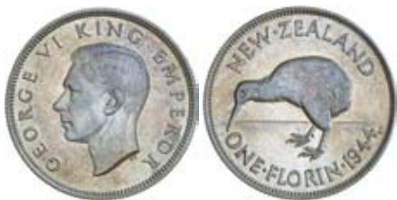
703* George VI, florin, 1944. Nearly uncirculated and very scarce in this condition.