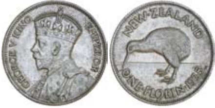
668* George V, florin, 1935. Subdued mint bloom, even grey tone, nearly uncirculated.