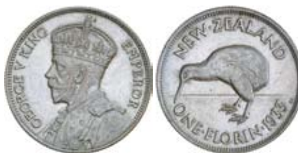
666* George V , florin, 1933. Good extremely fine/extremely fine. $100