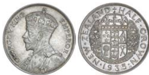
664* George V , halfcrown, 1935. Toned nearly extremely fine or better. $70