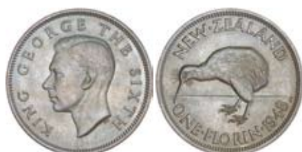
707* George VI, florin, 1948. Full cartwheeling original mint bloom, uncirculated.