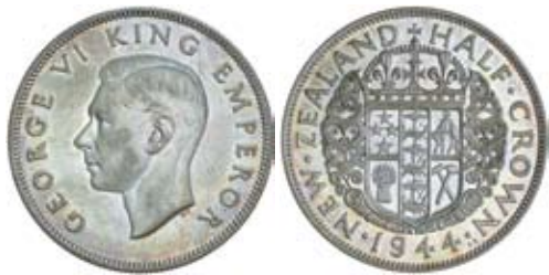
688* George VI, halfcrown, 1944. Some mint bloom, nearly extremely fine/extremely fine and scarce.