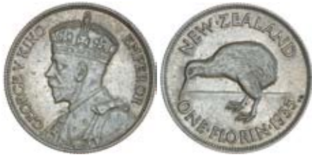
667* George V, florin, 1935. Light grey toned, uncirculated and very scarce thus.