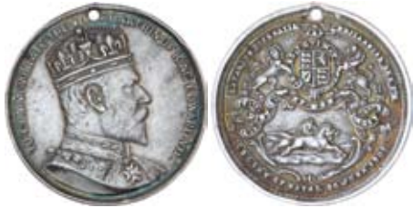
1690* South Africa , Natal Coronation of King Edward VII medal, 1902, in silver (29mm), by J&S (Joseph and Sons, Port Elizabeth), pierced hole for suspension ring. Very fine.