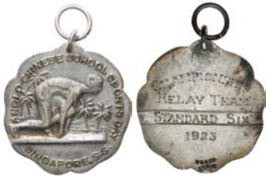
1689* Singapore , Anglo-Chinese School Sports Day, prize medal in silver (33mm), by W&H. Co. (Whitehead & Hoag Company), ring top suspension, reverse inscribed, 'Championship/Relay Team/Standard Six/1923'. Dark toned, otherwise very fine.