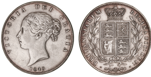
1377* Queen Victoria , young head, halfcrown 1845 (S.3888). Extremely fine.