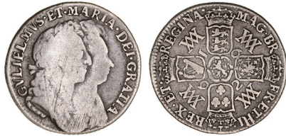
1347* William and Mary, shilling, 1692 (S.3437). Nearly fine.