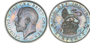
1427* George V, proof sixpence 1911, (S-4014, ESC-3872, Davies 1863 Dies 2 B) (S) (2.81g). Brilliant blue and grey iridescence, FDC.