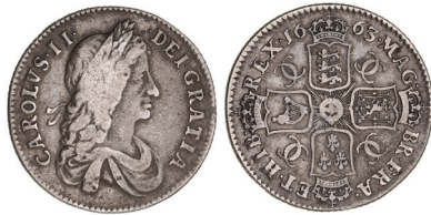
1342* Charles II , shilling, first bust, 1663 (S.3371). Toned, nearly very fine. $250