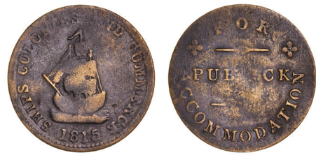
1477* Isle of Man, Ships, Colonies & Commerce, halfpenny, 1815 (W.2095) in brass. Nearly fine and extremely rare.