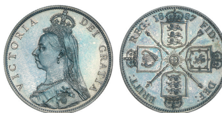
1392* Queen Victoria , proof florin 1887, (S-3925, ESC-2954, Davies 810?) (R) (11. 22g), Dark blue grey tone, minimal obverse hairlines, nearly FDC/FDC and rare.