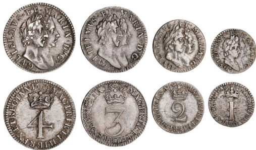
1348* William and Mary, Maundy set, 1689 (S.3446). Toned very fine. (4)