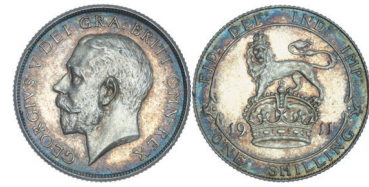
1426* George V, proof shilling 1911, (S-4013, ESC-3800, Davies 1792 Dies 3 A) (S) (5.61g). Peripheral toning, FDC.