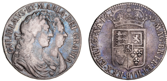
1346* William and Mary, halfcrown, 1689, no frosting of crown (S.3434). Toned, fine.