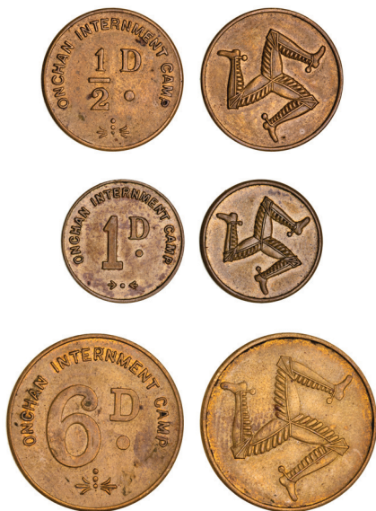
1483* Isle of Man, Onchan Internment Camp (WWII), set of three canteen tokens in brass 1/2d, 1d, 6d (Kelly 48-9). Nearly extremely fine. (3)