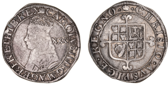
1340* Charles II , hammered coinage, 1660-2, third issue, halfcrown, mm crown (S.3321). Portrait flat, toned and a full round coin, finelvery fine, scarce in this condition. $350