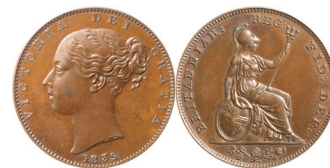
1406* Queen Victoria , proof farthing 1839, (S-3950, Peck 1556) (S) (4.22g), bronzed. Unbarred As in GRATIA, full brilliant dark brown patina, FDC and rare thus.