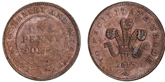
1500* Channel Islands, Jersey, Guernsey and Alderney, copper penny, 1813 (W.2044), die axis coinage style. Good very fine.