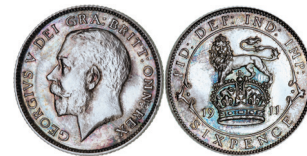
1428* George V, proof sixpence 1911, (S-4014, ESC-3872, Davies 1863 Dies 2 B) (S) (2.82g). Attractive dark blue grey toning, FDC.