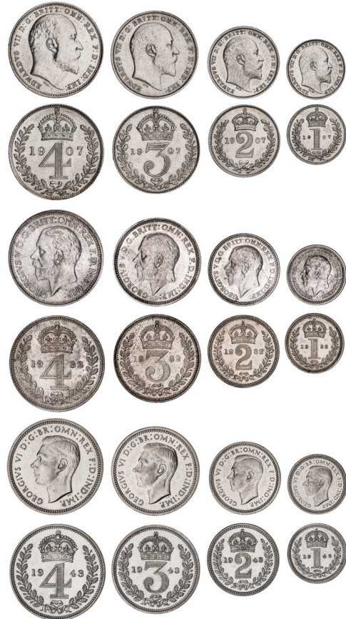
1418* Edward VII , Maundy set, 1907 (S.3985); George V , Maundy set, 1932 (S.4043); George VI , Maundy set, 1943 (S.4086). Nearly uncirculated or better. (12) $400