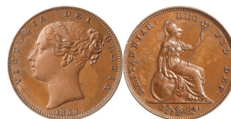
1405* Queen Victoria , bronzed proof farthing 1839, Die alignment variety, (S-3950, Peck 1557) (V.R.) (4.64g). Full red brown bronzed patina, FDC and very rare.