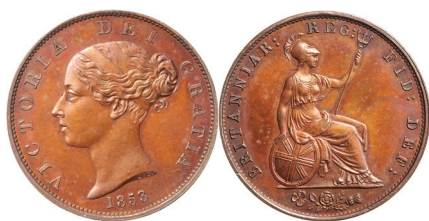
1404* Queen Victoria , proof halfpenny 1853, (S-3949, Peck 1541) (VS) copper (9.44g). Deep red brown copper tone, slight spotting, semi brilliant, nearly FDC and very scarce. $1,000