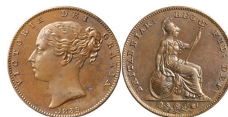
1407* Queen Victoria , proof farthing 1839, (S-3950, Peck 1556) (S) (4.70g). Some spotting, dark bluish brown patina, nearly FDC and scarce.