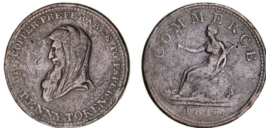
1501* Channel Islands, Not Local copper penny, 1814 (W.1635). Nearly fine and very rare.