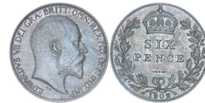
1417* Edward VII , proof sixpence 1902, (S-3983, ESC-3598, Davies 170) (N) (2.81g). Lightly toned, FDC. $200