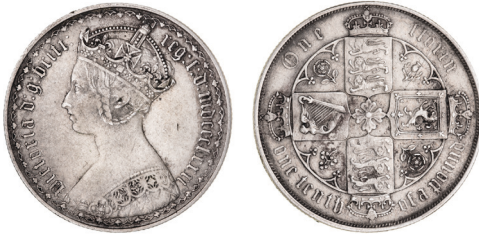
1378* Queen Victoria , Godless florin, 1849 (S.3890), Gothic florin, 1881 (S.3900). Toned, nearly extremely fine; good very fine. (2)