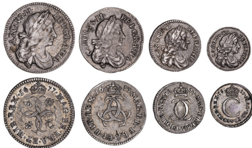
1343* Charles II , Maundy set, 1677 (S.3392). Toned nearly very fine - very fine. (4) $250