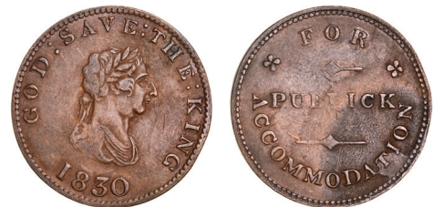
1478* Isle of Man, (John McTurk), George III, pennies (6) and halfpennies (11), 1830 (W.2085-6, 2090-2), in copper (13) and brass (4). One brass penny holed, very good - good very fine. (17)