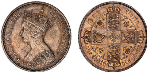
1379* Queen Victoria , Gothic florin, 1855 (S.3891). Toned nearly uncirculated.