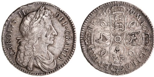
1341* Charles II , fourth bust, halfcrown 1679 (S.3367), inverted A on edge. Flaw at eye, otherwise toned, nearly very fine. $300