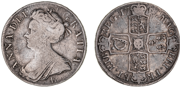
1354* Anne , after the Union, crown, 1708E (S.3600). Very good . $150