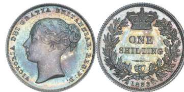
1381* Queen Victoria , proof shilling 1853, (S-3904, ESC-3003, Davies-867) (R2) (5.64g), straight-grained edge. Fully brilliant blue grey and iridescent proof, FDC and very rare.