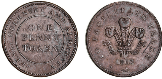
1499* Channel Islands, Jersey, Guernsey and Alderney, copper penny, 1813 (W.2044), die axis en medaille. Very fine. $200