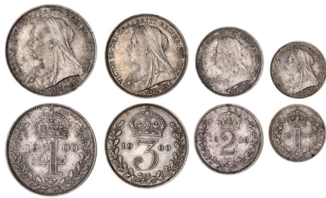
1403* Queen Victoria , old head, Maundy set, 1900 (S.3943). Without case, extremely fine - nearly uncirculated. (4) $160