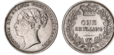
1380* Queen Victoria , Gothic florin, 1872, die no 32 (S.3892); young head shilling, 1870, die no 69 (S.3906A). Good very fine, the second scarce. (2)