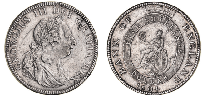
1358* George III , Bank of England, dollar or five shillings, 1804, top leaf to left side of E (S.3708); another but to centre of E (S.3708) no stop after REX. Toned, surface marked, otherwise nearly very fine; polished and scratched very good . (2) $500