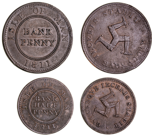
1475* Isle of Man, Isle of Man Banking Co., Castletown, pennies and halfpennies, 1811 (W.2071) (2), (W.2070, 3 one countermarked W.DIXO(N)). Fair - very fine. (5)