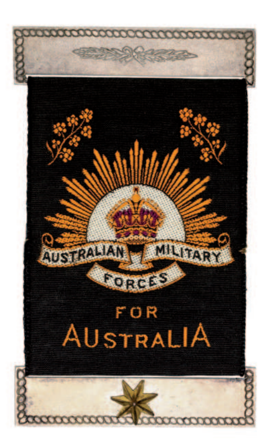
Australia, WWI, Mother's and Widow's ribbon (AIF), with one star, number 15409 on reverse of suspension bar. Metal parts toned, otherwise extremely fine. $150