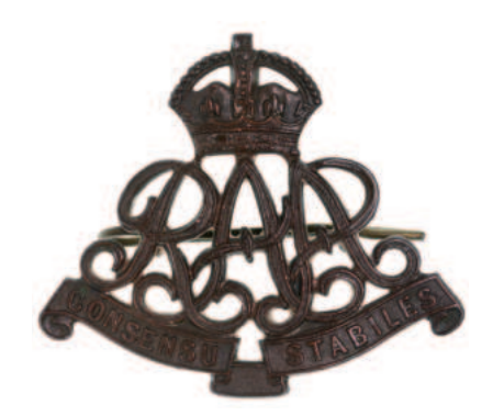
Royal Australian Artillery, 1912-18, hat badge (43mm) (Cossum 149), in oxidised bronze, by Stokes & Sons, Melb. Nearly extremely fine.