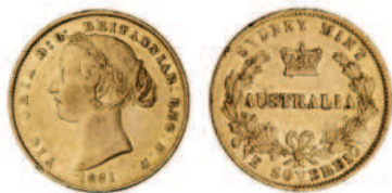
884* Queen Victoria, second type, 1861. Very fine.