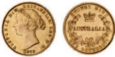
895* Queen Victoria, second type, 1870. Surface marks, nearly very fine.