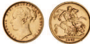
901* Queen Victoria, 1876 Melbourne. Very fine.