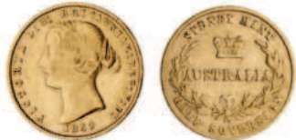
897* Queen Victoria, second type, 1859. Good fine/nearly very fine.