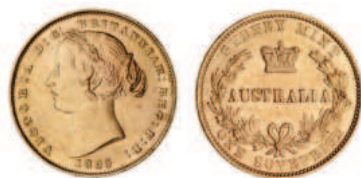
885* Queen Victoria, second type, 1863. Good extremely fine and rare in this condition.