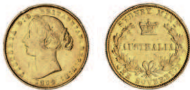
887* Queen Victoria, second type, 1864. Surface marks otherwise good very fine.