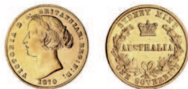
893* Queen Victoria, second type, 1870. Very fine/good very fine.