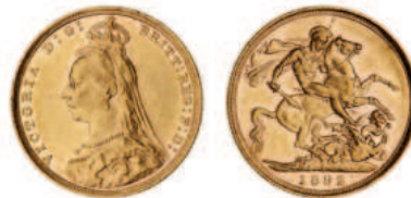
906* Queen Victoria, 1892 Sydney. Good very fine.