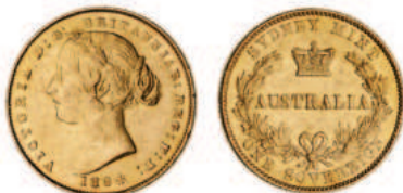
886* Queen Victoria, second type, 1864. Cut at top of Queen's wreath, surface marks, otherwise extremely fine/good extremely fine.