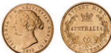
894* Queen Victoria, second type, 1870. Very fine/good very fine.