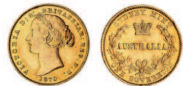
892* Queen Victoria, second type, 1870. Good very fine.