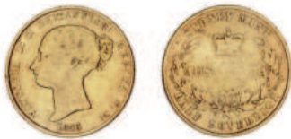
896* Queen Victoria, first type, 1856. Very good/fair.