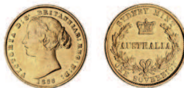
889* Queen Victoria, second type, 1866. Very fine/good very fine.