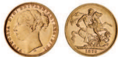
903* Queen Victoria, 1879 Melbourne (McD.157). Good very fine.