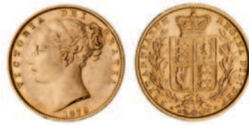
900* Queen Victoria, 1879 Sydney. Very fine/good very fine. $700