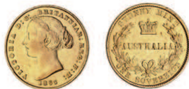
890* Queen Victoria, second type, 1866. Very fine.