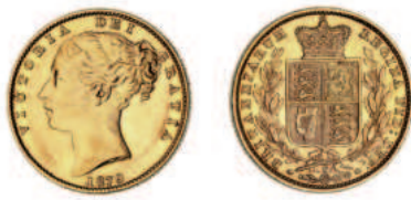
899* Queen Victoria, 1879 Sydney. Good very fine.