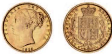
898* Queen Victoria, 1879 Sydney. Good very fine.