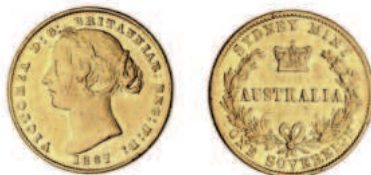
891* Queen Victoria, second type, 1867. Surface marks, otherwise very fine/good very fine.