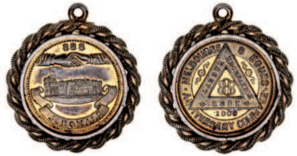
1075* Melbourne 8 Hours Anniversary Committee, 1900, in gilt silver (35mm) with rope surround and loop at top, engraved on reverse 'J.Donald'. Good very fine. $250

Ex Noble Numismatics Auction Sale 88 (lot 1122) John Chapman Collection and then Ex Colonial Auctions.