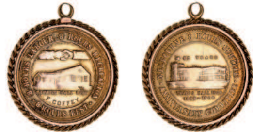
1076* Melbourne 8 Hours Jubilee Anniversary Committee, 1906, in gold (30mm, 7.3g) with rope surround and loop at top, celebrating fifty years of The Trades Hall, engraved to 'F.Coffey'. Very fine. $600