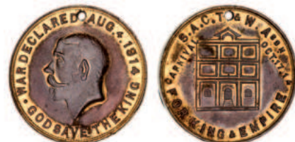
1079* War Declared Aug. 4. 1914, S.A.C.T. & W. Assn (South Australian Commercial Travellers and Warehousemen's Association), medal in gilt bronze (26mm) (C.1914/10; Smith 596), with pierced suspension hole at top edge. Toned good very fine. $40