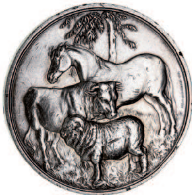
Lot 1065 part