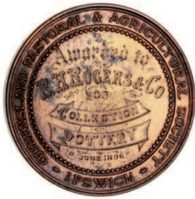
1073* Queensland Pastoral & Agricultural Society, Ipswich, in bronze (49mm), by J.S. & A.B. Wyon, reverse inscribed, 'Awarded to/R.H.Rogers & Co/for/Collection/Pottery/June 1896.'. Cleaned, several tone spots, otherwise very fine. $350