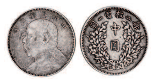
1692* China, Republic, Yuan Shih-kai, silver fifty cents, Yr. 3 (1914) (KM.Y#328). Toned very fine .