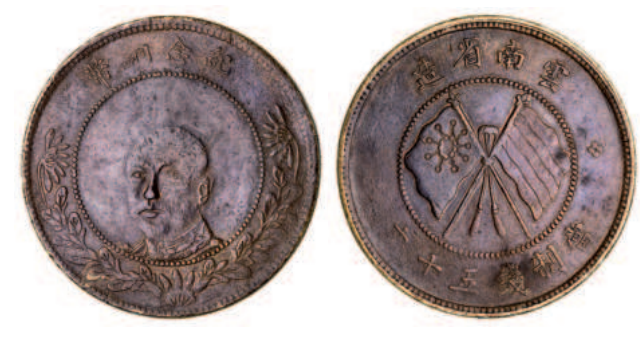
1729* China, Yunnan Province, brass fifty cash (1919) (KM.Y.478). Good very fine. $80