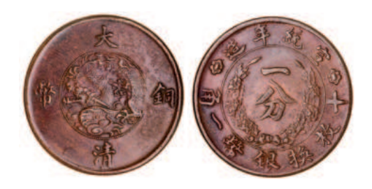
1667* China, Empire, general issue, copper ten cash (1911) (KM. Y.27a). Good very fine . $50