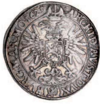
1625* Bohemia, Ferdinand II, silver thaler, 1623, Joachimsthal mint (KM.356). Very fine .