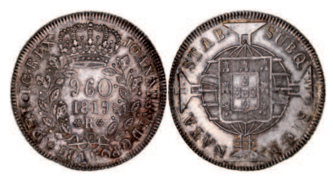
1630* Brazil, John VI, silver 960 reis, 1819R (KM.326.1). Nearly extremely fine. $150