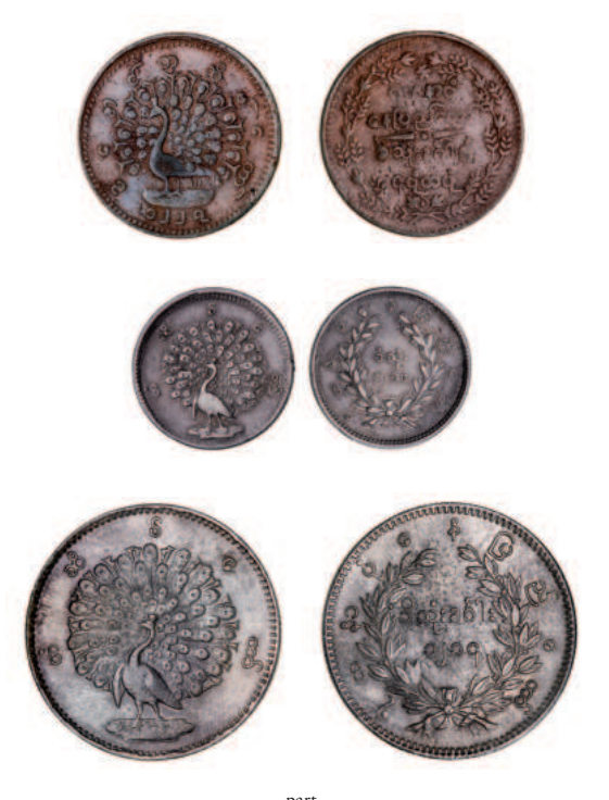
1644* Burma, quarter pe (pice) (1860) (KM.17); silver pe (1853) (KM.6.1), silver mu (1853) (KM.7.1); silver mat (1853)

(KM.8.2), silver kyat (rupee) (1853) (KM.10). Very fine or better. (5)