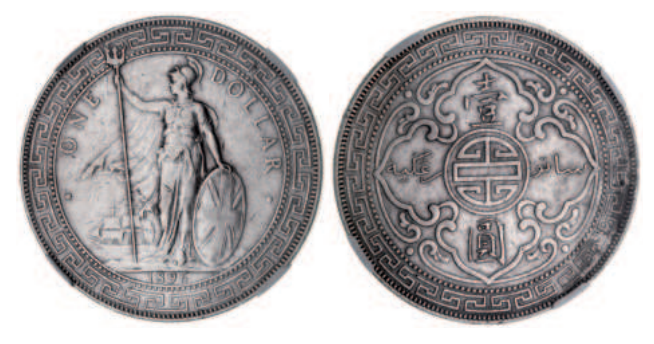
1631^{*} British Trade Dollar, 1896B (KM.T5). Good very fine. $700

In a slab by NGC as AU details surface hairlines.