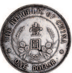
1689* China, Republic, Li Yuan-hung, silver dollar (1912) (KM. Y321). Good very fine . $400