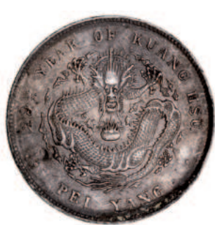
1673* China, Empire, Chihli province, silver dollar, Yr 29 (1903) (KM.Y#73.1). Dark grey matte tone, some mud adhesion, otherwise very fine. $150