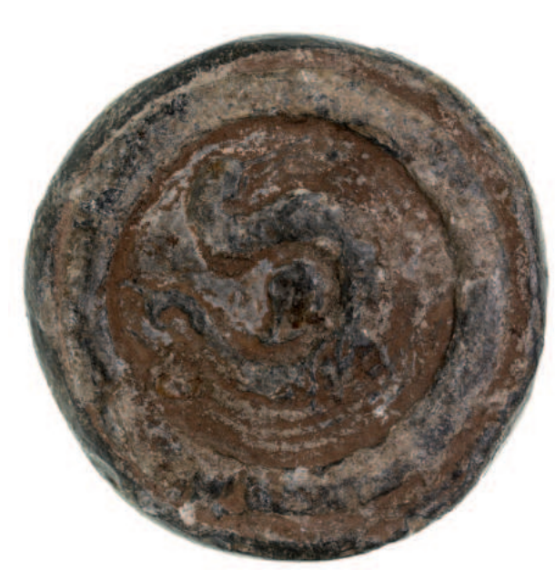
Lot 1642 part