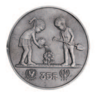
1733* China, People's Republic, matte finish thirty-five yuan, 1979, IYC (KM.8). Uncirculated .