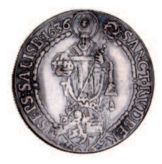
Lot 1605 part