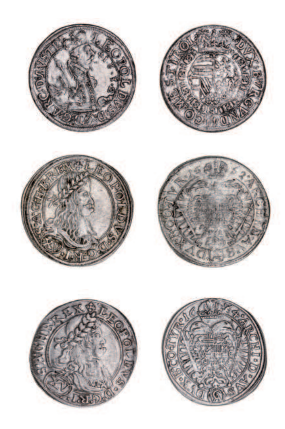
1578* Austria, Leopold, silver 10 kreuzer, 1632, Hall mint (KM.589.2); 15 kreuzer 1662, Vienna mint (KM.1198); 1664 Neuburg am Inn mint (KM.1220.2). Very fine - good very fine. (3)