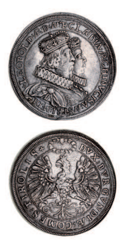
1576* Austria , Leopold, silver two thaler, 1626, Hall mint (KM.641). Good very fine and very scarce .