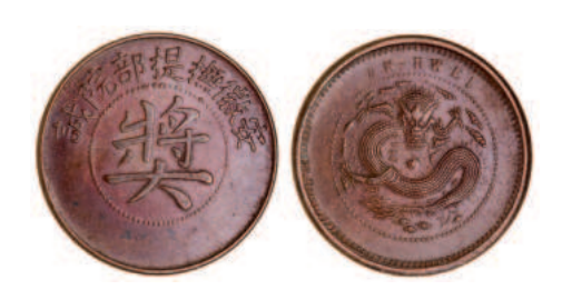
1672* China, Empire, Anhwei Province, military Achen, ten cash (1902) (KM.W47). Glossy brown extremely fine or better and rare.