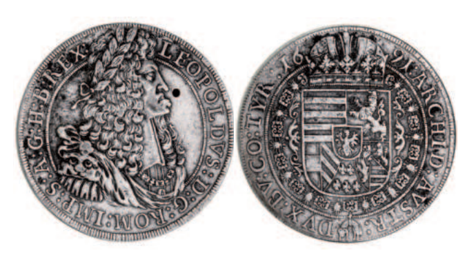
1582* Austria, Leopold I, silver thaler, 1691, Hall mint (KM.1303.2). Punch mark in front of mouth, otherwise nearly very fine. $150

From an old Austro-Hungarian Collection.