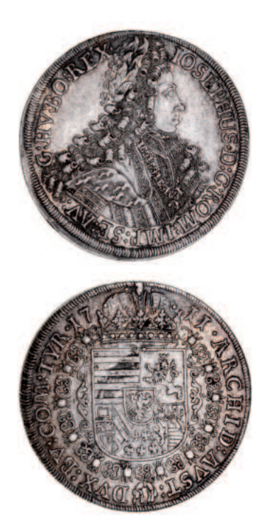
1585* Austria, Joseph I, silver thaler, 1711, Hall mint (KM.1438.3). Trace of old mount at top edge, attractive tone, extremely fine with mint bloom.

From an old Austro-Hungarian Collection.