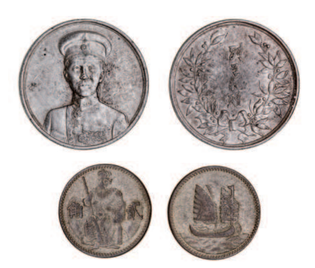
1724* China, Republic, Chang Hsueh-liang medallic fifty cents (KM.XM535) appears to be nickled silver (19.18g), also jeton, Emperor/Junk. Very fine ; fine . (2)