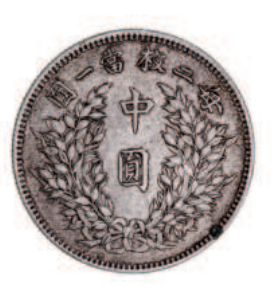
1690* China, Republic, Yuan Shi-kai, silver fifty cents (KM.Y.328). Very fine/good very fine.