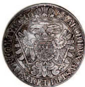
1583* Austria, Leopold I, silver thaler, 1695, Vienna mint (KM.1275.4). Die break and flaw behind head, vertical scratch in front, otherwise good very fine.