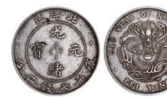
1675* China, Empire, Chihli Province, silver dollar, Yr 34 (1908) (KM.Y#73.3). Very fine.