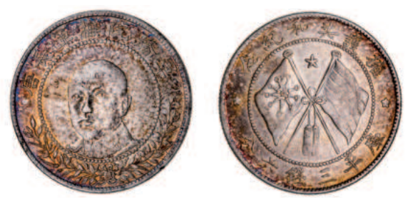
1727* China, Yunnan Province, silver fifty cents (1917) (KM. Y.479). Toned good very fine. $50