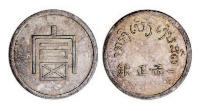
1731* China, Republic, Yunnan Province, silver tael (36.78g) Fu in Hanzi character, reverse legends in Burmese and Hanzi characters, straight grained (or milled) edge (incomplete) (Kann 940). Nearly extremely fine. $500