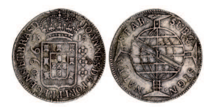
1629* Brazil, John VI, silver 960 reis, 1816B (KM.307.1). Very fine. $100