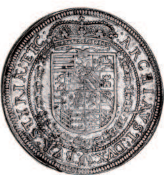
1575* Austria, Ferdinand II, silver thaler, 1625 (KM.521). Slightly wavy, otherwise good very fine with some underlying mint bloom.