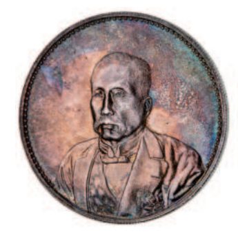
1700* China, Republic, Yuan Shih-kai silver dollar Yr. 9(1920) (KM.Y.329.6) and another with single chopmark either side. Very fine . (2)