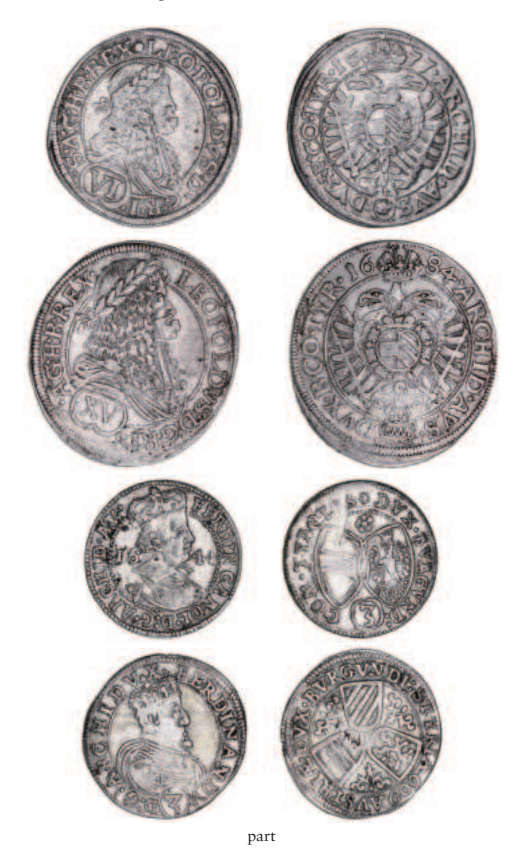
1581* Austria, Leopold, 6 kreuzer, 1677, Vienna Mint (KM.1185), 15 kreuzer 1684, Mainz Mint MW (cf KM.1335) (date not listed); Ferdinand Charles, 3 kreuzer 164(6), Hall Mint (KM.852); Ferdinand II, 3 kreuzer 1609 (KM.32); Charles, 3 kreuzer, ND (c1590). Very good - very fine. (5)

From an old Austro-Hungarian Collection.