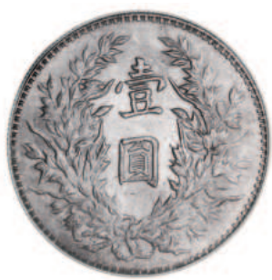
1694* China, Republic, Yuan Shi-kai silver dollar, Yr 3 (1914) (KM. Y.329). Considerable original mint bloom, uncirculated. $300