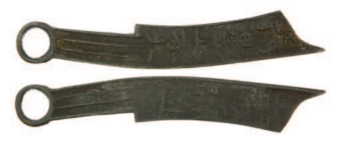
1656* China, warring states, State of Qi, (c.400-220 B.C), five characters knife money, obv. reading "Ji Mo Zhi Fa Hua" (Jimo's Legal Money), rev. Pi Feng, (length 165mm), (weight 63.22g), (Hartill 4.2at). Evenly toned, fine and very rare.