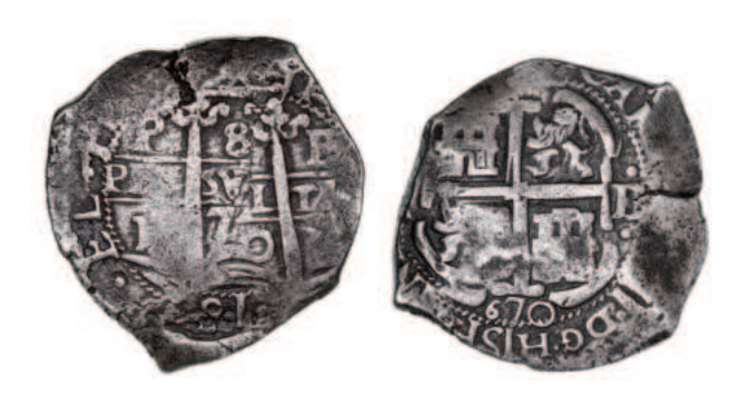
1626* Bolivia, Charles II, cob silver eight reales, 1670P (Potosi) (26.51g) (KM.26). Usual uneven striking, toned good fine and rare.

From an old Austro-Hungarian Collection.