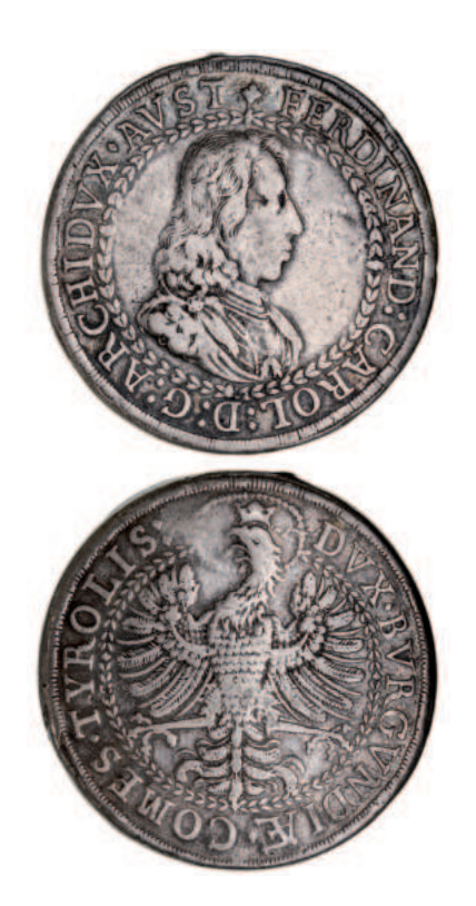
1580* Austria, Ferdinand Charles, silver two thaler, 1646, Hall mint (KM.934). Old mount cut off at top, nearly fine.

From an old Austro-Hungarian Collection.