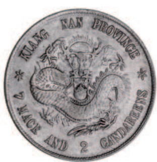
1663* China, Empire, silver dollar (1898) (KM.Y#145a.1). Cleaned very fine.