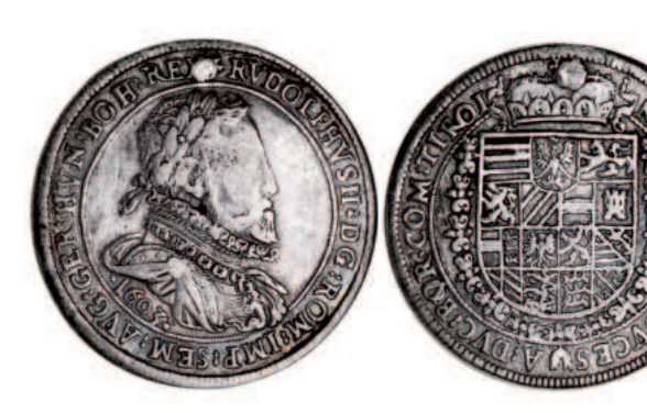
1573* Austria, Rudolph II, silver thaler 1603, Hall mint (KM.37.1). Has been plugged at the top, otherwise good fine with slight bend.