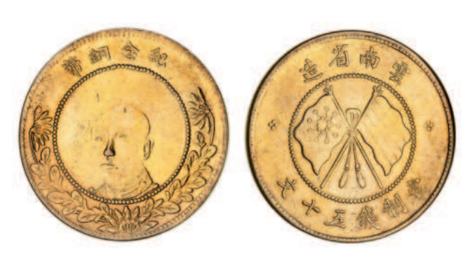
1726* China, Republic, Yunnan Province, brass fifty cash (1919) (KM.Y#478), a later strike or copy (?). Mint bloom, uncirculated. $100