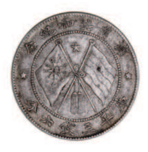
1728* China, Republic, Yunnan Province, General Tang Chi-yao, silver fifty cents (1917) (KM.Y.479). Very fine . $50