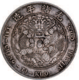
1665* China, Empire, Central mint silver dollar (1908) (KM.Y#14). Toned very fine.