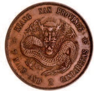
1684* China, Empire, Kiang Nan Province, plain edge pattern dollar in red bronze (KM.Pn4). Extremely fine and rare. $1,500