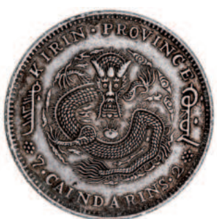
1685* China, Empire, Kirin Province, silver dollar (1907) (KM. Y#183). Good very fine. $350