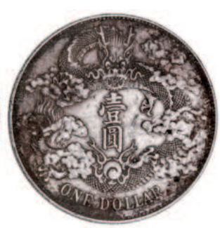
1670* China, Empire, silver dollar (1911) (KM.Y.#31). Some dark adhesions, nearly very fine. $200