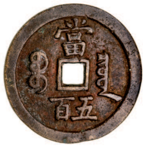
1662* China, Empire, Hsien-Feng, 500 cash (1857-61) (KM.C2-9). Very fine .