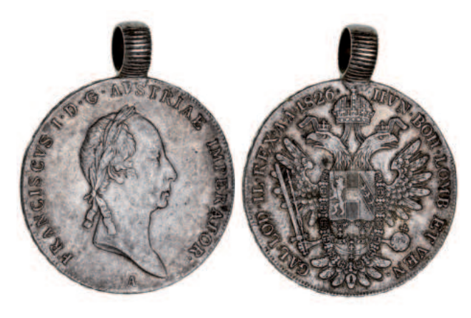
1599* Austria, Franz II (I), silver thaler, 1826A (KM.2163). Old loop mount at top to take heavy silver chain, otherwise nearly extremely fine.

From an old Austro-Hungarian Collection.