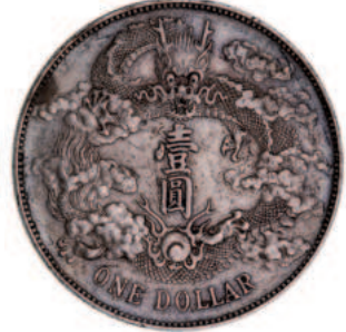
1669* China, Empire, silver dollar (1911) (KM.Y#31). High rim , good very fine. $300