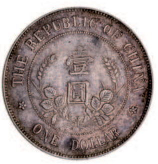
1688* China, Republic, Li Yuan-hung silver dollar (1912) Founding of the Republic (KM.Y.320). Light grey tone, very fine. $1,000