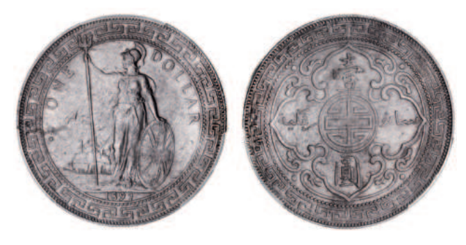
1632* British Trade Dollar, 1897B (KM.T.5). Toned extremely fine.

In a slab by NGC as AU details surface hairlines.