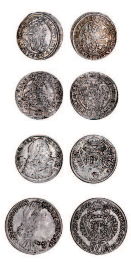
1584* Austria, Leopold I, silver 3 kreuzer, 1704IP (KM.1116); Joseph I, silver 3 kreuzer, 1706GE (KM.1428); Karl VI, silver 3 kreuzer, 1739, Hall Mint (KM.1660), silver 6 kreuzer, 1729, Hall Mint (KM.1615). Fine - very fine. (4)

From an old Austro-Hungarian Collection.