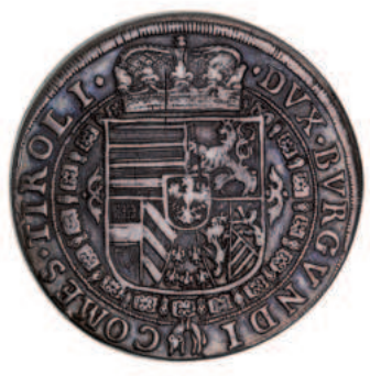
1577* Austria, Leopold, silver thaler 1632, Hall mint (KM.629.2) (Dav. 3338). Very fine .