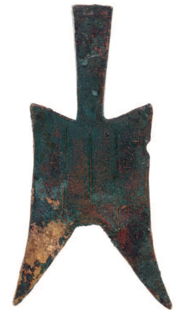
1655* China, Eastern Zhou dynasty - Warring States Period, State of Zhao, (c. 500-400 B.C.), AE Large pointed shoulder spade (125x67mm, 59.03 g), obv. three vertical lines, characters to right, rev. three vertical lines, (cf.Hartill 2.184). Green patina with earthen deposits and encrustations, rare.