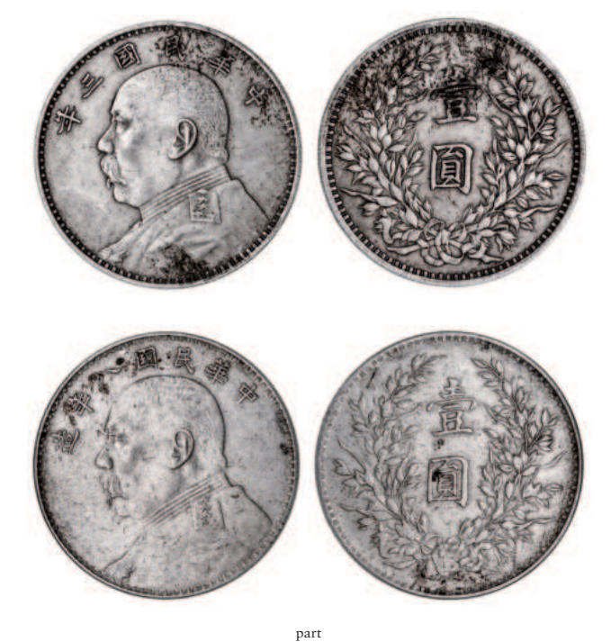
1691* China, Republic, Yuan Shi-kai, silver dollar, Yr 3 (2), Yr 8 (KM.Y329, 329.6); Sun Yat Sen, memento silver dollar (1927) (KM.318a.2). Toned, very fine . (4) $200