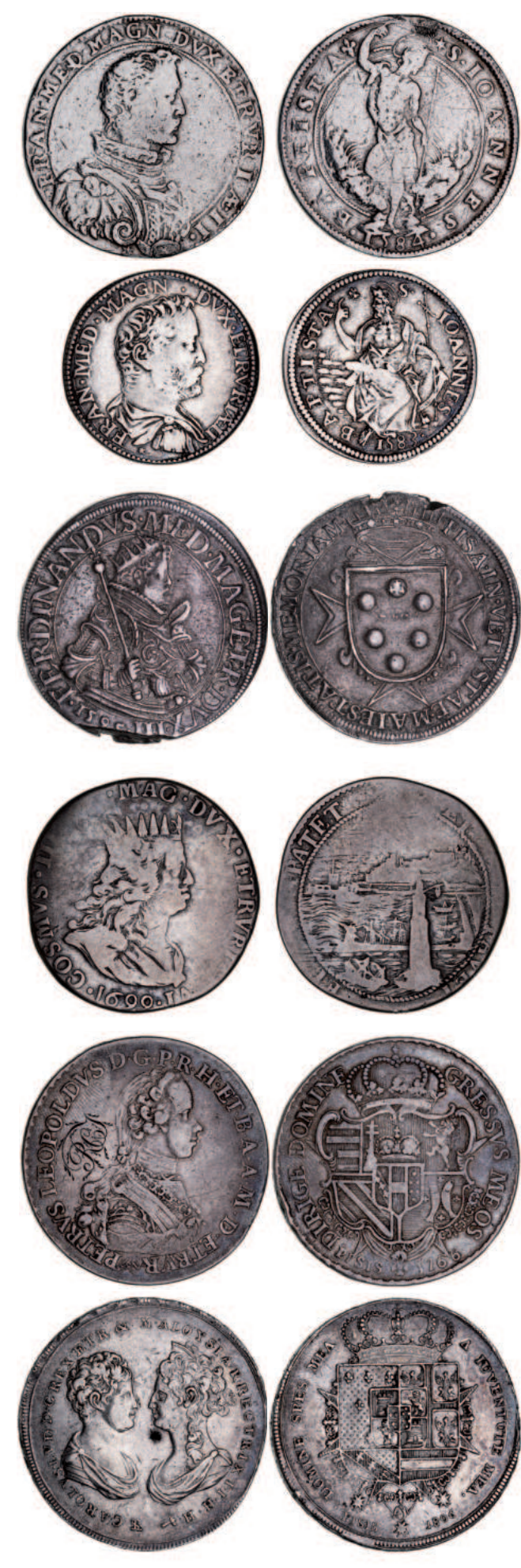
Lot 1898 part

Italy, Tuscany, Francis I, (1574-1587) silver piastre, 1574 (Dav. 8386) (27.50g), silver testone, 1583 (32mm); Ferdinand I, (1587-1609) silver piastre 1595 (Dav. 8389); Ferdinand II, (1620-1670) silver (20mm); Cosimo III, silver tollero, 1699, Livorno mint; Peter Leopold, silver 10 paoli, 1766 (KM.C21a) paoli 1788 (KM.C.17a); Carlo Louis, silver Francescone (10 paoli) 1806 (KM.C.50.2); Emilia, Victor Emmanuel II, silver 50 centesimi, 1860 (KM.11), described in packets. Very good to good very fine. (9)