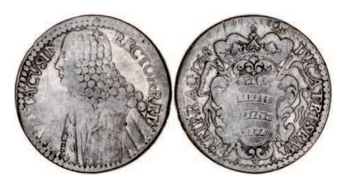
1961* Ragusa , Republic, silver tallero, 1768GA (KM.18). Nearly fine .

Ex Dr L.J.Sherwin Collection, with ticket.