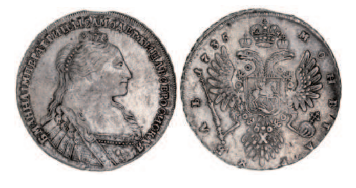
1967* Russia , Anna, silver rouble, 1735 (KM.197). Very fine/good very fine .