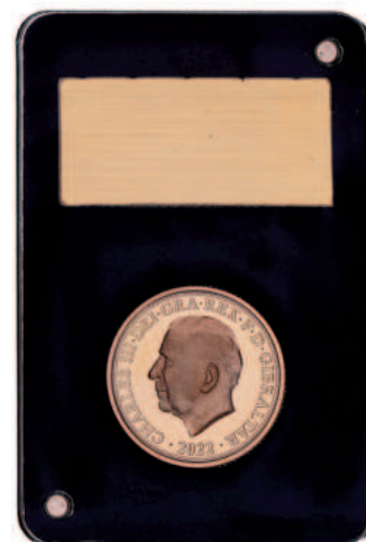
2112* Gibraltar , Charles III, proof sovereign, 2022, passing of the Crown. In case of issue by the London Mint with certificate 99/4,999, FDC .