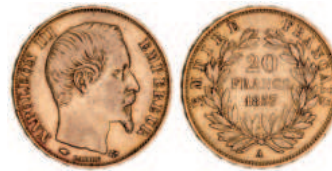
2110* France , Napoleon III, twenty francs, 1857A (KM.781.1). Very fine .