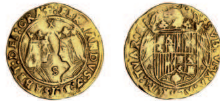
2175* Spain, Ferdinand V and Isabella I (1476-1516) gold two excellentes, Seville mint (c2776; Ramirez 580; Fr. 129) issued 1497-1516. Some crinkling, otherwise good fine. $1,250