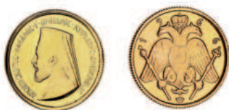
2109* Cyprus , medallic issue, half sovereign, 1966 (KM.M1) Archbishop Makarios III, struck at the Paris Mint. Very fine .