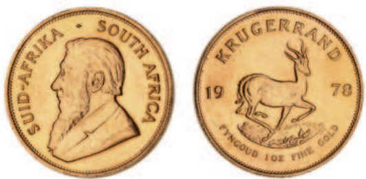
2171* South Africa, Republic, krugerrand, 1978 (KM.73). Semi-mirror fields, uncirculated. (2) $6,000