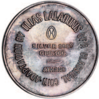
2196* Greece, silver medal (51mm), undated, featuring a Greek warrior with sword in hand on horseback, reverse, Ilias Lalaounis trademark in the top centre above 'Silver 999/ GRS.100/Athens' and around this reads, 'Adaptation By Ilias Lalaounis Of A Classical Coin'. Toned extremely fine.