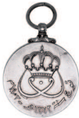
2197* Iraq, Kingdom, Coronation of King Faisal II, AH1372/1953, commemorative medal in silver, obverse bust right of King Faisal II, reverse, crowned cipher of King Faisal II, inscription below. Good very fine.