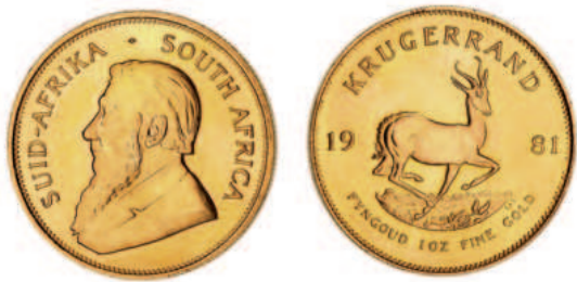
2173* South Africa, Republic, krugerrand, 1981 (KM.73). Semi-mirror fields, uncirculated. $3,000