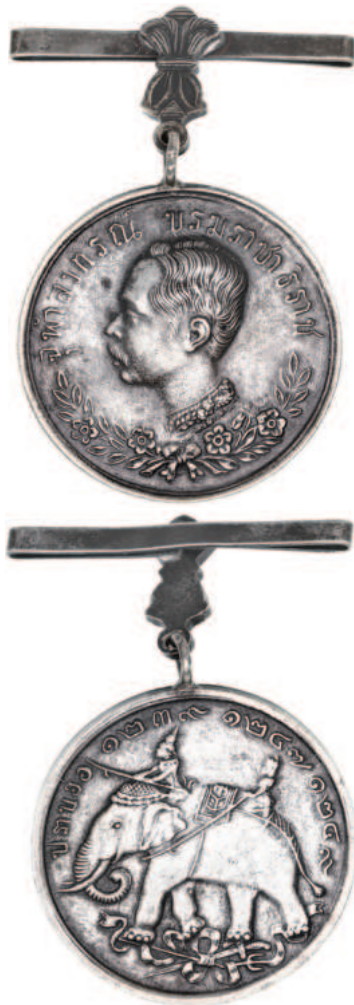
2209* Thailand , Rama V Chulalongkorn (1868-1910) medal in nickel, with suspender bar (42mm). Toned, edge nick, very fine.