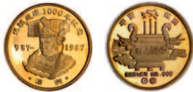
2106* China , People's Republic, medallic bullion coinage, proof 1/4 ounce 999 fine gold 1987 (KM.X#MB36). FDC . $900