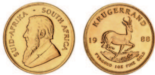
2174* South Africa, Republic, krugerrand, 1988 (KM.73). Uncirculated. $3,000