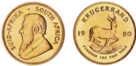
2172* South Africa, Republic, krugerrand, 1980 (KM.73). Semi-mirror fields, uncirculated. (2) $6,000