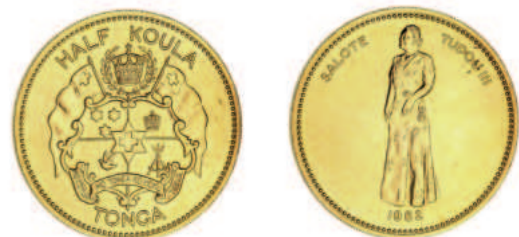
2178* Tonga, Salote, half koula, 1962 (KM.2). Matte, uncirculated. $1,000

Ex Dr L.J. Sherwin Collection, from Downies Sale 21.7.1972 (lot 233).