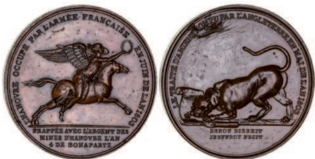
2227* France, Napoleonic medal, Treaty of Amiens broken and Hanover occupied, 1803, in bronze (41mm) by Jeuffroy (Bramsen 271). Lacquered, extremely fine.