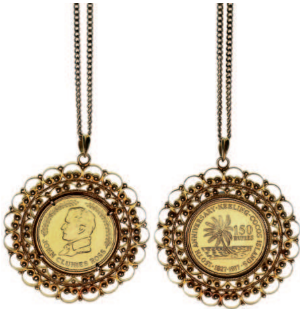
2107* Cocos (Keeling) Islands , mint 916 fine gold 150 rupees, 1977 (KM.X10a), set in ornate filigree surround mount in gilt silver with 9 carat gold fine chain (4.33g), as presented to a member of a resident family by the Clunies Ross family (gross weight 25.55g). Uncirculated .