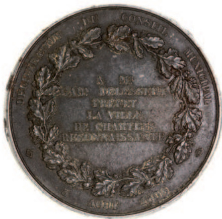
2228* France, Chartres, Louis-Philippe I, fire of Chartres Cathedral, (deliberation of the Municipal Council), 1837 Paris, commemorating the fire of Chartres Cathedral in 1836, made with the metal of the melted bells, signed Barre, (56mm). Casting flaws, very fine.