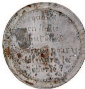
2229* France, Revolution of 1848, lead medal, "plombe fratricide", depicting protruding cannon ball and French inscription relating to the June uprising, (44mm). Very fine and scarce.