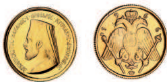
2108* Cyprus , medallic issue, half sovereign, 1966 (KM.M1) Archbishop Makarios III, struck at the Paris Mint. Extremely fine .