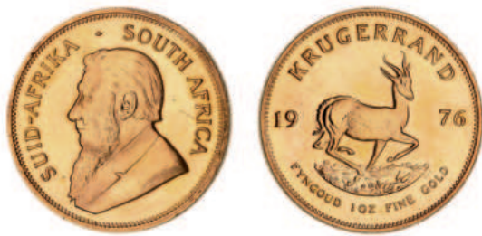
2169* South Africa, Republic, krugerrand, 1976 (KM.73). Semi-mirror fields, uncirculated. $3,000