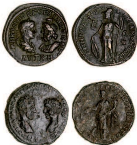
Lot 2648 part