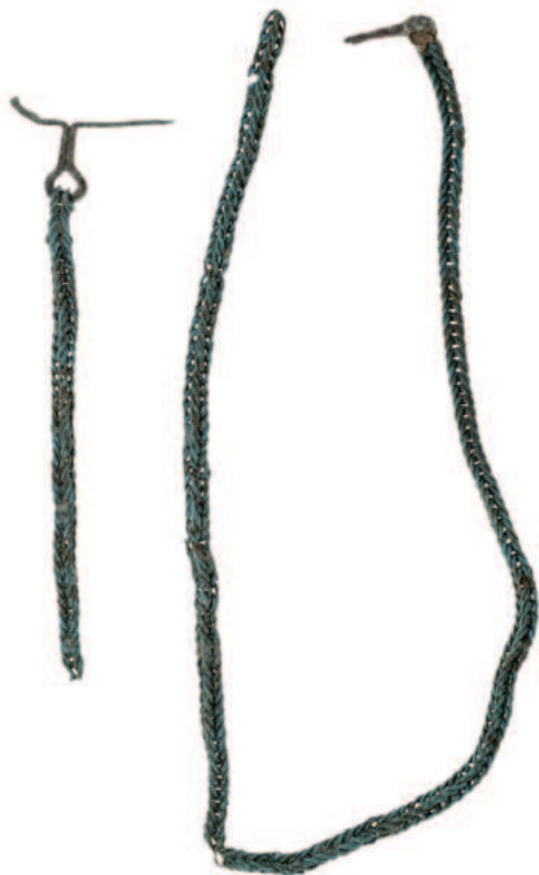
2870* Ancient Roman , c.2nd century A.D., two copper/bronze jewellery chain necklaces, of finely worked links with bar clasps, one 580mm long (in two parts), the other 720mm long. Very fine with some encrustation, a rare survival. (2) $100