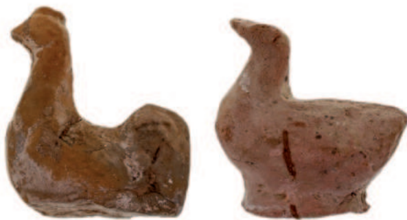
2867* Ancient Greek/Roman , 1st-2nd century A.D., terracotta model of a seated cockerel, (75mm x 65mm); another terracotta model of a squat duck, (70mm x 65mm). Very fine. (2)