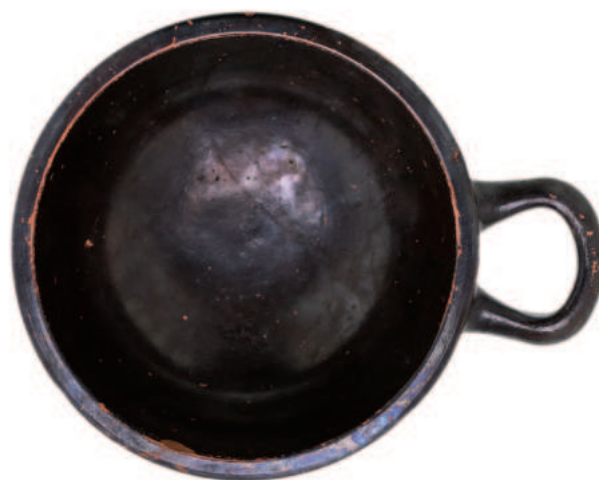
2865* Greeks in Southern Italy, Apulia, black Calene ware, glazed single handle pottery cup, c.330 B.C., height 50mm, width 120mm. Attractive glaze with no cracks or chips, extremely fine.