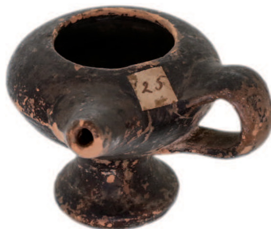
2864* Greek Southern Italy, c.4th century B.C., Campanian black ware askos, bulbous smooth body with central hole, round lip and rounded handle, (75mm high, 85mm wide); another smaller black ware pourer with conical spout and handle to side, (50 mm high, 70mm wide). Very fine - extremely fine. (2)