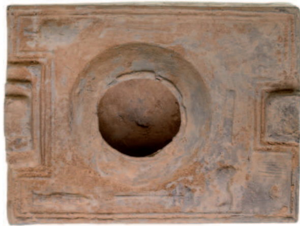
2871* China , Han Dynasty, (206 B.C. - 220 A.D.), unglazed pottery model of a cooking stove, modelled with cooking utensils and foodstuffs to the top, (90mm high x 190mm long). Very fine. $300