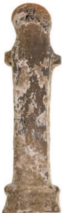
2863* Greeks in Southern Italy, c.3rd century B.C., terracotta model of a herm, depicting a bearded armless male with evident phallus, (150mm high). Very fine with encrustation.