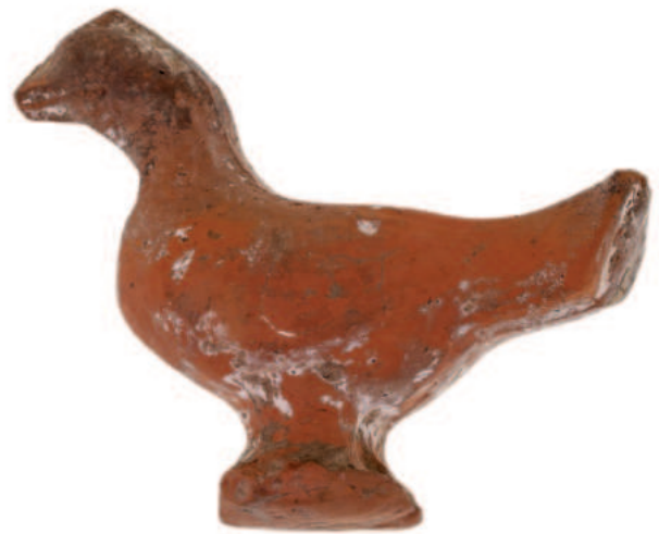
2868* Ancient Roman Provincial , potentially Holy Land, c.1st-2nd century A.D, terracotta bird, possibly a chicken, (110mm high x 130mm long). Very fine.