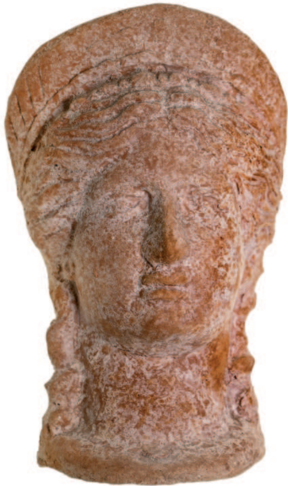
2866* Greco-Roman , terracotta female head, c.1st-2nd century A.D., depicting a lady with elaborate hair pulled to the back and wearing a stephane, (175mm high). Very fine.