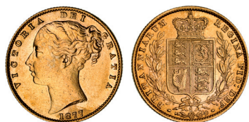
390* Queen Victoria, 1878 Sydney. Good very fine.