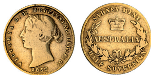
379* Queen Victoria, second type, 1857. Very good.