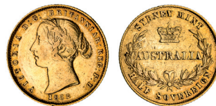
385* Queen Victoria, second type, 1862. Lightly polished, otherwise very fine.