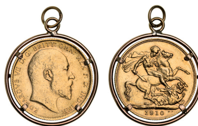
349* Edward VII , sovereign 1910 Sydney in gold surround mount. Very fine. $900