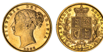
397* Queen Victoria, 1885 Sydney. Good very fine.