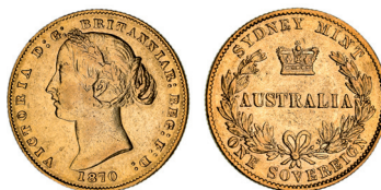
375* Queen Victoria, second type, 1870. Nearly very fine. $900