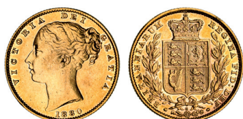
392* Queen Victoria, 1880 Sydney. A little polished, otherwise good very fine.