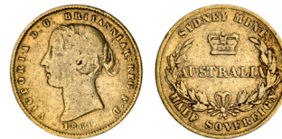
384* Queen Victoria, second type, 1861. Nearly fine.