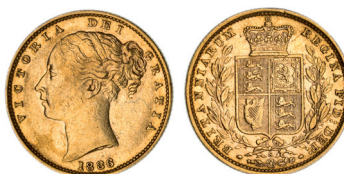
398* Queen Victoria, 1886 Sydney. Good very fine.