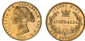
373* Queen Victoria, second type, 1870. Nearly very fine. $900 Ex Noble Numismatics Sale 45 (lot 245).