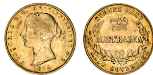
387* Queen Victoria, second type, 1864. Damaged obverse, nearly fine.