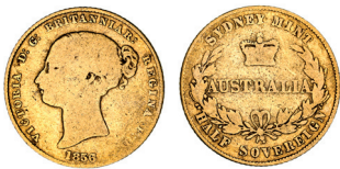
378* Queen Victoria, first type, 1856. Very good.