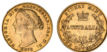
376* Queen Victoria, second type, 1870. Good fine/ nearly very fine. $1,000