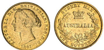
361* Queen Victoria, second type, 1861. Surface marked otherwise good fine. $900