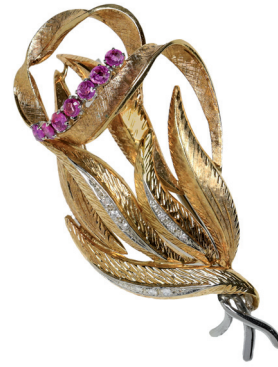
344* Brooch, 18 carat yellow and white gold Italian feather style brooch, set with three rows of small round diamonds, and 7 larger pink stones (8.87g). Extremely fine.