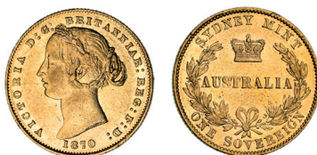
372* Queen Victoria, second type, 1870. Very fine. $1,000 Ex Noble Numismatics Sale 45 (lot 243).