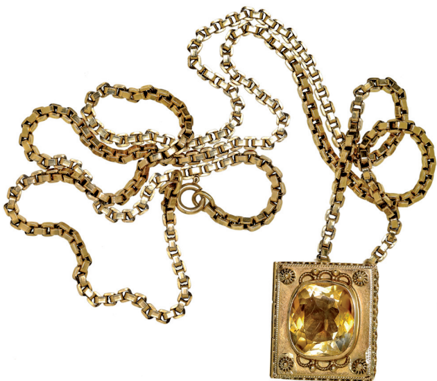
346* Poisoner's pendant , ornate yellow gold hinged pendant set with a large topaz on the base, and a diamond, ruby, sapphire, and amethyst on each side (XRF tested at 70% gold, 20.45g), suspended on an 18ct yellow gold box cut chain (17.27g). Human hair inside pendant, very fine. $4,000