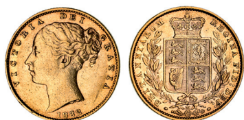
393* Queen Victoria, 1882 Melbourne. Good very fine.