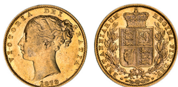
391* Queen Victoria, 1879 Sydney. Good very fine/ extremely fine.