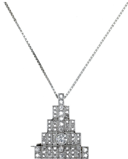
345* Ladies diamond brooch, stepped triangular platinum and diamond brooch (XRF tested 93%), set with large central round diamond, with 8 smaller round diamonds set above and below, surrounded by smaller round diamonds, suspended on a white gold box cut chain (stamped 750 fine) (chain 5.24g, brooch 6.77g) . Very fine.