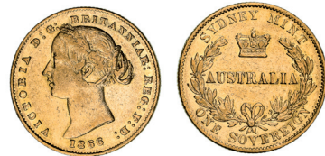
366* Queen Victoria, second type, 1866. Good fine. $900