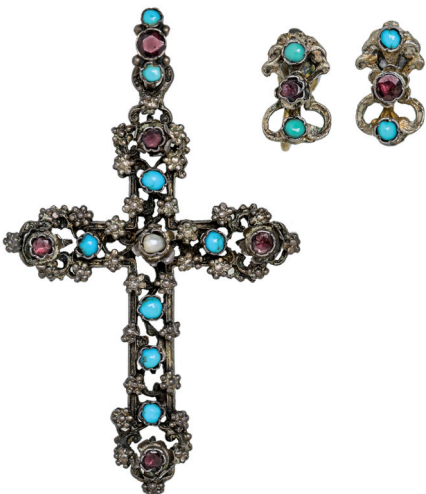
343* Hungarian silver crucifix, 1860's, with a garnet set at each point and a pearl at the centre, turquoise set between, with a matching set of silver and brass screw on earrings. Very fine; earrings fine. (3)