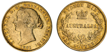
360* Queen Victoria, second type, 1861. Fine/ good fine. $900