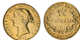
383* Queen Victoria, 1861. Good fine.