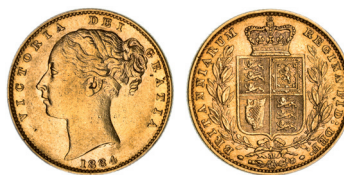
395* Queen Victoria, 1884 Melbourne. Very fine.