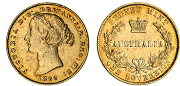
365* Queen Victoria, second type, 1866. Nearly very fine. $1,200