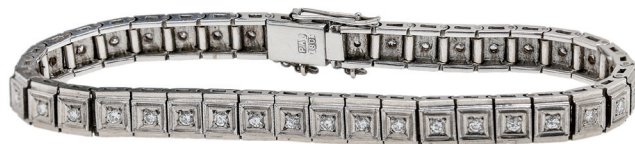
348* Diamond Bracelet , 18ct white gold square link bracelet, each link set with a approx 0.1 carat diamond (23.45g total). In a Tiffany & Co. box, very fine. $2,400