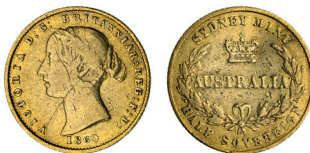
382* Queen Victoria, second type, 1860. Obverse scratches, otherwise nearly fine and rare.