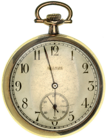
342* Gentleman's pocket watch, by Hallmark, gold plated, in working order. Very fine.