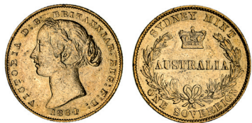
362* Queen Victoria, second type, 1864. Surface marks, otherwise very fine. $1,200