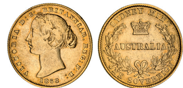
368* Queen Victoria, second type, 1868. Good fine. $900