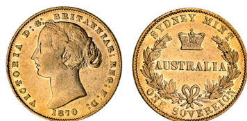
374* Queen Victoria, second type, 1870. Nearly very fine. $1,200