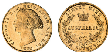
371* Queen Victoria, second type, 1870. Very fine. $1,000 Ex Noble Numismatics Sale 45 (lot 242).