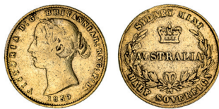
381* Queen Victoria, second type, 1859. Fine.