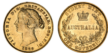
364* Queen Victoria, second type, 1866. Surface marks, otherwise extremely fine. $1,200