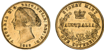
359* Queen Victoria, second type, 1859. Nearly very fine. $1,100