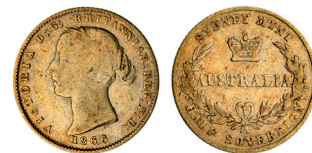
388* Queen Victoria, second type, 1866. Very good.