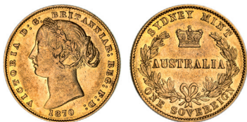
370* Queen Victoria, second type, 1870. Good very fine. $1,000