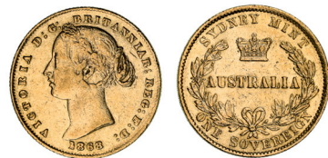
367* Queen Victoria, second type, 1868. Good fine. $1,000