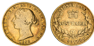
380* Queen Victoria, second type, 1888. Very good.

Ex IAG Sale 97 (lot 471) with their tag.