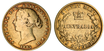
363* Queen Victoria, second type, 1865. Nearly fine. $1,000