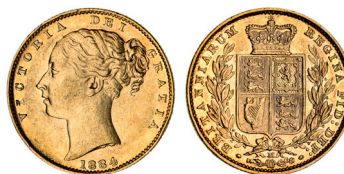
394* Queen Victoria, 1884 Melbourne. Extremely fine.