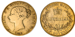
377* Queen Victoria, first type, 1856. Nearly fine.