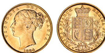
396* Queen Victoria, 1884 Sydney. Nearly extremely fine.