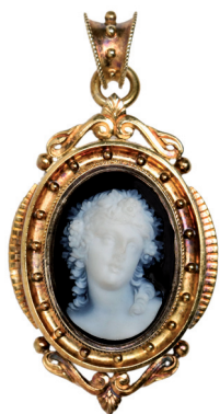
347* Cameo locket , 18ct yellow gold locket, beaded suspension bail, set with large carved agate depicting classical female head (22.39g total weight). Small chip on nose of cameo, otherwise very fine. $2,500