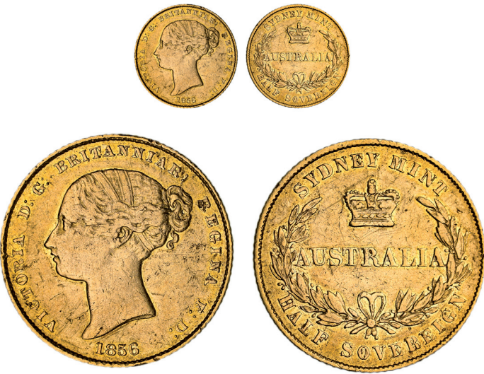
655* Queen Victoria, first type, 1856. Good very fine.