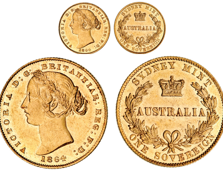
644* Queen Victoria, second type, 1864. Nearly uncirculated.