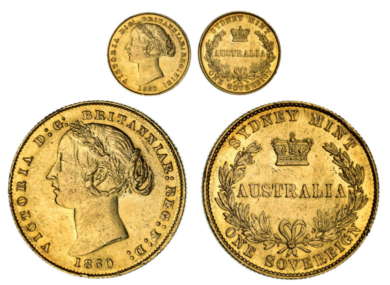
Queen Victoria, second type, 1860. Subdued underlying mint bloom/considerable bloom, nearly uncirculated and very rare in this condition, one of the finest known. $6,000

Ex Noble Numismatics Sale 126 (lot 936) March 2021 and previously Sale 111 (lot 1108) April 2016.