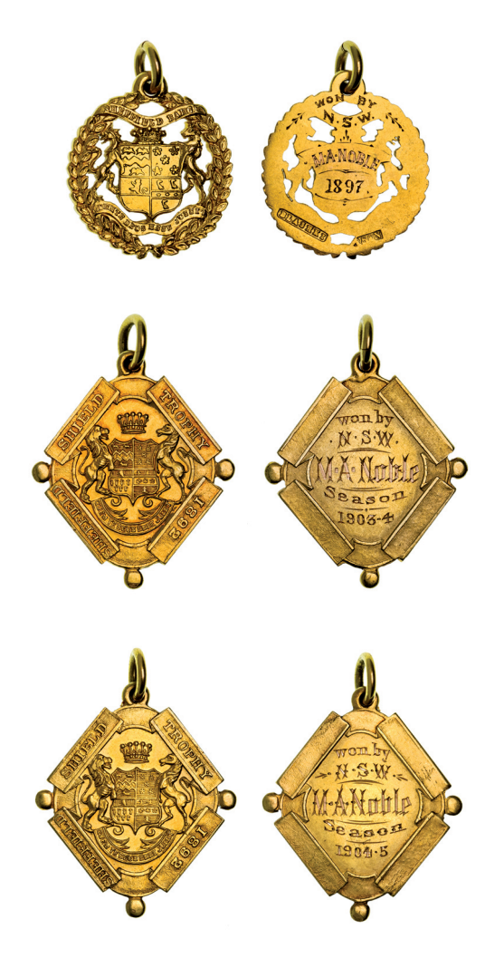
1994* Sheffield Shield, prize medal in voided gold (9ct; 9.53g; 24mm), by Blashki & Son, ring top suspension, reverse inscribed, 'Won By/N.S.W./M.A.Noble/1897.'; Sheffield Shield Trophy 1892, prize medal in gold (15ct; 11.17g;

29x31mm), ring top suspension, reverse inscribed, 'won by/N.S.W/M.A.Noble/Season/1903-4'; another identical medal in gold (15ct; 10.73g; 29x31mm), ring top suspension, reverse inscribed, 'won by/N.S.W/M.A.Noble/Season/1904-5'. Nearly extremely fine . (3)