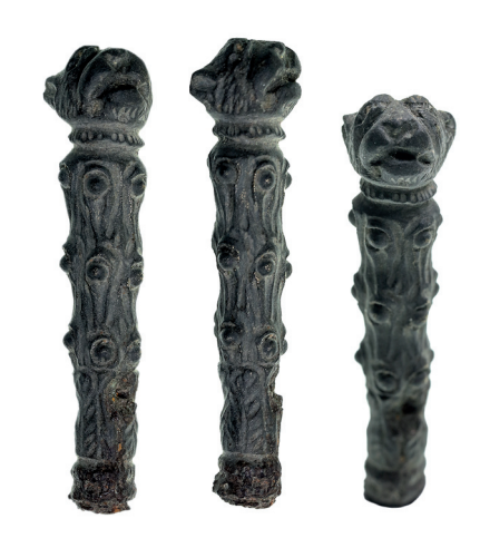
2994* Roman, (c.1st-2nd century AD), bronze knife handle, attractively modelled as the club of Hercules, surmounted by lion's head, (55mm long). Very fine and rare .

Roman, (c.1st-3rd century AD), bronze belt buckles, hand worked of various sizes, some for equine equipment, one with circular patterns, (20mm-55mm long). Very fine and scarce. (6)