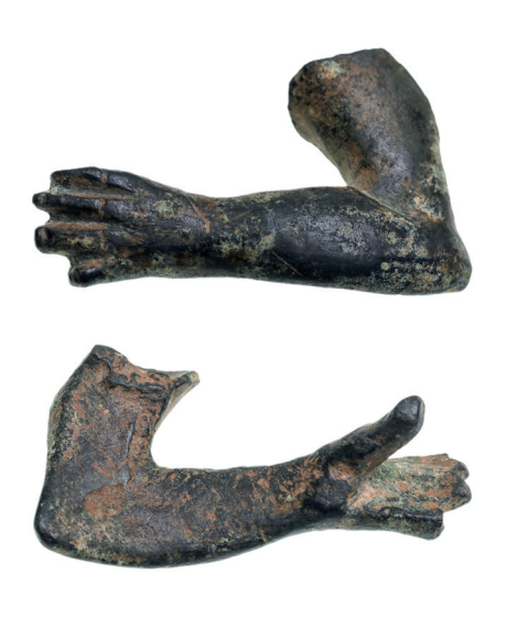
2995* Roman, (2nd century AD), bronze statuette fragment of a grasping left hand with forearm and bicep, (50mm long). Very fine and scarce.