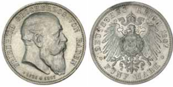
1743* Germany , Baden, Friedrich I as grand duke, (1856-1907), silver five marks 1907, Death of Friedrich I, (KM.279). Bright, nearly uncirculated.