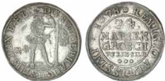
1746* Germany , Brunswick-Wolfenbüttele, Rudolf August (1666-1704), silver twenty four mariengroschen or two thirds thaler, 1678, (KM.516). Very fine or better.