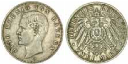
1745* Germany , Bavaria, Otto (1886-1913), silver two marks 1898D, (KM.511). Very fine, rarest date.