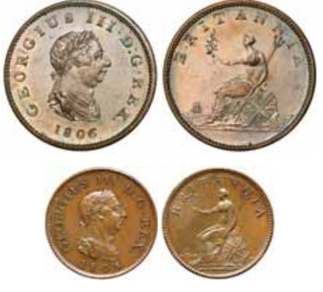
lot 1667 part