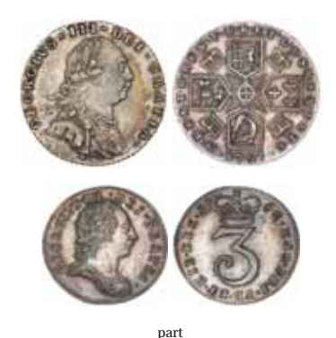
George III , silver sixpences, 1787, without and with semee of hearts (S.3748-9); silver threepences, 1762 (S.3753), 1795 (S.3755). Good very fine - extremely fine. (4) $120