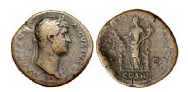
With detailed collector's ticket.