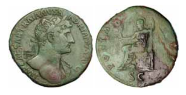
Ex Barry Tatum, Forth Worth, USA ($165) with ticket and detailed collector's ticket