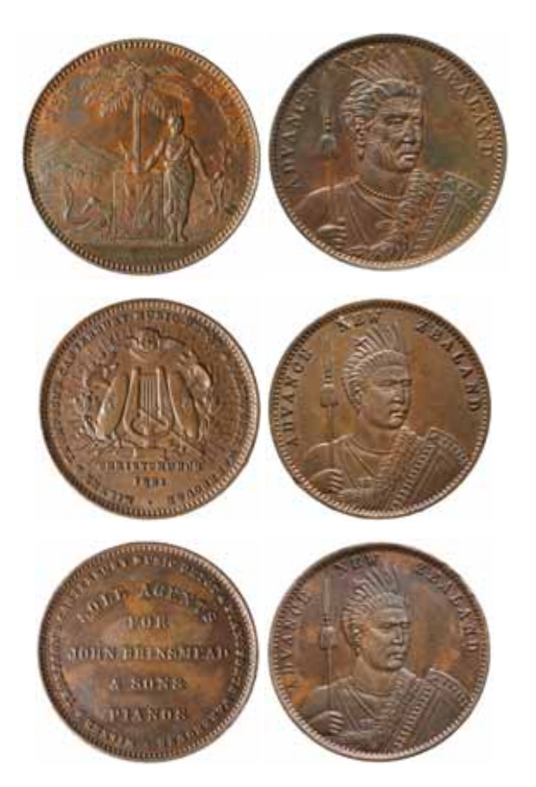
Holland & Butler , Auckland penny, undated (A.263; L.324). Glossy tone, good very fine. $170