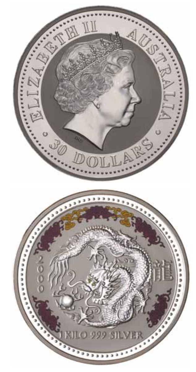
lot 707 next page