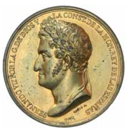
lot 3840 obverse

Lithuania , 7th world sports of Lithuania competition 2005, in aluminium bronze in case of issue; USSR era Lithuania sports award medals (17) in bronzed or brass different sizes, all uninscribed, seven large (40-55mm) and ten small (30mm) with enamelled clasps; also proof ten litu in hard plastic case. Uncirculated - FDC. (19)