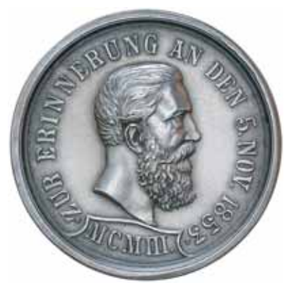
lot 3809 obverse