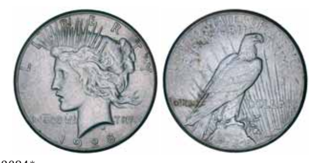
3684* U.S.A. , Peace silver dollar, 1928. Uncirculated .