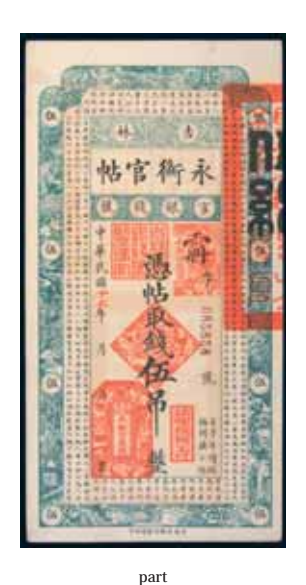
China , Kirin Yung Heng Provincial Bank, 1917-18 issue, five tiao, 085858 and ten tiao, 00130 (P.S985, 6); 1928 issue, one hundred tiao, 096748 (P.S1081A). Extremely fine; very fine; very fine; very fine . (3)