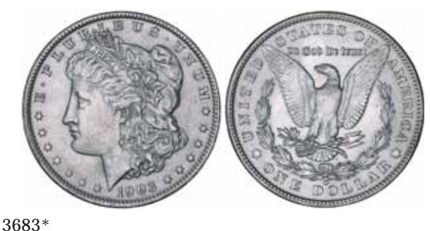
U.S.A., Morgan silver dollar, 1903O. Uncirculated. $450