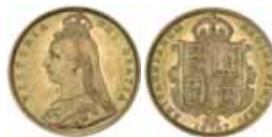
1407* Queen Victoria , Jubilee head, 1887 Melbourne (McD.33c). Choice uncirculated and rare in this condition.

Ex Reserve Bank of Australia Sale (lot 767).