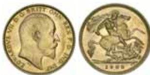
1430* Edward VII , 1908 Sydney. Choice, brilliant uncirculated.