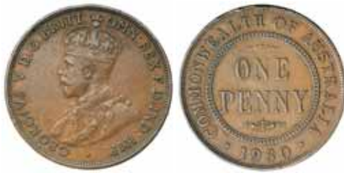
1573* George V , 1930, Indian die. Rim damaged at top, otherwise good fine and rare.