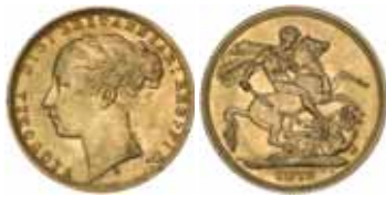
1338* Queen Victoria , 1872 Sydney. Stain on obverse and scratch on neck, extremely fine/good extremely fine.