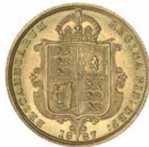
1408* Queen Victoria , Jubilee head, 1887 Sydney (McD.32). Gem uncirculated and rare thus.