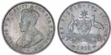
1464* George V, 1913. Minor surface marks on obverse, attractive light grey and brown toning, uncirculated and very rare in this condition, one of the finest known.