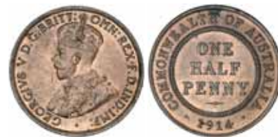
1578* George V , 1914. Lightly toned on highlights, full original mint red, choice uncirculated and rare in this condition.