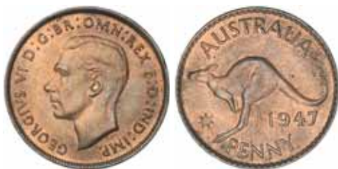
1576* George VI , 1947Y. Full original mint red, uncirculated.