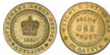
1277* Adelaide pound , 1852, second type with crenellated inner circle on the reverse, later die state, five raised dots above 22 c(arats). Hairline on reverse, attractive mint bloom, nearly uncirculated and rare, especially in this condition.