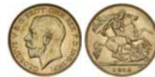
1436* George V , 1915 Melbourne. Uncirculated.

Private purchase from Winsor & Sons 5 May 2005.