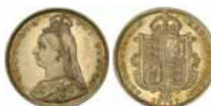
1409* Queen Victoria , Jubilee head, 1887 Sydney (McD.32a). Obverse brilliance, uncirculated and rare in this condition.