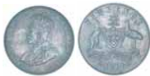
1512* George V , 1912. Die break from emu to rim, subdued frosty mint bloom, nearly uncirculated and rare in this condition. $1,000