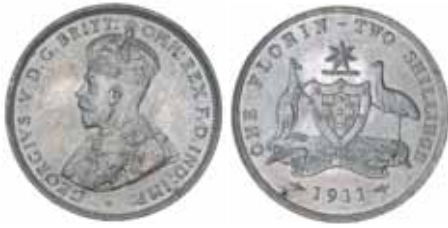
1461* George V, 1911. Full original mint bloom, nearly uncirculated/choice uncirculated and rare in this condition, one of the finest known.