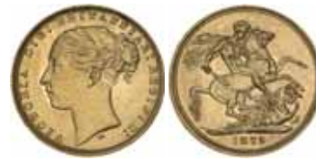
1343* Queen Victoria , 1875 Melbourne. Good extremely fine.

Ex Douro Cargo (lot 861 part) and Noble Numismatics Sale 53 (3639).