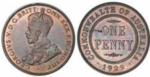
1572* George V , 1929, London die. Carbon lamination spot left of O of One, otherwise subdued red and brown uncirculated and rare thus.