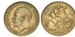
1434* George V , 1911 Perth. Nearly uncirculated and scarce in this condition.

Private purchase from Winsor & Sons 5 July 2005.