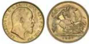
1427* Edward VII , 1907 Melbourne. Shallow strike in the centre, frosty mint bloom, nearly uncirculated and rare thus.

Private purchase from Winsor & Sons 8 August 2005.