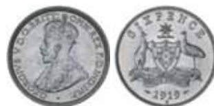
1517* George V , 1919M. Full mint bloom, uncirculated/choice uncirculated and rare thus. $2,000