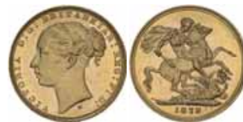
1348* Queen Victoria , 1879 Melbourne. Minor contact marks, otherwise uncirculated.