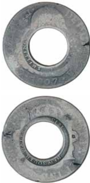
1275* New South Wales , five shillings or holey dollar, 1813, struck on a Charles III eight reales, 1807T.H. Mexico City Mint (Mira-Noble unlisted, A/3; 1/4). Evenly worn, a 4mm flan crack at 3 o'clock and an old cut at 4 o'clock on reverse, good/very good, the reverse countermark complete and very rare.