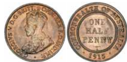
1580* George V , 1915H. Usual soft strike on the obverse, considerable original mint red, nearly choice uncirculated and very rare in this condition, one of the finest known.