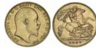
1432* Edward VII , 1909 Perth. Extremely fine or better and rare in this condition.

Private purchase from Winsor & Sons 5 May 2005.