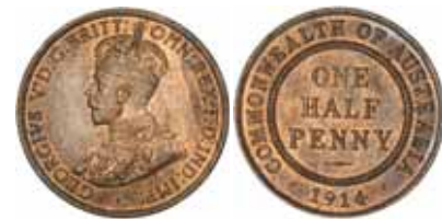
1579* George V , 1914. Mottled toning, nearly full original mint red, uncirculated and rare thus.