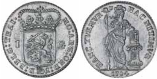
1274* Netherlands , Utrecht, silver gulden, 1794 (KM.102). Original mint bloom, nearly uncirculated. $150