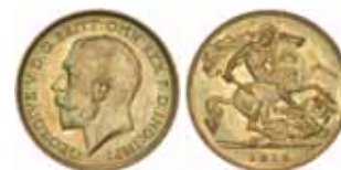
1435 George V , 1911, 1912, 1914, 1915 and 1916 Sydney. All attractive uncirculated. (5)

Ex Reserve Bank of Australia Sale (lot 929).