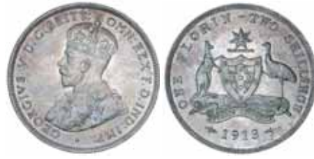
1465* George V, 1913. Lightly toned with nearly full original mint bloom, choice uncirculated and very rare in this condition, one of the finest known.