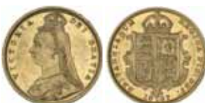
1406* Queen Victoria , Jubilee head, 1887 Melbourne (McD.33a). Good extremely fine and rare.

Ex Noble Numismatics Sale 93 (lot 1416).