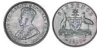
1515* George V , 1917M. Full frosty mint bloom, light toning on the reverse, uncirculated/choice uncirculated and rare in this condition. $3,500