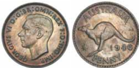
1575* George VI , 1946. Subdued mint bloom, nearly uncirculated.