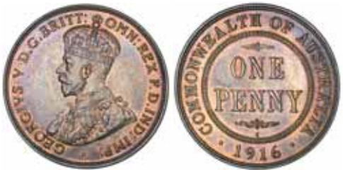
1565* George V , 1916I. Red and blue brown, uncirculated.