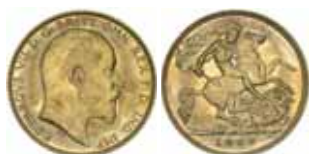
1431* Edward VII , 1909 Melbourne. Uncirculated, flat on high points of reverse.

Ex Noble Numismatics Sale 78A (lot 1391).