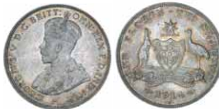
1466* George V, 1914H. Golden brown toned original mint bloom, uncirculated and very rare in this condition, one of the finest known.