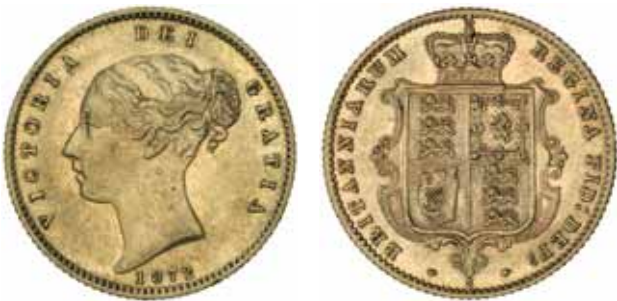
lot 1389 (2x)

Ex Reserve Bank of Australia Sale (lot 638).