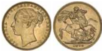
1340* Queen Victoria , 1873 Sydney. Extremely fine/good extremely fine.

Private purchase from Monetarium May 1995.