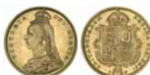
1410* Queen Victoria , Jubilee head, 1887 Sydney (McD.32b). Uncirculated/choice uncirculated and rare.

Ex Reserve Bank of Australia Sale (lot 751).