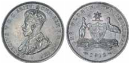
1463* George V, 1912. Lightly toned with subdued mint bloom, uncirculated and very rare in this condition.