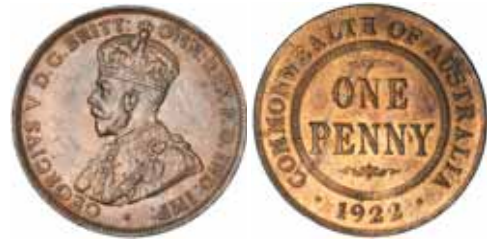
1568* George V , 1922 London die. Obverse brown toned, reverse full original dusty mint red, uncirculated/choice uncirculated and rare in this condition.