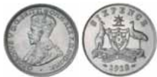
1511* George V , 1912. Has been dipped and polished, otherwise nearly uncirculated and very rare in this condition. $2,000