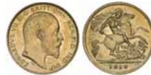
1433* Edward VII , 1910 Sydney. Full mint bloom, choice uncirculated.

Private purchase from Winsor & Sons 8 August 2005.