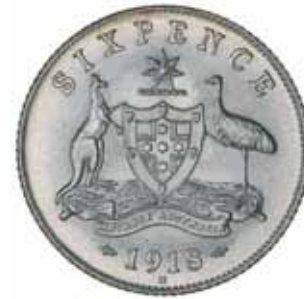
1516* George V , 1918M. Full frosty mint bloom, uncirculated/choice uncirculated and very rare in this condition, one of the finest known. $17,500