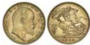
1429* Edward VII , 1908 Perth. Nearly extremely fine and rare thus.