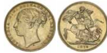
1344* Queen Victoria , 1875 Sydney. Good very fine/extremely fine.

Ex Douro Cargo (lot 1555 part) and Noble Numismatics Sale 53 (lot 3656).