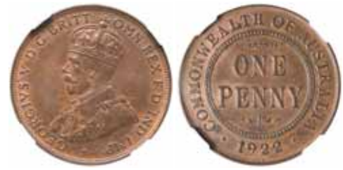
1569* George V , 1922, London die. Brown and red, uncirculated and rare in this condition.