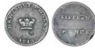
1276* New South Wales , fifteen pence or dump, 1813 (Mira dies D/2) traces of the reverse of the host coin on the obverse. Reverse edge bent at 4 o'clock and dent under crown, otherwise good fine and rare.