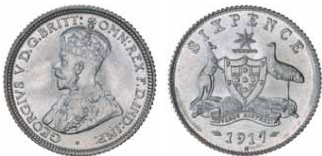
1513* George V , 1917M. Full original mint bloom, gem uncirculated and rare, one of the finest known. $4,000