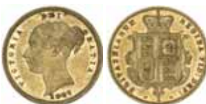
1404* Queen Victoria , young head, 1887 Melbourne. Nearly extremely fine and rare.

Private purchase from Winsor & Sons 10 September 2007.