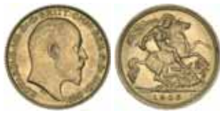
1426* Edward VII , 1906 Sydney. Choice uncirculated.