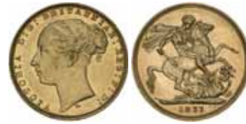
1346* Queen Victoria , 1877 Melbourne. Good extremely fine.

Ex Douro Cargo (lot 1162 part) and Noble Numismatics Sale 53 (lot 3681).