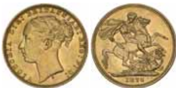
1342* Queen Victoria , 1874 Sydney. Some contact marks, otherwise nearly uncirculated.

Ex Douro Cargo (lot 722) and Noble Numismatics Sale 53 (lot 3651).