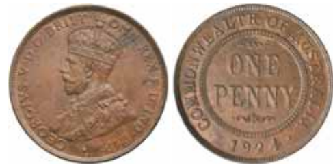
1570* George V , 1924, London die. Brown with mint red on reverse, uncirculated.