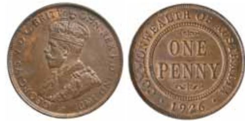
1571* George V , 1926, London die. Glossy brown and red uncirculated and rare in this condition.