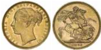
1339* Queen Victoria , 1873 Melbourne. Good extremely fine.

Private purchase from Monetarium May 1995.