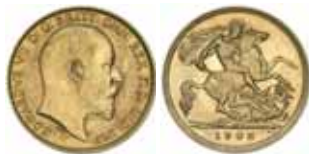
1428* Edward VII , 1908 Melbourne. Uncirculated.