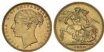
1341* Queen Victoria , 1874 Melbourne. Nearly extremely fine/extremely fine.

Ex Douro Cargo (lot 825 part) and Noble Numismatics Sale 53 (lot 3628).