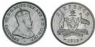
1509* Edward VII , 1910. Nearly uncirculated/uncirculated. $300