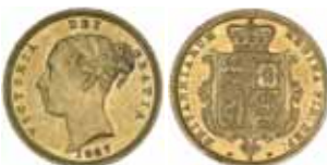
1405* Queen Victoria , young head, 1887 Sydney. Nearly uncirculated.

Ex Reserve Bank of Australia Sale (lot 734).