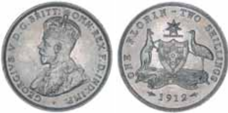
1462* George V, 1912. Full original mint bloom, uncirculated/choice uncirculated and very rare in this condition, one of the finest known.