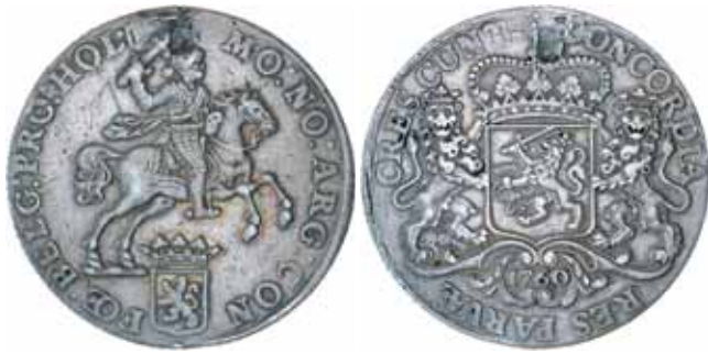
1273* Netherlands , Holland, silver rider or ducaton, 1760 (KM.90.2). Old clip suspension removed, toned good fine. $120