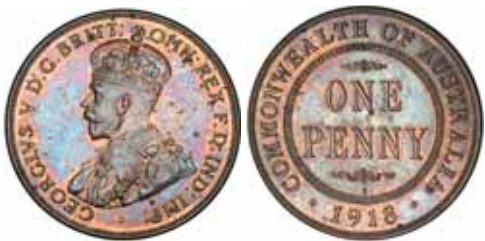
1567* George V , 1918I. Flaw above date, glossy blue brown and red, uncirculated and rare in this condition.