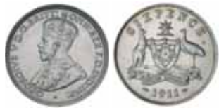
1510* George V , 1911. Has been silver polished, brilliant, good extremely fine. $800