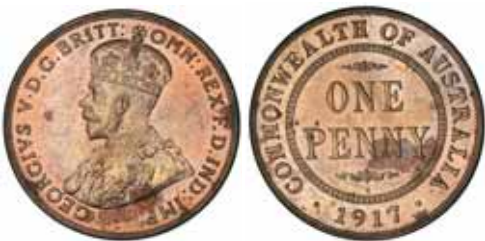
1566* George V , 1917I. Peripheral die breaks on obverse at 6 o'clock, minor carbon stain, otherwise brilliant full mint red, choice uncirculated and rare in this condition.