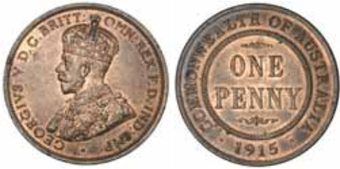
1564* George V , 1915. Obverse rim nick at 9 o'clock, otherwise red and brown uncirculated.