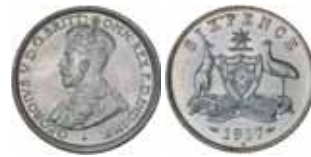
1514* George V , 1917M. Minor friction on cheek, otherwise full frosty mint bloom, choice uncirculated and rare in this condition. $4,000