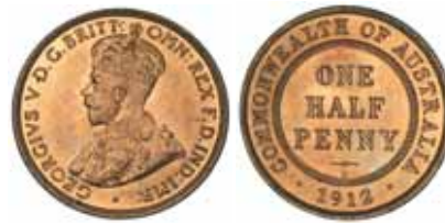
1577* George V , 1912H. Full original mint red, gem uncirculated.