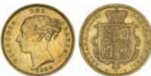
1403* Queen Victoria , 1886 Sydney. Nearly uncirculated and very rare in this condition.