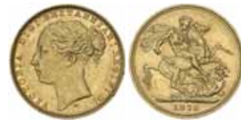
1347* Queen Victoria , 1878 Melbourne. Nearly extremely fine.

Ex Douro Cargo (lot 772 part) and Noble Numismatics Sale 53 (lot 3707).